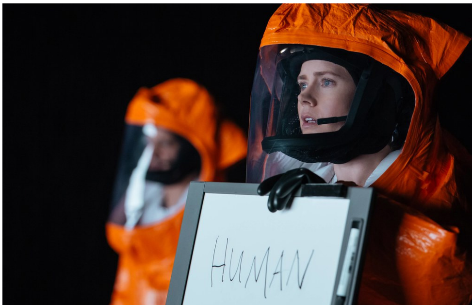
Figure 2: Dr. Louise Banks in Denis Villeneuve’s Arrival , attempting to communicate to the Heptapods a linguistic concept that serves as foundation for their encounter.

lished on the film’s concepts underscore both the public and scientific interest in the SWH. 8,9,10 The film’s use of the scientific field of linguistics to ground a fantastical concept—such as nonlinear perception—is relatively novel in science fiction, opening up different avenues for intellectual conversation and pursuits. However, the SWH runs the risk of being conflated in its association with Arrival and other fictional renditions of its applications. In reality, it is still bound within the limits of human language acquisition processes and how much our brains can support the understanding of linguistic structures.