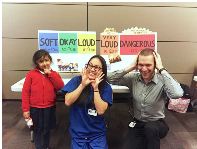
Figure 3: Event with UCSF Children's Communication Center. This image depicts two UCSF staff interacting with a child in front of a diagram depicting degrees of hearing.

Many quantitative research studies paint a superficial picture connecting socio-demographic factors and health outcomes. They can give a little bit of insight into who might be more at risk or how to approach these problems, but at the end of the day, the best way to address these challenges is to understand who your patients are and learn from them so that you can support them in a way that meets