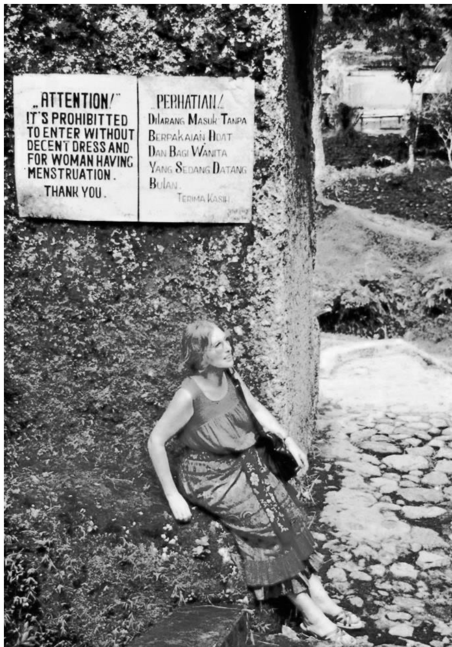
Figure #3: A woman in Bali standing next to a sign that reads “ATTENTION: It’s Prohibited To Enter Without Decent Dress And For Woman Having Menstruation. Thank You,” showing the ubiquitous stigma surrounding periods.

Androcentrism is the emphasis of male-centered narratives within universal human issues – for example, since periods are not a male phenomenon, medical research has historically pushed menstrual questions to the margins. Many scientists have habitually assumed that research centered around the male-worldview can be applied to females (but not the other way around). Thus, researchers tend to ignore the distinct anatomies and processes of female bodies, deeming them extraneous. In fact, it was not until 2016 that the National Institutes of Health (NIH) mandated the Sex as a Biological Variable (SABV) policy, which recognizes sex as an important variable to consider when designing and interpreting studies. 9 Before this act, scientific studies were mainly based on research garnered