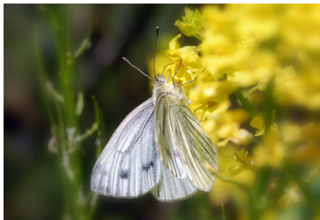
Figure 2: A cabbage white butterfly engaging in pollination behavior.

For example, in California almond orchards, changing wind speeds has impacted the pollination process carried out by a diverse host of species. At low wind speeds, honey bees pollinated towards the top of the flowering almond tree. However, as wind speeds increased, the spatial preferences of the honey bees shifted, favoring the lower portions of the tree, which provided more coverage and protected them from being disrupted by the wind. This adaptation demonstrates how pollinator species can adjust in the face of a