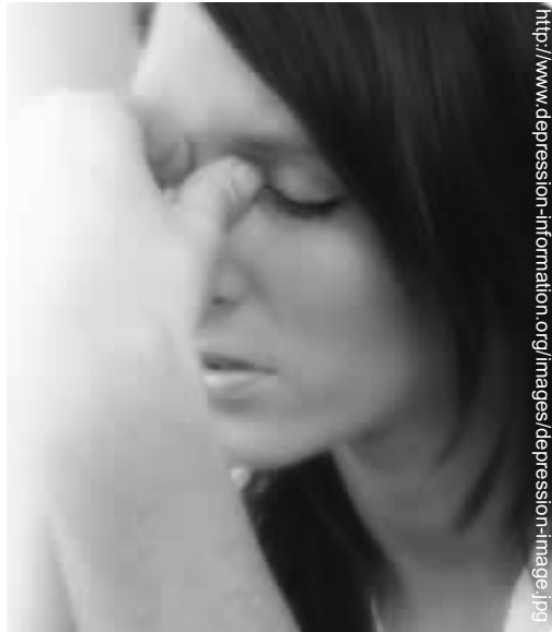
There seems to be a U-shaped age curve with happiness levels. Younger and older people are happier than those in their forties and fifties. This trend may be due to unfulfilled expectations followed by acceptance in later years.

cause an increase in levels of happiness, there is a tendency for happiness levels to drop back down to a basal level due to adjustment and to the wearing off of novelty. An example of the hedonic treadmill is illustrated by one study in which lottery winners returned to prior levels of happiness despite