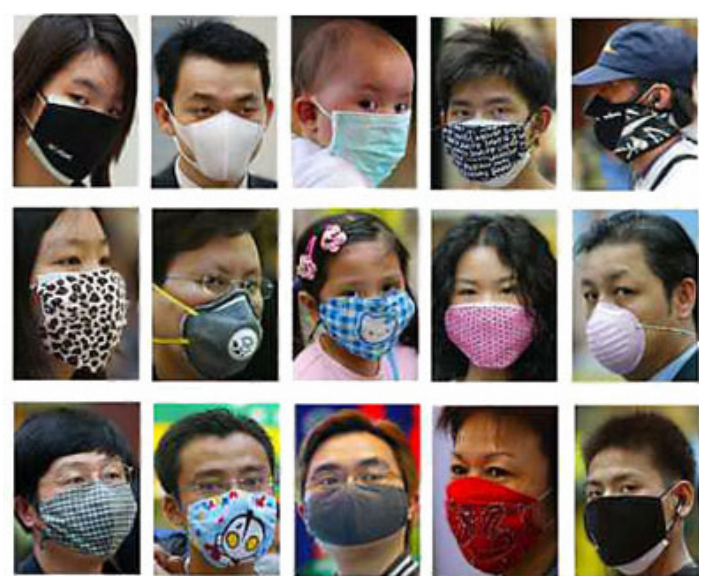
Figure 1. Increasingly intertwined global social and economic networks caused SARS to skyrocket to an international concern.

It may appear as though the preceding discussion has oversimplified the mechanisms of disease, and this is indeed the case. The propagation of disease is a matter of contact, but we must further specify the nature of this contact before proceeding. The one mode of disease propagation over which a society can often have virtually no control is in utero transmission, whereby a disease is passed from mother to