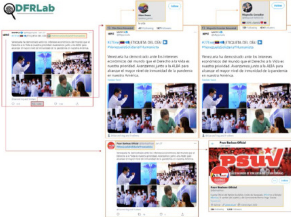
The flow of a single “etiqueta del día,” with the MPPCI account introducing it (left), two accounts—both of which exhibit suspicious behavior, such as anonymity, extremely high posting rates, and ratio of retweets to original tweets—retweeting it (top middle and right), and a PSUV-affiliated account reusing it (bottom). 58