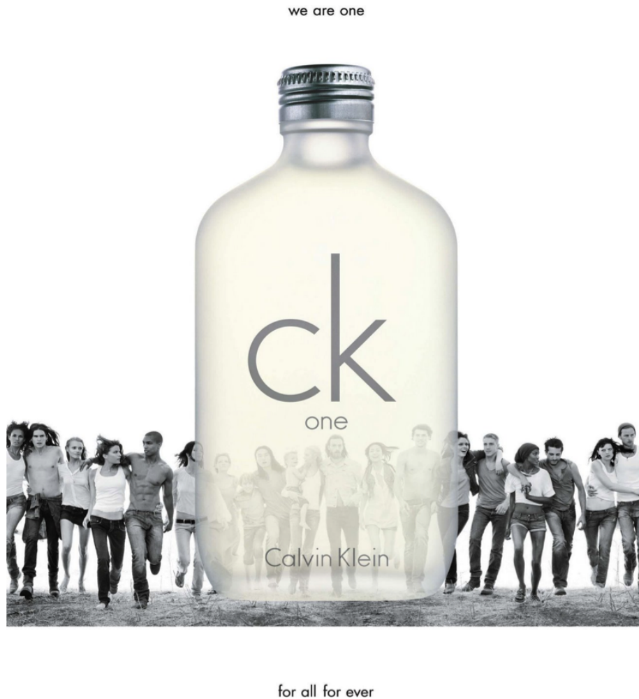
Fig. 1: ck one by Calvin Klein. Advertisement. Rolling Stone Mar. 5 2009: 11.

Calvin Klein's ck one brand existed for years before Barack Obama was elected president, always marketed as "a fragrance for a man or a woman." But the company used the occasion of his election, and his theme of inclusiveness, to re-launch its product. The slogan of the new advertisements declared "we are one for all for ever" (Figure 1).