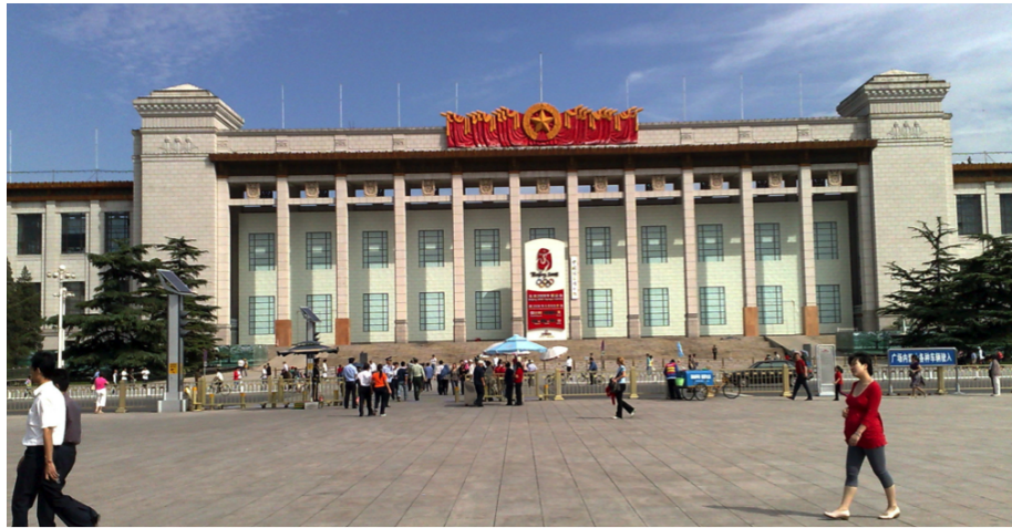
Fig. 1: National Museum in 2000, before renovation. (Tiananmen Square, Beijing).