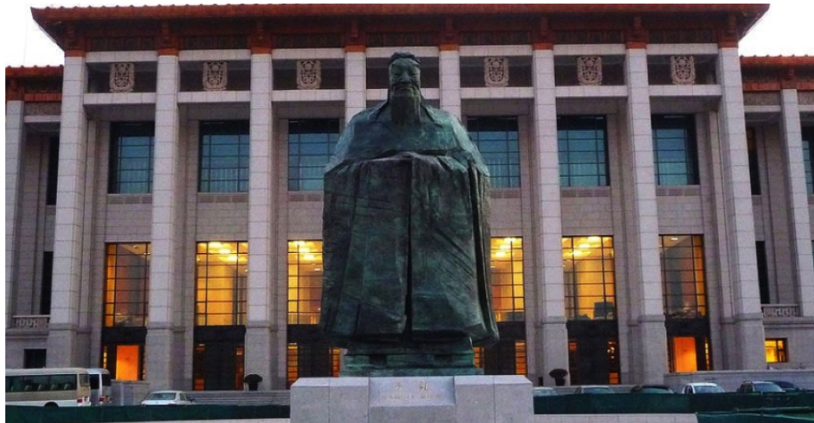
Fig. 2: National Museum in 2010, after renovation. (Tiananmen Square, Beijing).