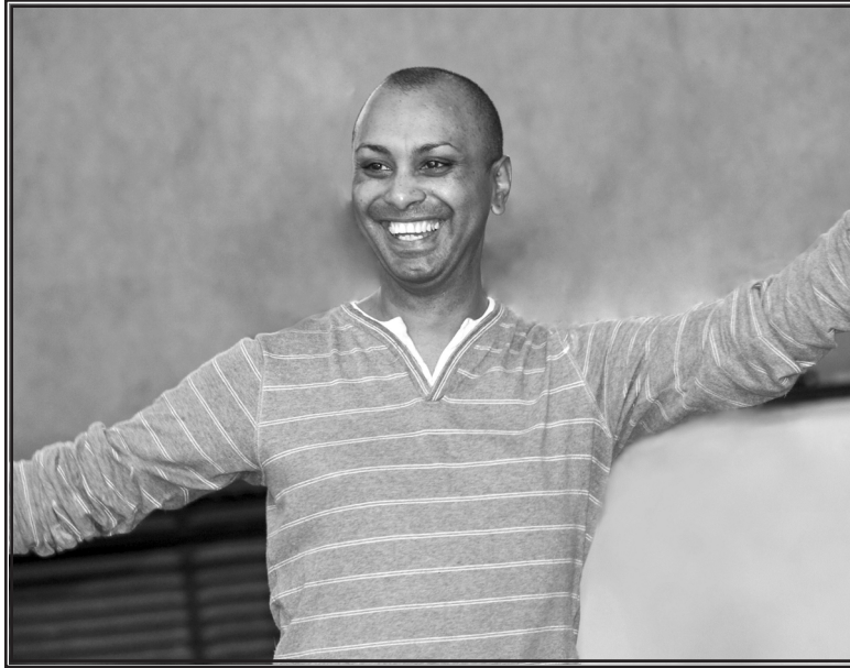
FIGURE 1.5 CONTESTANT ENJOYS MOMENT DURING REHEARSAL

There are some places you should be afraid to go to because you don't know if you are going to be attacked because of being gay...in [black] communities where its...very crowded...it's not like you will find a community like this. Especially where there is poverty and hardships.