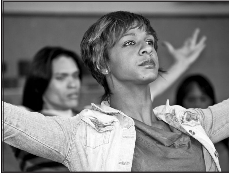
FIGURE 1.3 CONTESTANT POSES DURING PAGEANT REHEARSAL

and formative space for re-imagination. Disidentification and performance go hand in hand. While they do not operate uniformly, they work in ways that highlight the conventions that they ultimately seek to undermine. 42