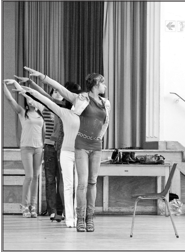
FIGURE 1.2 CONTESTANTS LEARN CHOREOGRAPHY DURING PAGEANT REHEARSAL

with the annual Coon Carnival that began in the 1930s featuring gay coloured men, commonly referred to as “moffies,” drag has symbolized a sport and lifestyle. The early incarnations of this event have raised the question of whether “moffies” play a role in undoing gender and sexuality roles or if they typify the sex-gender-sexuality system enmeshed in coloured township culture. 38