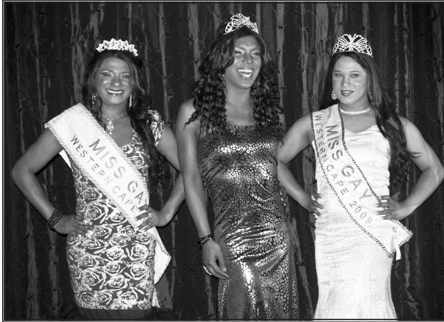
FIGURE 1.6 PAST WINNERS OF MISS GAY WESTERN CAPE POSE FOR PHOTO SHOOT

context, she articulated feeling lucky to live in South Africa, and specifically Cape Town, where Nelson Mandela provided a framework of democracy that supported gay rights. She is grateful for the number of gay clubs and the openness of the coloured community in particular that make her feel more “normal.” However when I asked her if there are times when she feels compromised in being herself, she explained that there are still suburbs (namely black townships) where she feels afraid to go for her personal safety. From her perspective, masculinity is the cornerstone of black culture, and because of this, black lesbians and other minority subjectivities are perceived as threatening: