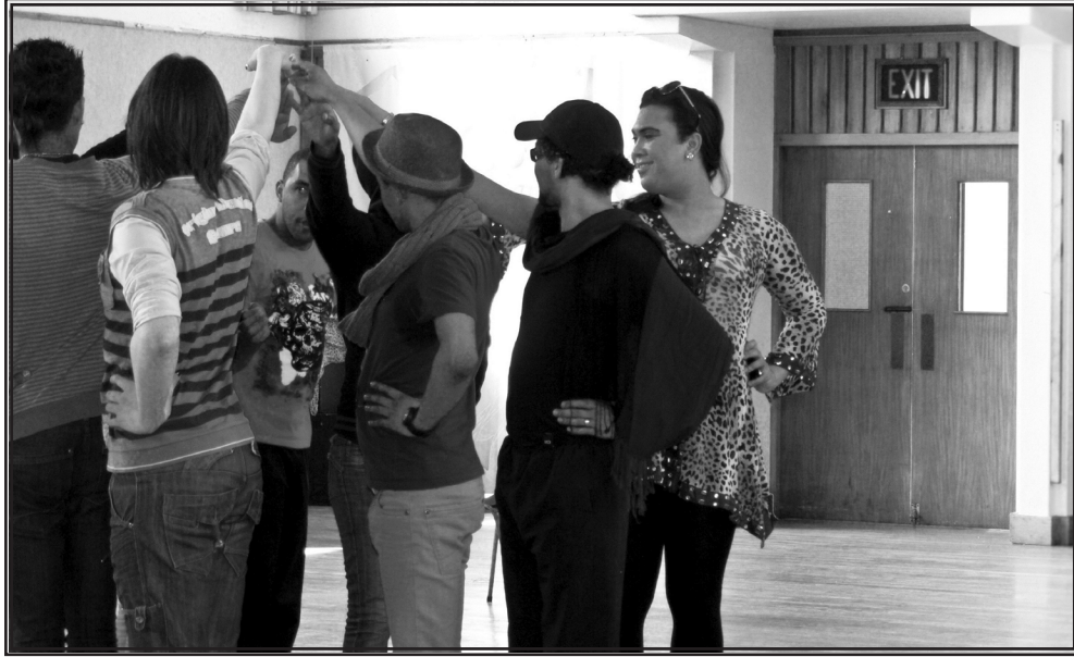
FIGURE 1.4 CONTESTANTS REHEARSE A DANCE FOR THE PAGEANT

other globally recognized city. We see the familiar bombardment of rainbow flags in Lonely with fake eyelashes and eye shadow that matches their bedazzled ballroom gowns; wigs that reach the sky. Clubs flagged as “gay friendly” blast dubstep Rihanna disco-beats, inviting both fans and the intrepid to dive into the sweaty inferno stereotypically populated by chiseled hunky men.