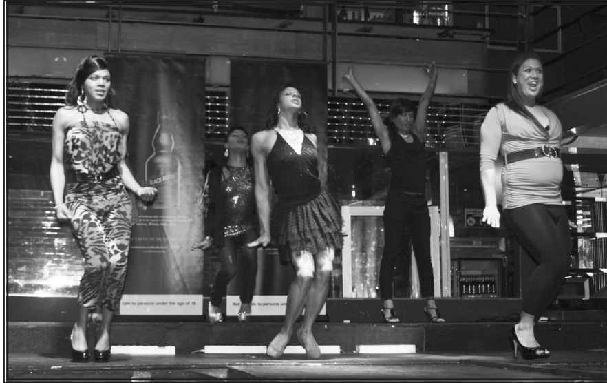
FIGURE 1.7 CONTESTANTS POSE DURING FINAL REHEARSAL

queer dance club as an example of the aforementioned queer temporality and a space that re-imagines questions around the child, relationality (break down) and futurity. More than a place for entertainment and social interaction, the interior of the dance club, particularly for younger generations, is also a source of community and, in a sense, home. Jafari's argument centers on understanding queer not through individuality and "coming out" of heteronormative structures, but instead "as a continual, dynamic project of constituting a collection of interstitial outsider perspectives...Getting our lives (together)." This definition is at once about individual experiences of self-creating/defining and achieving erotic autonomy and how they connect to the collective. This take on queer, which occurs in spaces like the Black dance club, is not constituted of cemented traditions shared between the same groups of people over time. Rather, it is shaped by shared moments that are fleeting, yet no less profound, in enabling social transcendence: