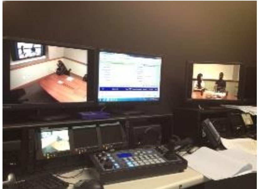
Figures 6 & 7 A wall-mounted camera is used to observe the participant's behavior. The camera transmitted to the control room, where the experimenter could observe the participant's reaction to the choking scene