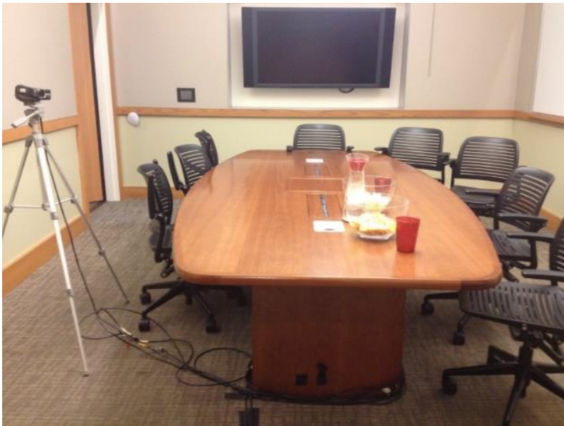
Figure 1 Room 1