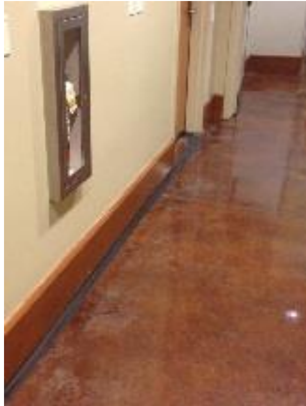
Figures 4A & 4B The camera in Room 1 was hooked up via cables to the television in Room 2