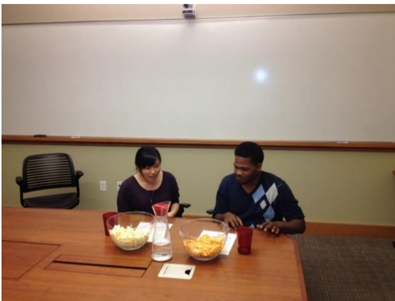
Figure 2 Actors recording the video.