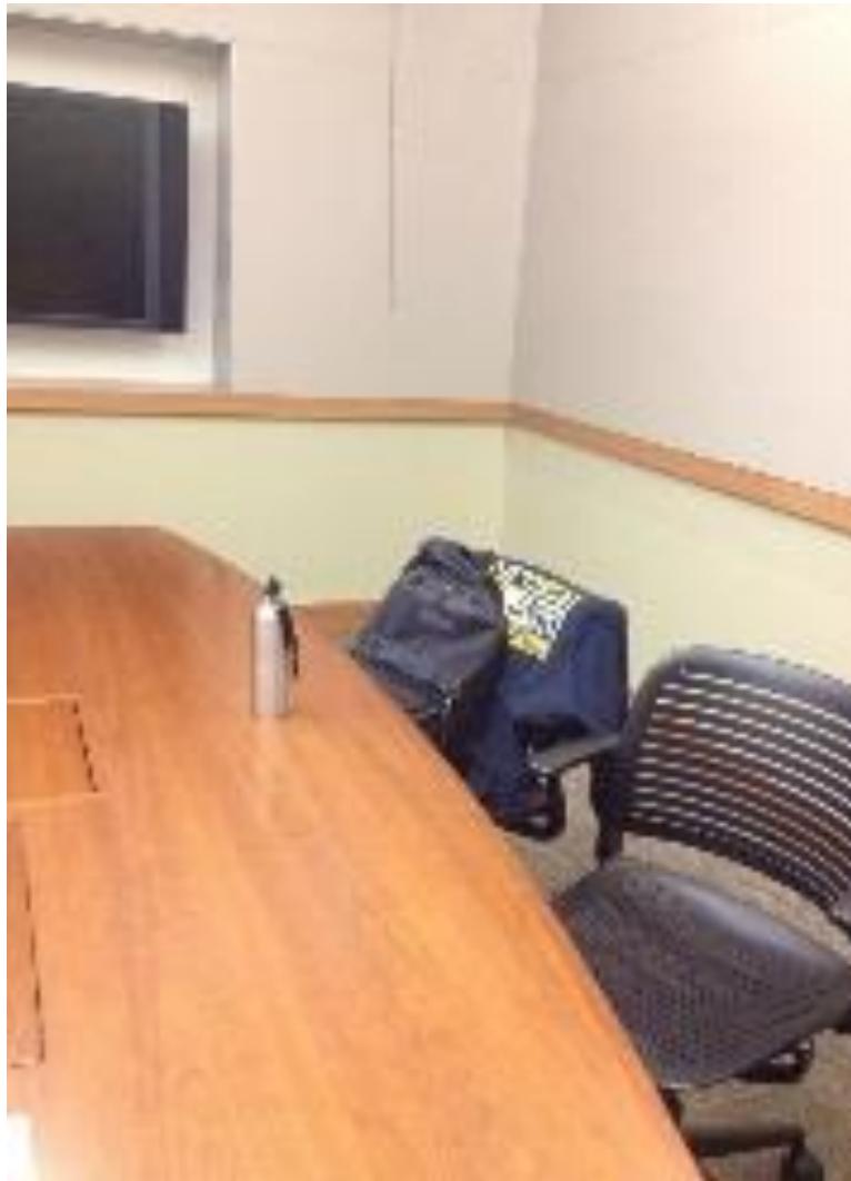
Figure 3 Room 2 with backpack, water bottle, and sweatshirt. This was done to simulate the presence of another participant