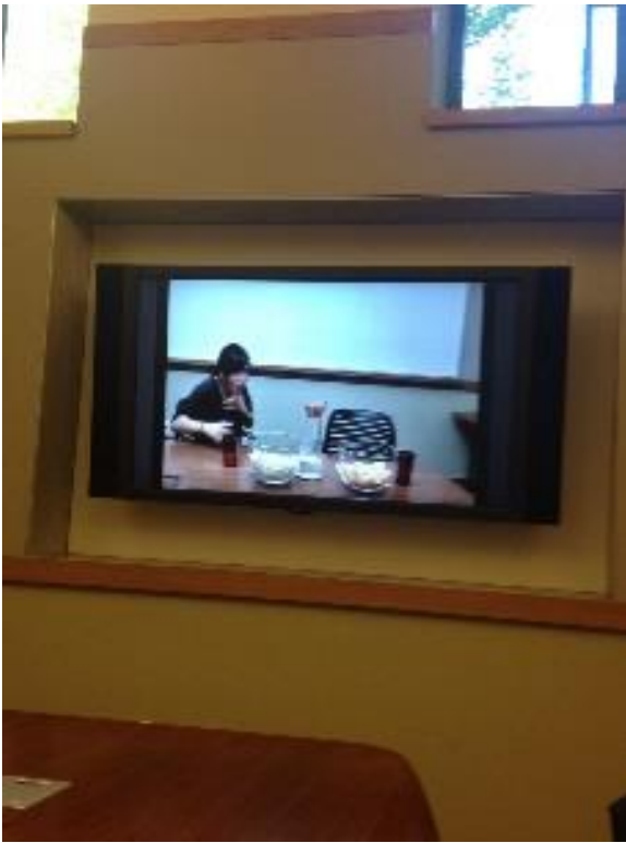
Figure 5 The subject watched what he believed to be a live interaction happening next door. In fact, he was watching the pre-recorded video