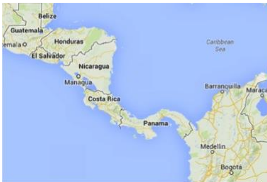
Figure 2. A map of Central America. [4] El Salvador borders Guatemala and Honduras.