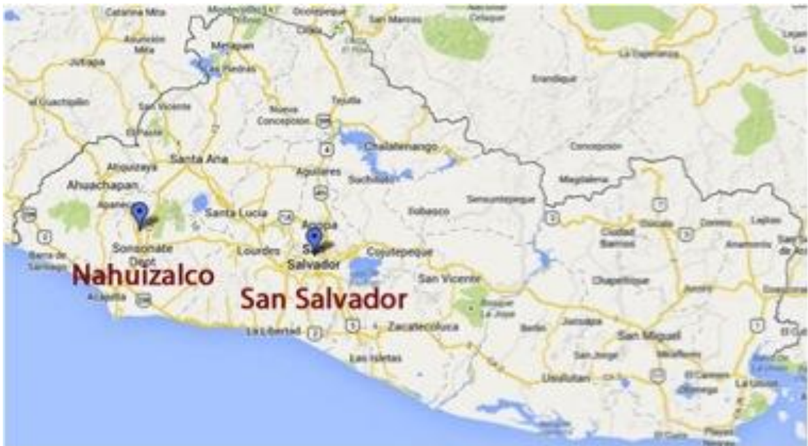
Figure 1. A map of El Salvador. [3] Nahuizalco and San Salvador are located in the western half of the country.