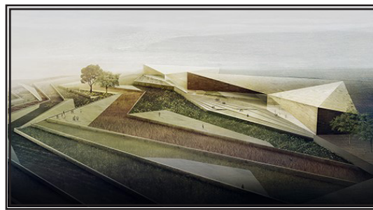
THE PALESTINIAN MUSEUM BUILDING

funded, official efforts by the PNA to shape a narrative around the Nakba and pass on its memory to future generations. Part of this effort, which is now in its construction phase, is to create a natural space that is integrated with the environment surrounding the facilities. The museum’s projected layout shows the importance of the land to the Palestinian narrative, with open windows celebrating the view of Ramallah (Figure 3), 54 an emphasis on endemic plant life, and an outlook on the Mediterranean (Figure 4) 55 —a tacit allusion to the right of return, as residents of the West Bank from villages near the coast can no longer access the sea without Israeli permits. However, similar to the case of Yad Vashem, this memorial fails to recognize validity of the Other’s claim to the area, refusing to use the word “Israel” in some of its descriptions. For instance, in speaking about partnering with other memorial institutions, cities/regions like Jaffa, Haifa, Nazareth, Acre, Shefaram, Sakhnin, Rama, Kufr Yassif, and the Negev are said to be in “1948 Areas” rather than within Israel proper. Neither Yad Vashem nor the Palestinian Museum seem ready to take steps to recognize the mere presence of the Other, let alone to formally acknowledge the other side’s narrative.