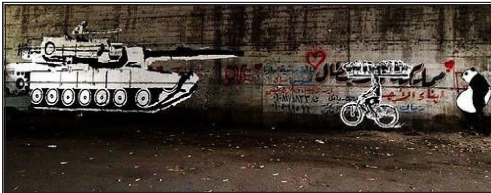
Source: by Ganzeer and friends with Sad Panda. 21 May 2011. Photo by JoAnna Pollonais. Image taken from Ibid. p. 66-67

However, such destruction did not deter the artists from returning. “As Egyptian authorities kept erasing the art by whitening the walls, artists responded with elaborated and sometimes improved versions of the previous paintings, until they excelled at the art of resisting, challenging, and insulting the counter-revolutionaries among with the wielders of power and their allies.” 72 Examining the lives of images—both their additions and their destructions—can help to understand not only government hegemony, but also the diversity of opinions in Egyptian society and the public’s relationship to such images. Therefore, “In order to have a clear understanding of history, one must not only look at the images that were preserved, but also examine those modified, appropriated, and destroyed,” whether it be by governmental forces or by citizens. 73