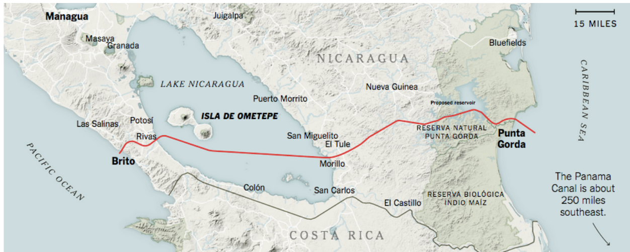
FIGURE 2: THE PLANNED CANAL ROUTE. SOURCE: NEW YORK TIMES. ("IN PARADISIACAL NICARAGUA, CONTEMPLATING A CANAL," THE NEW YORK TIMES, APRIL 24, 2015 < HTTP://WWW.NYTIMES.COM/2015/04/26/TRAVEL/26NICARAGUA-COVER.HTML?_r=0 >)

The concessions made to HKND group to build the canal granted through Law 840 quickly prompted a flurry of constitutional challenges by civil society groups who claim that—among a wide array of legal breaches—impacted communities were not sufficiently consulted, the majority of which are poor indigenous peoples and ethnic minorities. 78 The Nicaraguan constitution and Autonomy Statute, along with a multitude of international treaties, require the state to consult indigenous communities prior to interfering their territory. In passing Law 840, the state violated these legal bodies. Despite the fact that forty percent of the planned route crosses through internationally protected indigenous territory, neither the state nor HKND group have yet to receive impacted communities' approval of the project or the sale and use of their land. 79