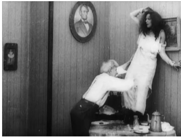
Figure 7. Left, the mob burns the bodies of Sylvia's (Evelyn Preer) parents. Right, Armand (Grant Gorman) assaults Sylvia; note the portrait of Abraham Lincoln. The two sequences are intercut. Frames from Within Our Gates (1920, Oscar Micheaux).