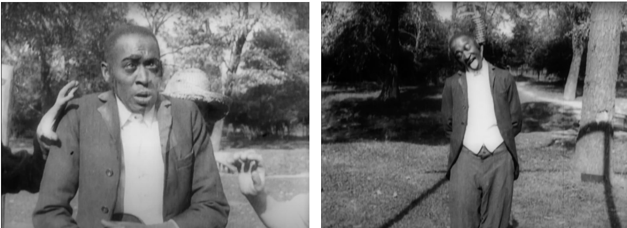
Figure 2. Left, Efrem (E.G. Tatum) is briefly horrified as the mob he has incited turns on him. Right, the next shot, following a dissolve, shows Efrem's lynched body. Frames from Within Our Gates (1920, Oscar Micheaux). Digitized and made available by the Library of Congress.