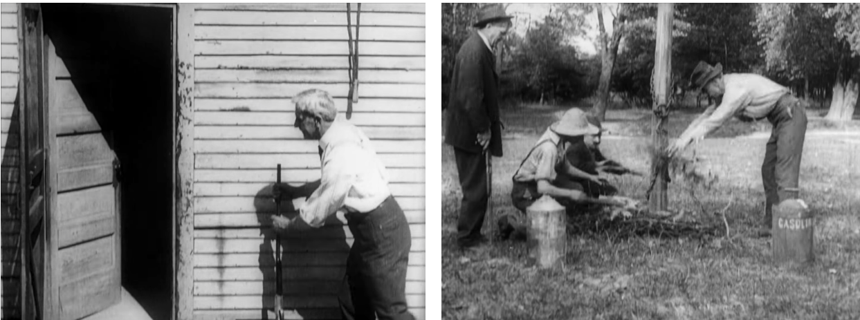
Figure 6. Left, Armand Gridlestone (Grant Gorman) sneaks up to the cabin that Sylvia has taken refuge in. Right, members of the lynch mob lay kindling to dispose of the elder Landrys’ bodies. These scenes are intercut. Frames from Within Our Gates (1920, Oscar Micheaux). Digitized and made available by the Library of Congress.