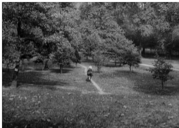
Figure 10. Left, Emil Landry (Grant Edwards) breaks free from the mob. Right, he makes his escape on horseback. Frames from Within Our Gates (1920, Oscar Micheaux).