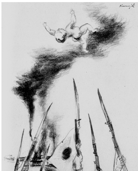
Figure 5. Yasuo Kuniyoshi, Untitled (Bayonets and Baby) , OWI Poster Design.