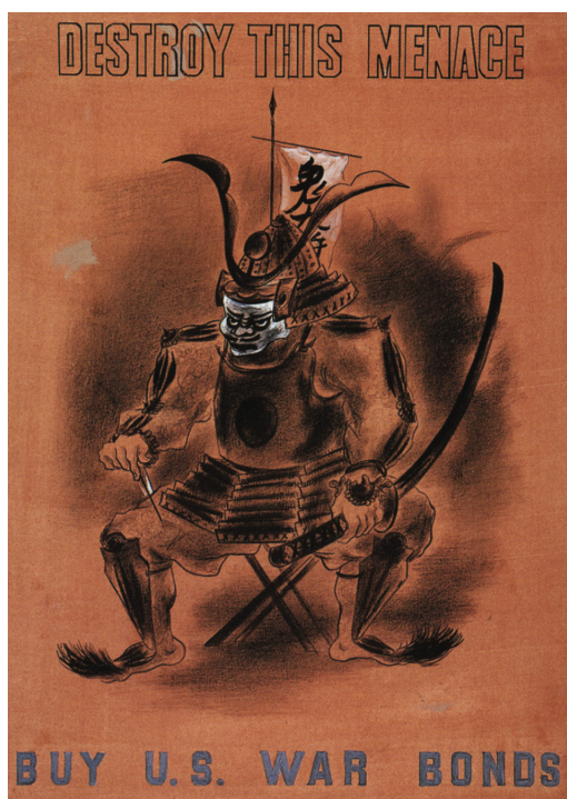
Figure 4. Yasuo Kuniyoshi, Destroy this Menace , OWI Poster Design.