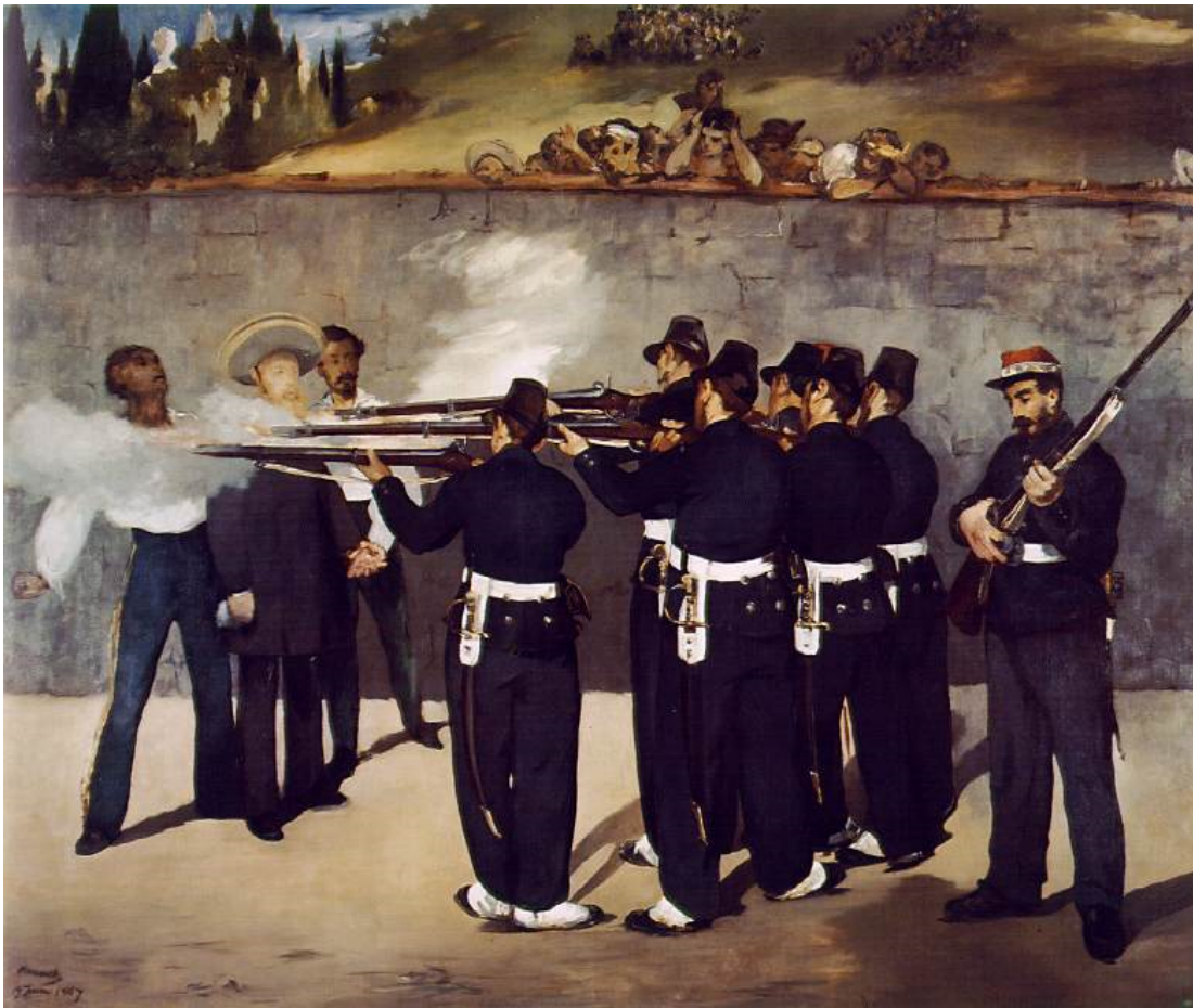
Figure 3 Eduard Manet, The Execution of Emperor Maximilian (III) , 1868-69 Oil on canvas, 252 x 302 cm Kunsthalle, Mannheim