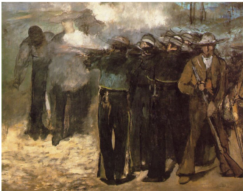
Figure 1 Eduard Manet, The Execution of Maximilian (I) , 1868-69 Oil on canvas, 48 x 58 cm Ny Carlsberg Glyptotek, Copenhagen