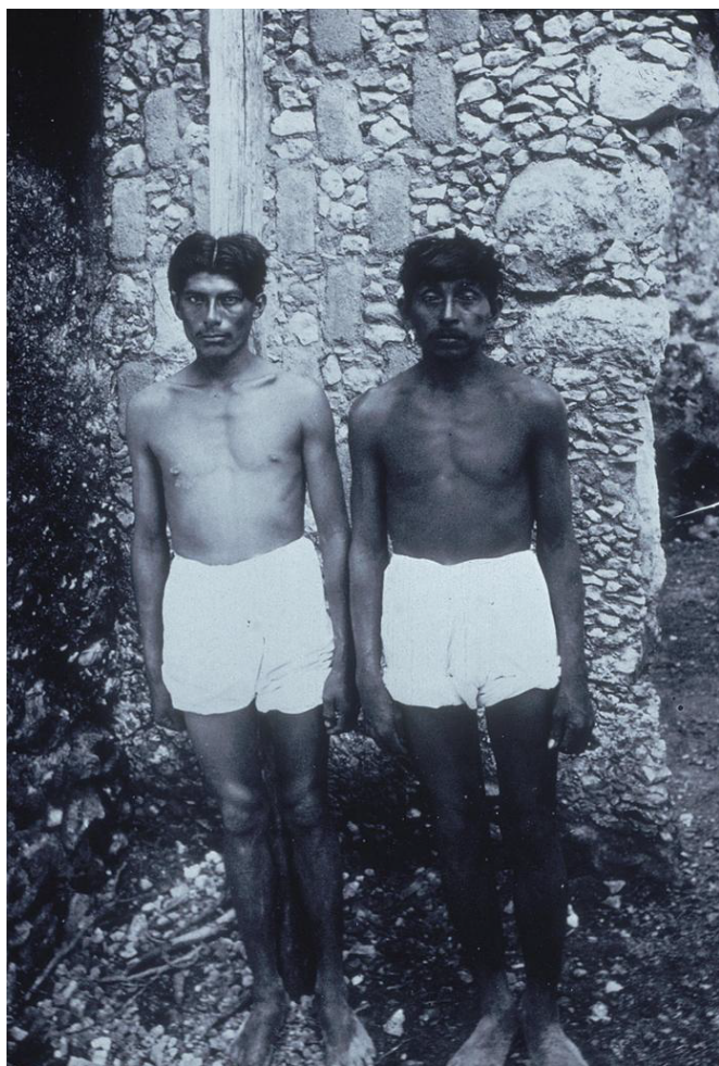
Figure 16 Desirée Charnay, Two Maya Indians from the Yucatán , 1880-82 Albumen print photograph Collection of the Musée de L'Homme, Paris