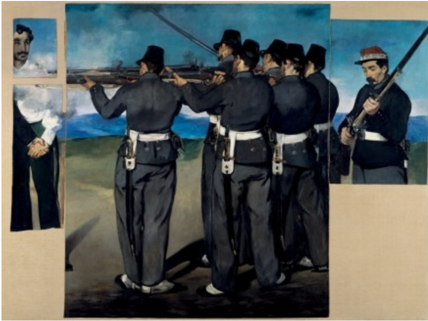
Figure 2 Eduard Manet, The Execution of Maximilian (II) , 1867-68 Oil on canvas, 193 x 284 cm The National Gallery, London