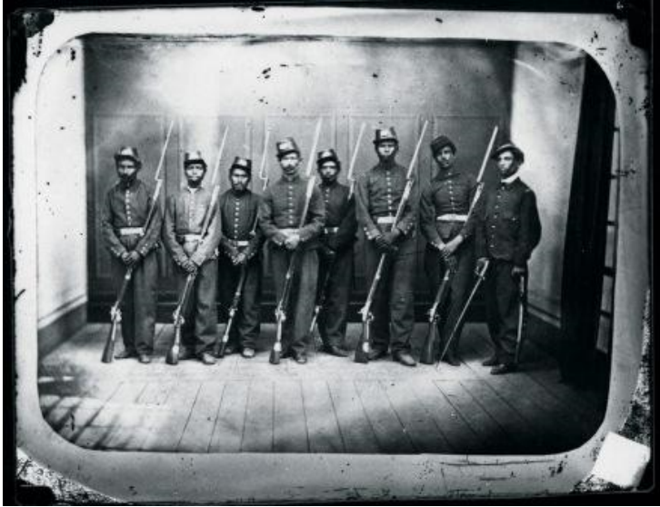
Figure 11 François Aubert, The Execution Squad standing at Ease , 1867 Contact print from the original glass negative Brussels, Musée Royal de l'Armée