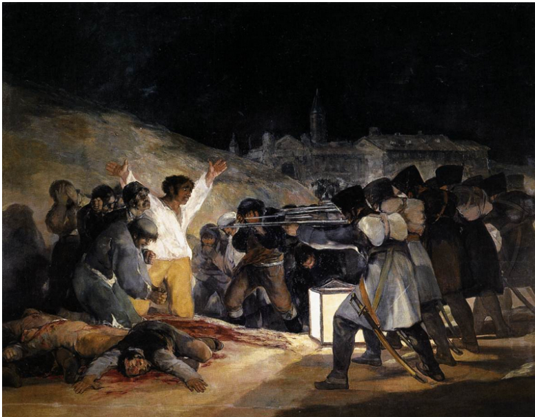
Figure 12 Francisco Goya, The Third of May 1814 Oil on canvas, 268 x 347 cm Museo del Prado, Madrid