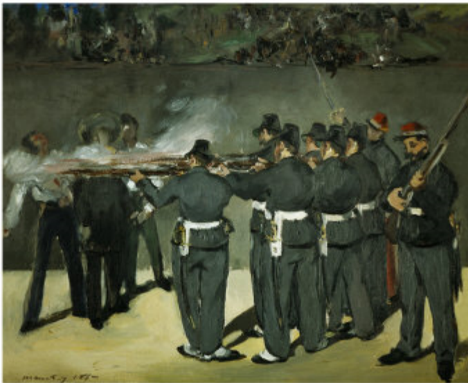
Figure 5 Eduard Manet, The Execution of Maximilian (sketch), 1868-69 Oil on canvas, 50 x 60 cm Ny Carlsberg Glyptotek, Copenhagen