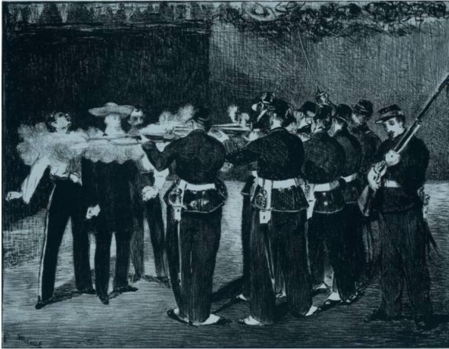
Figure 4 Eduard Manet, The Execution of Maximilian , 1868-69 Lithograph on chine collé, plate: 34 x 43.8 cm The Metropolitan Museum of Art, New York