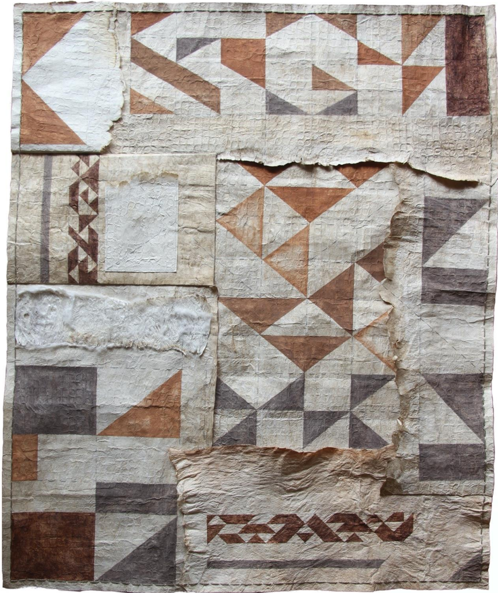
Fig. 1. Chenta T. Laury, Patchwork #1 , 2019. `Alaea (clay), hili kukui (dark brown dye), silk, and thread on tapa (bark cloth), 35.5 x 29 inches. Hawaii State Foundation on Culture and the Arts.