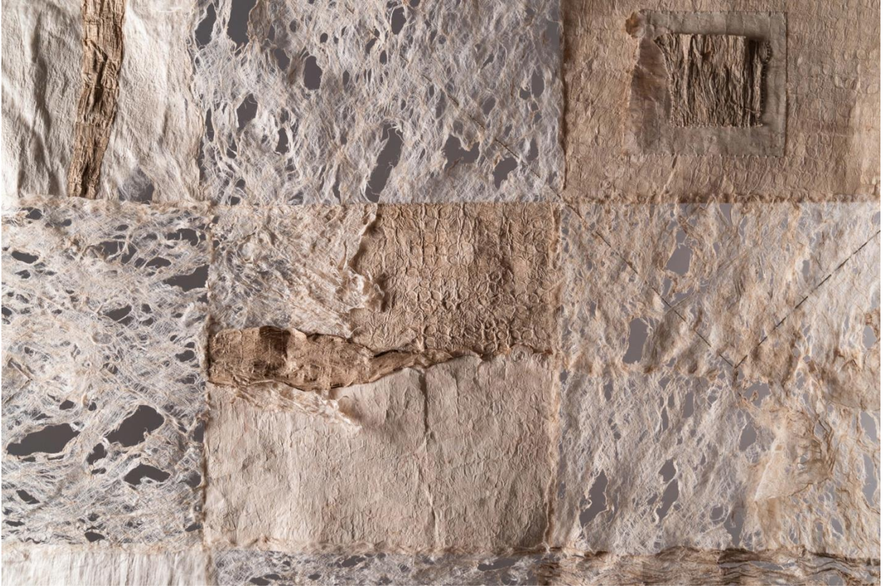
Figure 3. Chenta T. Laury, Patchwork: Holding Dichotomies (detail), 2020. Tapa (bark cloth), silk, embroidery thread, 51.5 x 63.73 inches.