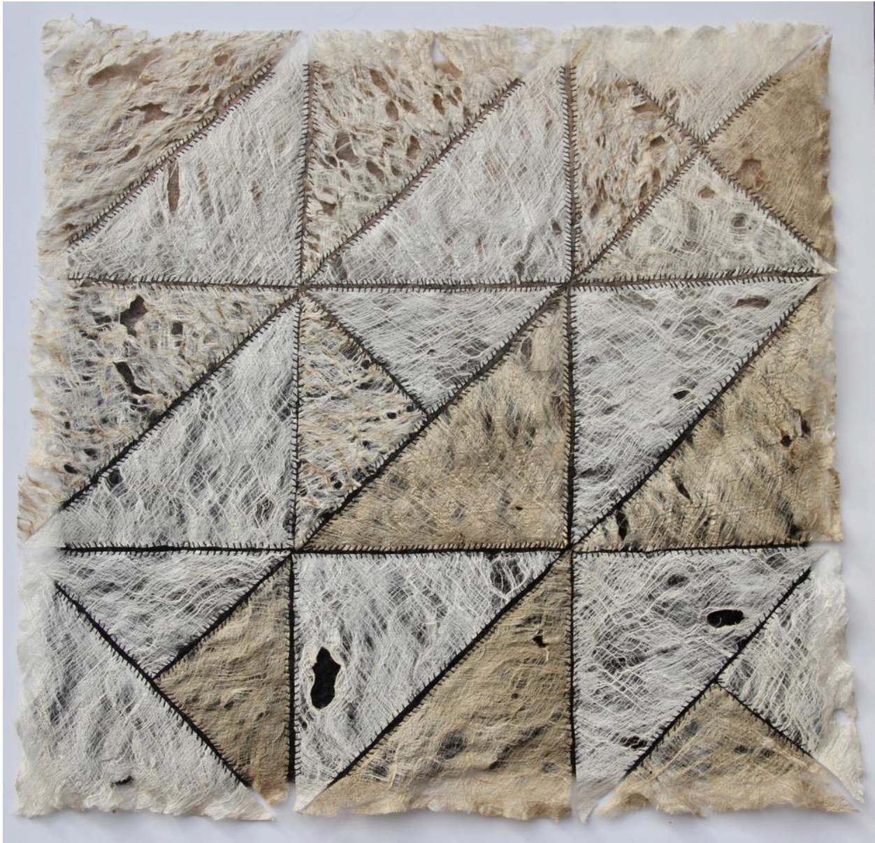
Figure 4. Chenta T. Laury, Patchwork: Yet Apart , 2020. Wool, tapa (bark cloth), cotton string, 18 x 18 inches.

Patchwork: Yet Apart explores how we are bound to a common foundation and are in dialogue with one another, yet separated by the space that remains between our “edges”—our more superficial external characteristics, such as race. Each stitch is a step toward unification and finding common ground.