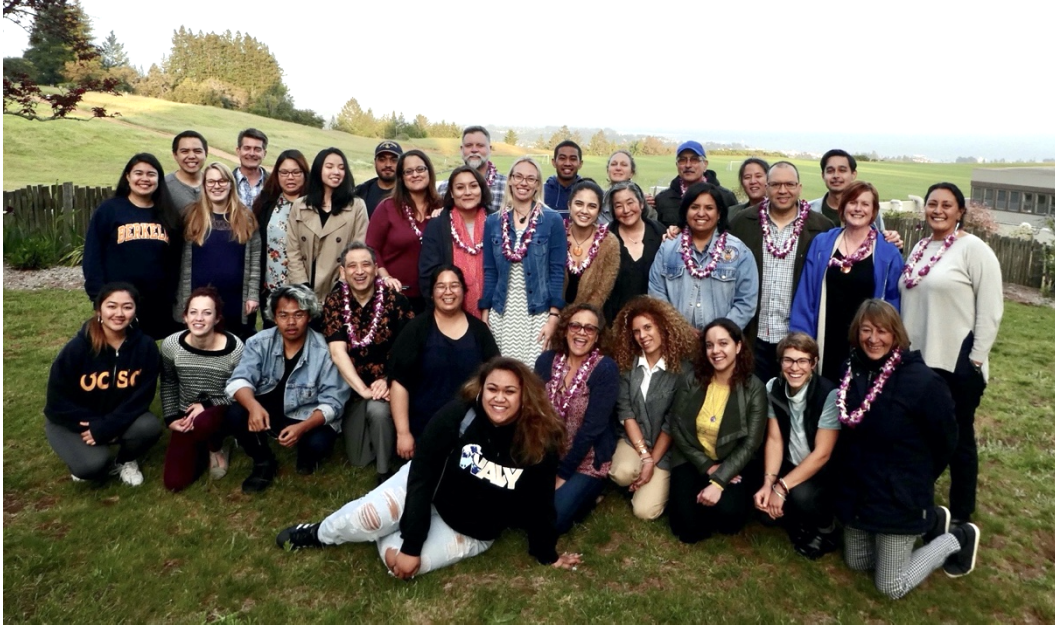
Figure 2. Some of the participants at the “Pacific Island Worlds: Transpacific Dis/Positions” symposium, May 5, 2018, University of California, Santa Cruz.

homes, establishing new communities, and forming social, cultural, and political positions in the face of ongoing dis-positioning.