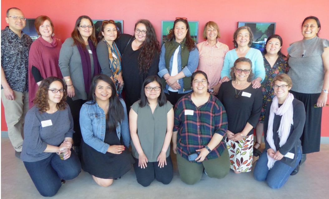
Figure 3. Some of the participants at the “Pacific Island Worlds” workshop and artist talks, May 4, 2018, University of California, Santa Cruz.