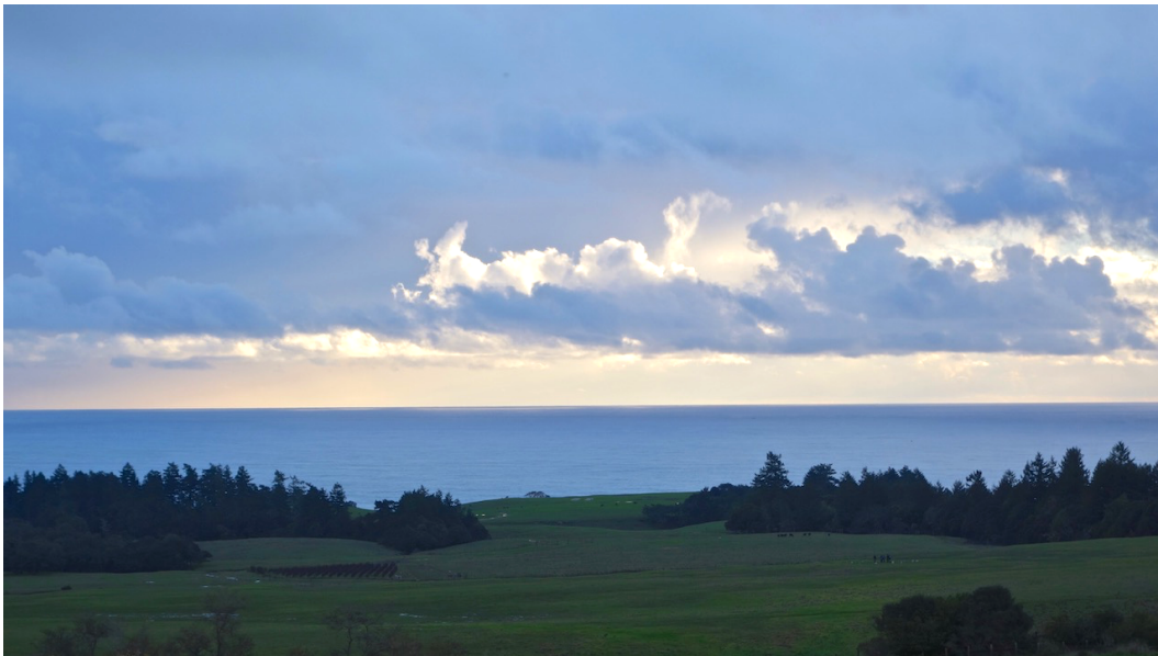
Figure 1. View from the University of California, Santa Cruz “clifftop” (see p. 5 below).

Our introduction is a story of two conferences—moments, pauses, in an ongoing flow of historical, political, and intellectual activity. The anchoring dates, 2000 and 2018, are somewhat arbitrary markers for currents (and eddies) of change beginning in the 1980s and extending into an unfinished present.