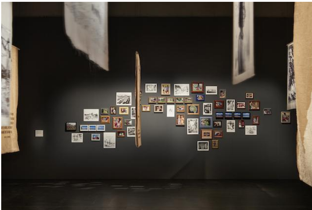
Figure 4. Installation view of the exhibition section “Teaiwa’s Kainga.” Photo “reef” featuring a combination of black & white photographs of twentieth-century mining activities on Banaba and phosphate packing and transport in Victoria, Australia, with Katerina Teaiwa’s personal photographs of twenty-first-century daily life on Rabi Island.

The valuable rock found naturally on Banaba was first identified through a rock sample from nearby Nauru, which ended up in a Sydney office of the Pacific Islands Company. The industry that grew from both islands manufactured the rock into superphosphate fertiliser, which was used extensively by farms across Australia and New Zealand. For most of the twentieth century, phosphate was a matter of global and national food security, as it dramatically increases agricultural productivity and the resulting exports. The value of the mineral on Banaba also made the island a target for Japanese occupation during World War II. Many Banabans, and Pacific Islander, or “kanaka,” mining workers from the Gilbert Islands and Ellice Islands (now Tuvalu) were killed during this period. 2