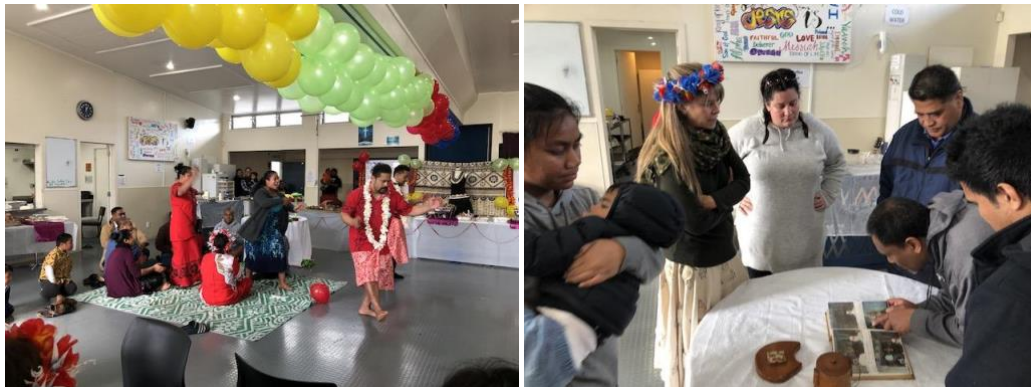
Figure 18 (left). Performance by the Banaban Christian Fellowship Hub at Ranui community hall in Waitakere.