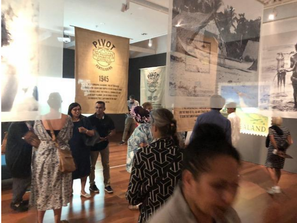
Figure 9. Opening reception of Project Banaba at MTG Hawke's Bay Tai Ahuriri, 2019.

Katerina: Aerial top dressing, the application of fertiliser via low-flying aircraft, was a critical motif for the MTG show, which was co-curated by Jess Mio. We created two new textiles and incorporated the design of a 1960 postage stamp that showed the phosphate fertiliser being applied to a field (Fig. 10). We also added quotes by Teresia on the walls of the gallery.