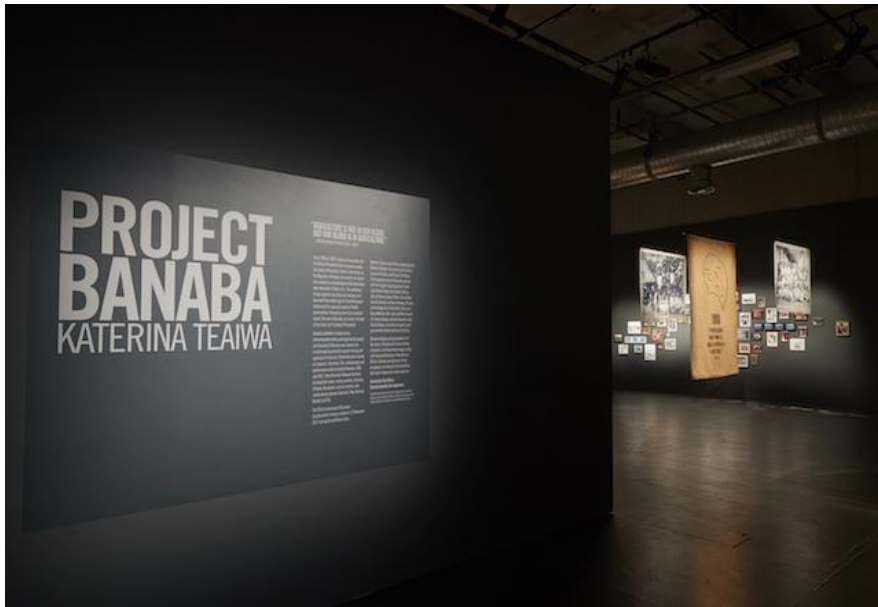
Figure 1. Entrance of Project Banaba , Carriageworks, Sydney, 2017.

Keywords: Banaba, Kiribati, Rabi, Fiji, history, contemporary art, phosphate mining, fertiliser, agriculture, community outreach, exhibitions