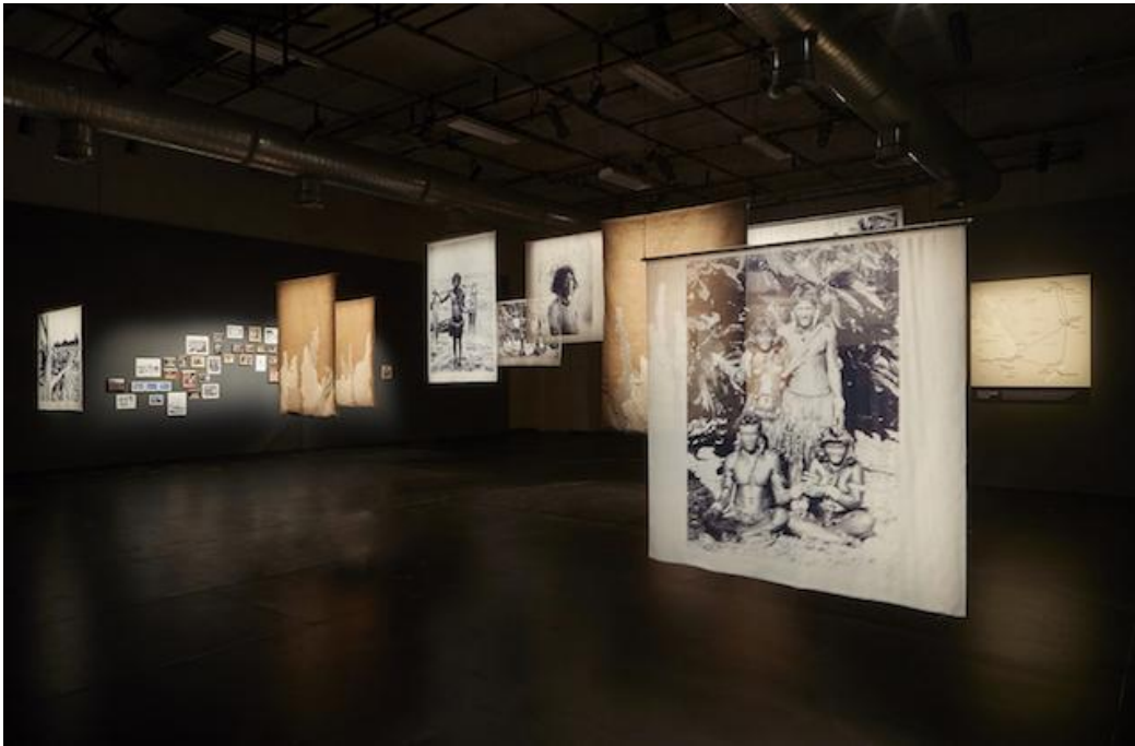
Figure 2. Installation view of “Body of the Land, Body of the People.” Voile printed with photographic portraits of ancestral Banabans and hessian sacks with calico and cotton appliqué and printed archival texts.

From 1900 to 1980, a multinational phosphate enterprise that eventually became the British Phosphate Commissioners (BPC)—owned collectively by Australia, New Zealand, and Britain—mined Banaba, also known as Ocean Island, in what is now the Republic of Kiribati. The phosphate was manufactured into superphosphate fertiliser and applied to farms across Australia, New Zealand, and beyond. As a result of the extensive mining operations and Japanese occupation during World War II, the island of Banaba was rendered uninhabitable and the Banabans relocated to the island of Rabi in Fiji in 1945. 1 The underground water stores had long been polluted by the removal of twenty-two million tons of rock and topsoil, and in 2021 Banaba ran out of fresh water for the approximately three hundred Banabans and Gilbert Islanders who live on Rabi as its caretakers.