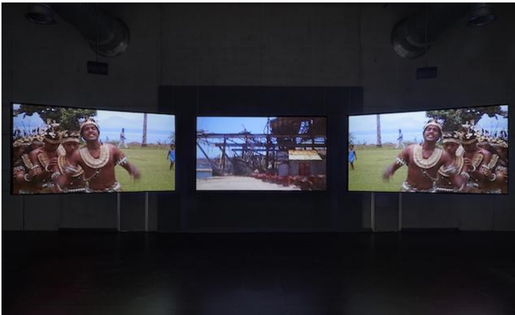
Figure 3. Installation view of the exhibition section “Mine Lands: For Teresia.” Projections and soundscape of footage from the archives and Katerina Teaiwa’s fieldwork, chronicling phosphate mining and the displacement of Banabans.

Project Banaba is a conceptually layered installation that interweaves rare textual, film, and photographic records from the National Archives of Australia and other sources with personal narratives, including stories of the political injustice endured by generations of Banaban communities. It reflects on how the rock of Banaba, te aba , was viewed and transformed by powerful imperial interests. It is divided into three sections: the first is “Body of the Land, Body of the People” (Fig. 2), which combines archival text and representations of the mined landscape on textiles meant to replicate sacks of fertiliser; information from the mining archives; and large-scale photographs of Banaban ancestors. The second section is “Mine Lands: For Teresia” (Fig. 3), a three-screen projection featuring early-twentieth-century footage of phosphate mining and life on Banaba juxtaposed with the mining’s aftermath one hundred years later. It is dedicated to the memory of Katerina Teaiwa’s older sister, the late scholar and poet Teresia Kieuea Teaiwa. The final section is “Teaiwa’s Kainga” (Fig. 4), which combines colourful family ( kainga ) snapshots of everyday life on Rabi Island in Fiji with black and white images of mining, environmental degradation, and fertiliser production and distribution.