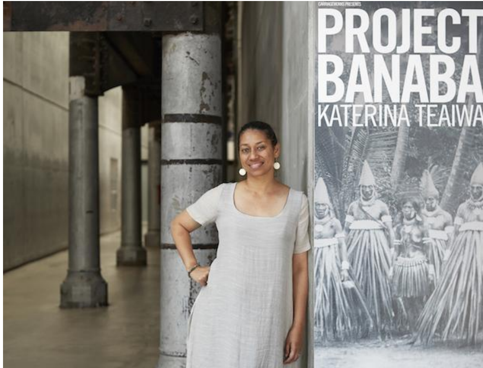
Figure 5. Artist Katerina Teaiwa at the entrance to Project Banaba at Carriageworks, Sydney, 2017.

Carriageworks, Sydney | 17 November – 17 December 2017