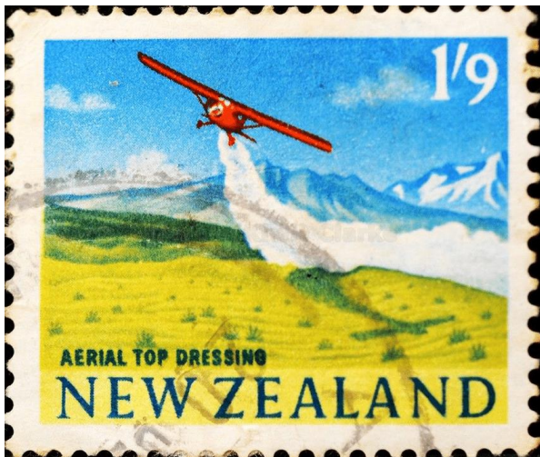
Figure 10. Aerial Top-Dressing Stamp, circa 1960. New Zealand Post Museum Collection, artwork by J.C. Boyd, produced by Harrison & Sons Ltd.

Katerina: Aerial top dressing, the application of fertiliser via low-flying aircraft, was a critical motif for the MTG show, which was co-curated by Jess Mio. We created two new textiles and incorporated the design of a 1960 postage stamp that showed the phosphate fertiliser being applied to a field (Fig. 10). We also added quotes by Teresia on the walls of the gallery.