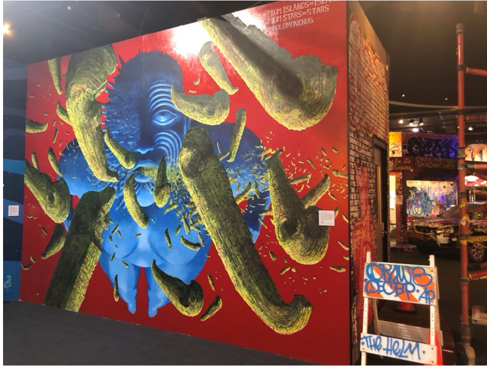
Figure 12. Solomon Robert Nui Enos, Mural, Pow! Wow! The First Decade: From Hawai'i to the World , Bishop Museum, Honolulu, Hawai'i, May 15–September 19, 2021.