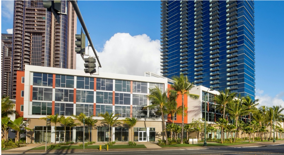
Figure 2. Design Partners Incorporated and Pappageorge Haymes, The Collection, The Lofts, 2016. Our Kaka'ako, Honolulu, Hawai'i.

divided into variously arranged sections, adding visual dimension and artistry to the exterior. These windows give the impression of wide-open interior spaces and high ceilings, architectural features usually associated with lofts and former industrial centers (Fig. 2). The fourteen four-story townhomes offer ample square footage and access to private rooftop decks (Fig. 3). Deep burgundy panels outline their white façades, while tall vertical windows visually extend the height of the building and lush foliage lines the sidewalk and entryway of each home.