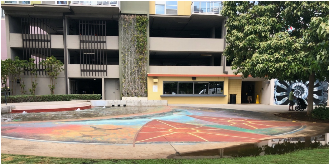
Figure 6. The Polynesian Voyaging Society and 808 Urban, Hōkūle’ā Mālama Honua , 2018. Ground mural, The Flats at Pu’unui, Our Kaka’ako, Honolulu, Hawai’i.

Today, A&B Properties, Inc. is one of the largest landowners in Hawai’i. 8 They have amassed over 89,000 acres of land and 5 million square feet of leasable space. The company positions itself as a “local company for local people.” At the time of completion in 2016, units within The Collection ranged in price from the mid–$300,000s to the low $600,000s. 9 Today, the low-end prices have nearly doubled and the higher-end prices more than tripled. In contrast, the median household income in Hawai’i from 2016 to 2020 only rose from $72,133 to $80,729—an increase of less than 12%. 10