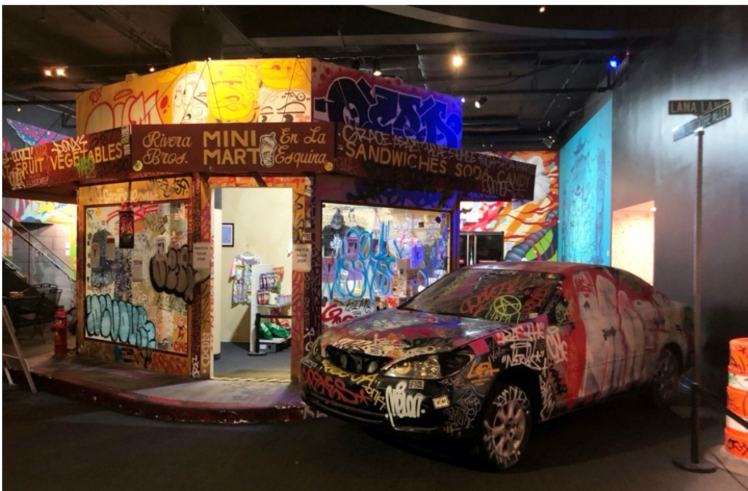
Figure 10. Detail of exhibition Pow! Wow! The First Decade: From Hawai'i to the World , Bishop Museum, Honolulu, Hawai'i, May 15–September 19, 2021.

Pow! Wow! has been the catalyst for the creative explosion in (Our) Kaka'ako. The non-profit organization hosts an annual event in the district that “brings over a hundred international and local artists together to create murals and other forms of art.” 14 Artists and community members have gathered every February since 2010 to participate in workshops, listen to live music, and attend artist talks.