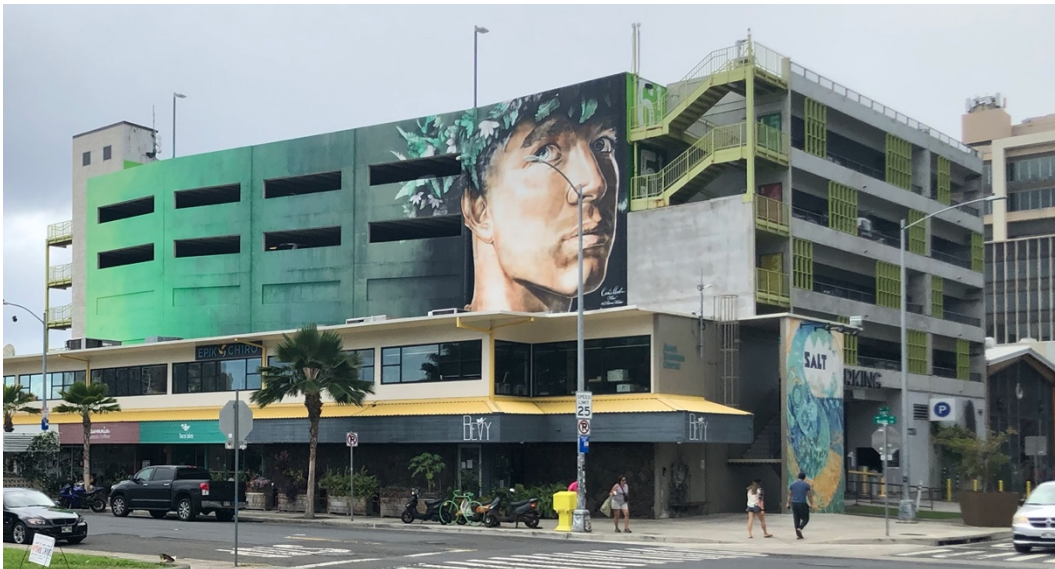
Figure 9a (top) and 9b (bottom). Kamea Hader, Naupaka and Kauai , 2016. Mural on the SALT parking structure adjacent to The Barn, Our Kaka'ako, Honolulu, Hawai'i.

The cornerstone of Our Kaka'ako's master plan is, arguably, SALT—an 85,000-square-foot space for retail businesses, restaurants, and events. The Barn at SALT is the primary communal gathering space (Fig. 7). It is an open-air event venue made from a refurbished warehouse. It is framed with concrete blocks and