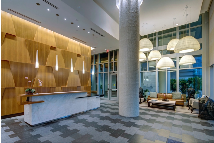
Figure 4. Philpotts Interiors, The Collection, lobby, 2016. Our Kaka'ako, Hawai'i.

The public face of The Collection is a two-story glass-enclosed lobby, which reflects an urban aesthetic of contemporary materiality. The color palette, furniture, and materials are intended to be in conversation with well-known wall murals located directly across Keawe Street at SALT. The Collection manifests an art experience, a stripped-down version of Kaka'ako's street aesthetic (Fig. 4). Philpotts Interiors, the Honolulu-based firm charged with coordinating the design approach, was explicit in its vision for The Collection: