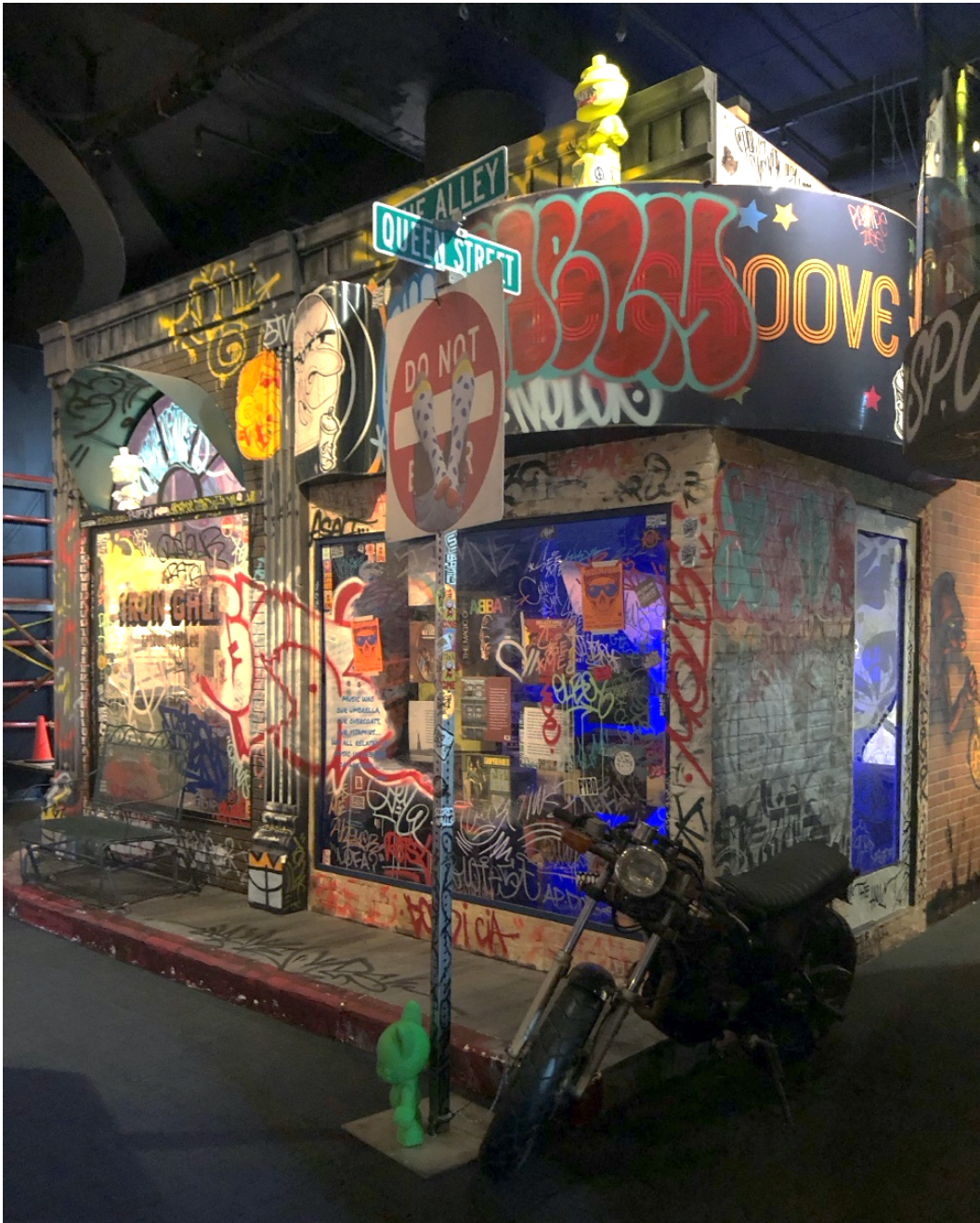
Figure 11. Detail of exhibition Pow! Wow! The First Decade: From Hawai'i to the World, Bishop Museum, Honolulu, Hawai'i, May 15–September 19, 2021.