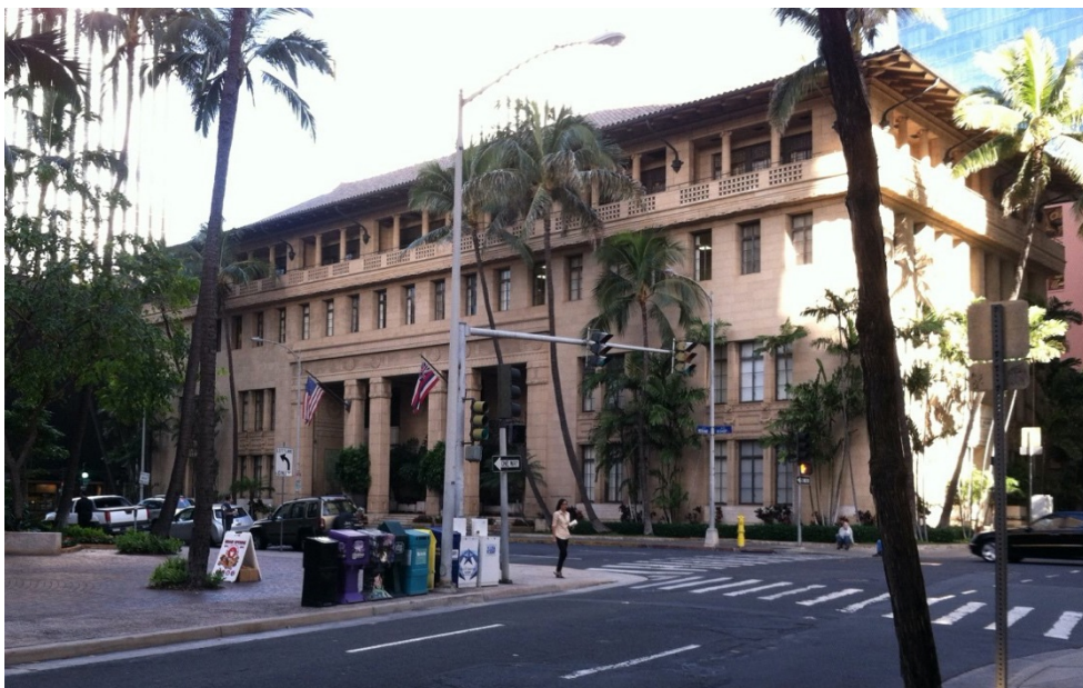
Figure 5. Charles Dickey, Alexander and Baldwin Building, Honolulu, Hawai'i, 1929.

Replicating Hawai'i's lands and its history in modern architecture is not a new practice. Western architects working in early twentieth-century Honolulu incorporated abstract figurations of Hawaiian motifs in their designs to position the islands within Euro-American imaginations about Asia and the Pacific. For example, the corporate headquarters of Hawai'i's major sugar conglomerate and the progenitor of A&B Properties, Inc. (developer of The Collection), is housed in the 1929 Alexander and Baldwin Building, an iconic structure in Honolulu's Central Business District (Fig. 5). Architect Charles Dickey designed the building as a synthesis of East and West, adding allusions to Peking's (Beijing's) Forbidden City onto the concrete and glass steel structure capped with a "Dickey-style" peaked roof. The gables and wide overhangs were inspired by Hawaiian hale (houses), edifices designed by Kānaka Maoli using wooden ridge posts and rafters to create elongated facades constructed of coconut bark, pili grass, and woven lashings. The Alexander and Baldwin Building came to define the Hawaiian Regional Style. 6 As I have argued elsewhere, architects and patrons developed the Hawaiian Regional Style to make Honolulu—for better or worse—visually legible as a modern locale to people in the contiguous United States. 7