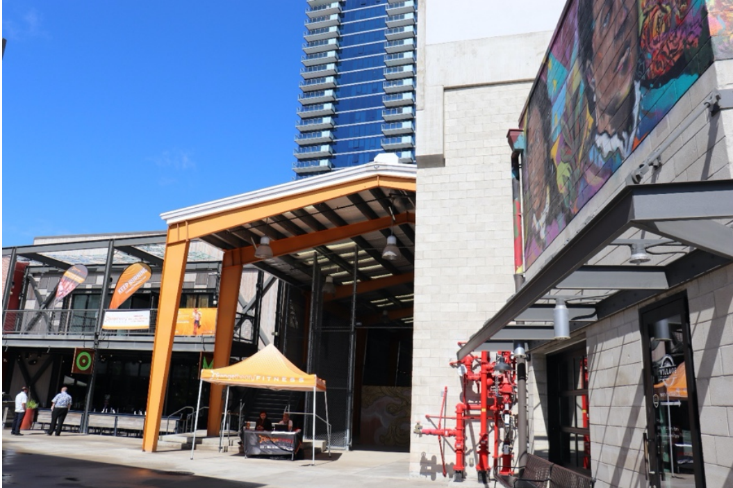
Figure 7. The Barn at SALT (foreground) and The Collection (tower in the background), 2016–18. Our Kaka'ako, Honolulu, Hawai'i.

with contemporary implications about fostering community and reciprocal care for Hawaiian ecologies. 12 Hōkūle'a Mālama Honua is more than paint on concrete. It provides a space to contemplate the reciprocal care between human and non-human beings. Its location in a park-like setting with grass and outdoor seating near a water feature is a welcoming space to foster community activity within the dense urban enclave.