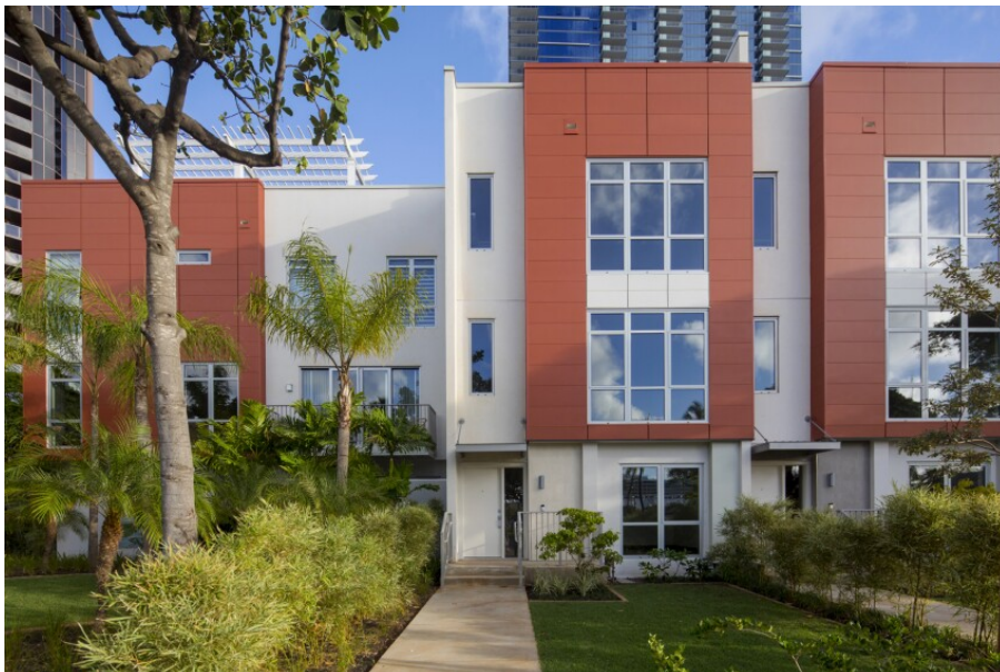
Figure 3. Design Partners Incorporated and Pappageorge Haymes, The Collection, Townhomes, 2016. Our Kaka'ako, Honolulu, Hawai'i.