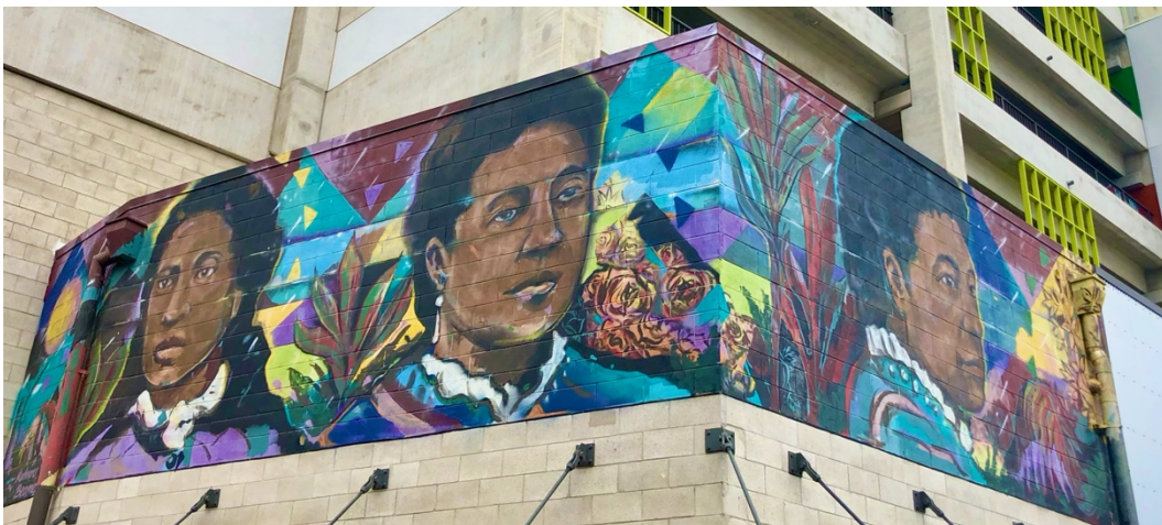
Figure 8. Kahiau Beamer, Bernice Pauahi Bishop , 2016. Mural, SALT courtyard adjacent to The Barn, Our Kaka'ako, Honolulu, Hawai'i.