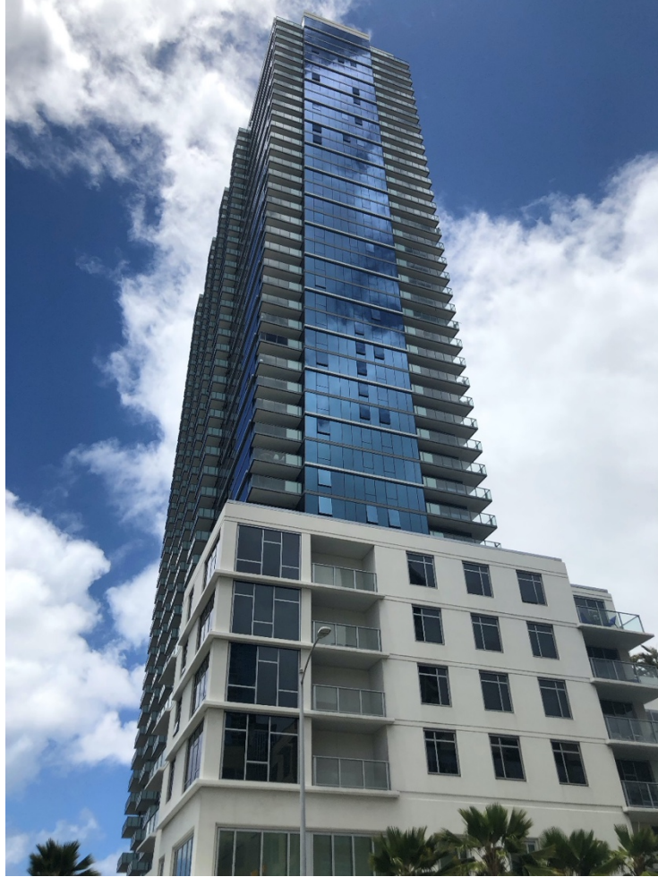
Figure 1. Design Partners Incorporated and Pappageorge Haymes, The Collection, Tower, 2016. Our Kaka'ako, Honolulu, Hawai'i.

My current research focuses on the liberatory possibilities of practicing and communicating culturally responsive architectural histories. In part, I am analyzing The Collection (2016), a residential project in Our Kaka'ako developed by Alexander & Baldwin (A&B) Properties, Inc. on the corner of Keawe Street and Ala Moana Boulevard (Fig. 1). 4 The Collection is a mixed-use complex with commercial spaces, a six-story parking structure, and three residential spaces that are in stark visual contrast with one another. A forty-three-story central tower with 397 condominiums soars into the sky. Its façade is punctuated with equidistantly spaced balconies at every level, wrapping around the entirety of the structure. Low-e glass projects a crisp, silver-blue hue from a building that captures the sky's color and the city's ambient environment. The Lofts—fifty-four condo units in a four-story building—functions as a transition point between the tower and the townhomes; the white, gray, and burgundy mid-rise building features large windows