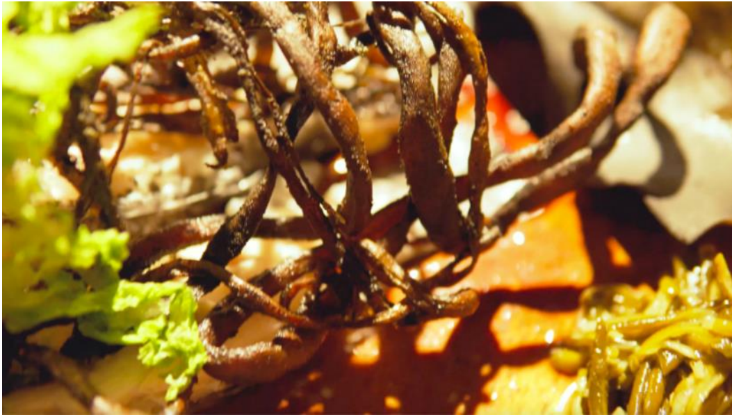
Figure 3. Detail of “ Ko Te Tai Ao ,” the first course of the Kauhaukai installation responding to Tamatea: He Tūtakinga Tuku Iho/Legacies of Encounter , Te Papa Tongarewa, March 3, 2020.

people. Tamatea was full of life both below and above water—fish, birds, and vegetation. All life forms worked symbiotically with one another. Our ancestors worked with the seaweed, with the fish, and with the birds. We are related, we share whakapapa .