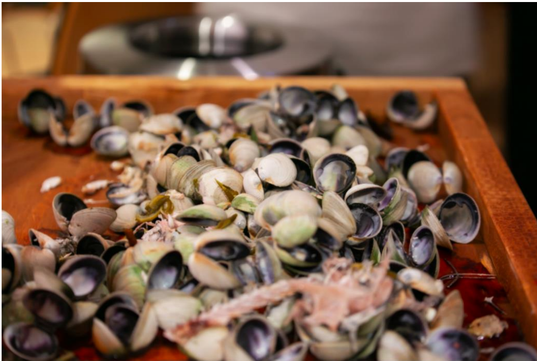
Figure 8. Detail of midden following the Kaihaukai Art Collective installation responding to Tamatea: He Tūtakinga Tuku Iho/Legacies of Encounter , Te Papa Tongarewa, March 3, 2020.

In the Kaihaukai Art Collective’s response to the Tamatea exhibition , various legacies of encounter were considered through the footprints of the people who are of the land, feeding themselves and each other on whakapapa (Fig. 7). Each of the whakapapa layers of our interactions with place— Ahi Kaa , mana whenua , mana i te whenua (keeping the fires burning, maintaining the fires, maintaining the authority of the land)—has left a footprint, some deeper and more destructive than others, from the purity of the natural environment, the light touch of the Indigenous peoples, to the overturning of the earth and subsequent infestation of vermin. The shells, the bones, the feasting, the stories, and the people all return to the earth.