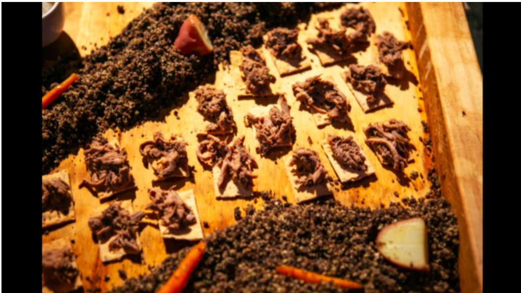
Figure 6. Detail of “Vermin,” the fourth course of the Kaihaukai installation responding to Tamatea: He Tūtakinga Tuku Iho/Legacies of Encounter , Te Papa Tongarewa, March 3, 2020.

The third course of our installation for Tamatea , “Disturbed Earth,” reimagined Cook’s gardens. The edible “earth” (dried olives, seeds, and nuts) was “planted” with the foreigners’ potatoes and carrots (Fig. 5). The dirt itself was flavoured through the infusion of peat smoke, with the peat extracted from the earth of Tamatea itself. The peat imparted the essence of the landscape to the participants and was one of only three elements taken from the natural environment of Tamatea. Participants were encouraged to eat the dirt, carrots, and potatoes with their hands. By making them complicit in the activities of disturbing the earth with their own hands, we hoped they would realise that in some way they/we all disturb the earth through even the most mundane of activities.