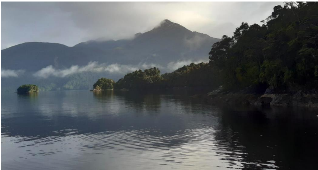
Figure 1. Alex Monteith, still from Kā paroro o haumumu: Coastal Flows / Coastal Incursions , 2019, shown in the Kaihaukai Art Collection installation responding to Tamatea: He Tūtakinga Tuku Iho/Legacies of Encounter , Te Papa Tongarewa, March 3, 2020.

The relationship between place and people can be linked to the metanarratives that inform creation stories and give “truth” to the creation of land and all that live within it. This also extends to stories of exploration and discovery—the first human footprints and impact on the land—and the deeds and accomplishments of our relations in previous generations. These stories provide individuals and collectives with a direct connection to whakapapa and, therefore, justification of the rights to live on the landscape, as well as the important obligations that extend from this. These obligations include maintaining the integrity of the landscape for the benefit of the land itself, but also for the generations to come afterwards: whakapapa .