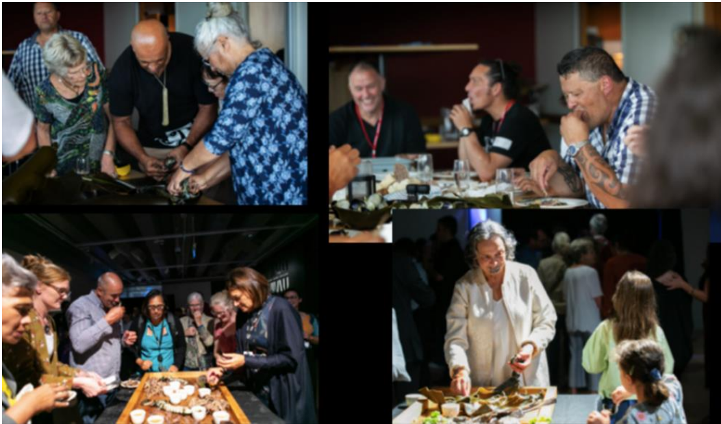
Figure 7. Scenes from the Kaihaukai Art Collective installation responding to Tamatea: He Tūtakinga Tuku Iho/Legacies of Encounter , Te Papa Tongarewa, March 3, 2020.

This dish was served with the narrative of the legacy of our encounters: a once pristine environment is now under severe threat due to overfishing and external environmental issues including predation. The source of the meat was disclosed; it was the only primary food element that had been harvested from Tamatea due to the extreme pressure on the native foods both above and below the water.