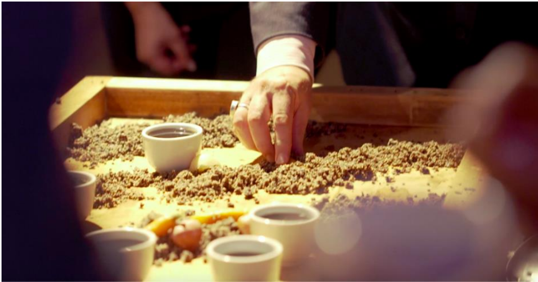
Figure 5. Detail of “Disturbed Earth,” the third course of the Kaihaukai installation responding to Tamatea: He Tūtakinga Tuku Iho/Legacies of Encounter , Te Papa Tongarewa, March 3, 2020.

that we maintain the mana . This is whakapapa . Through the metanarratives that have been handed down through time, we can claim connection to tupuna . Through metanarrative, our whakapapa also connects us to Takaroa (the Sea), Papatūānuku (the Land), and Rakinui (the Sky). 10 We have the right to enjoy and we have the obligation to both sustain and regenerate the natural world.