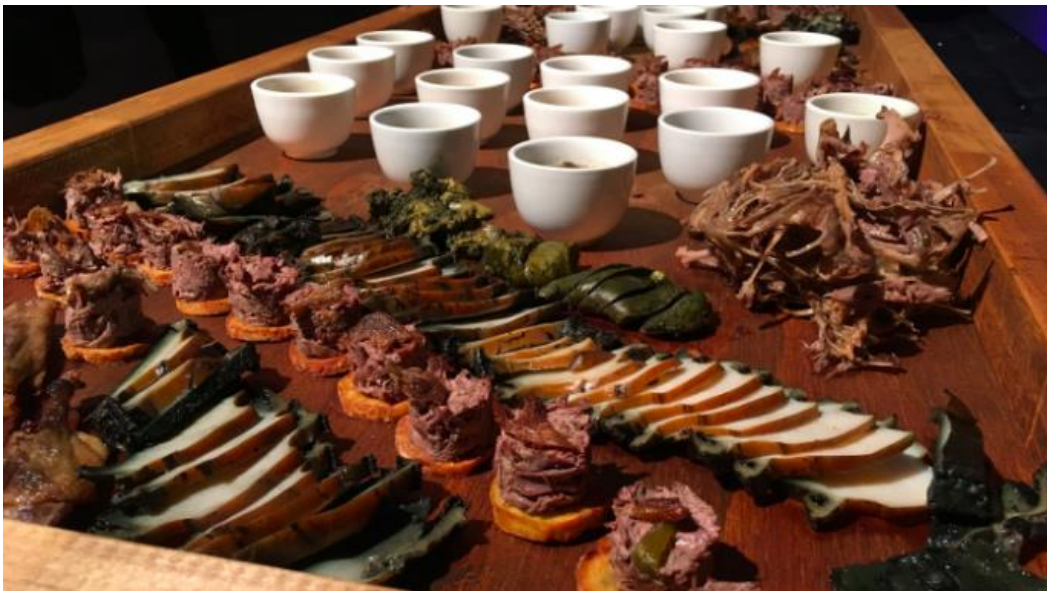
Figure 4. Detail of “Ahi Kaa,” the second course of the Kaihaukai installation responding to Tamatea: He Tūtakinga Tuku Iho/Legacies of Encounter , Te Papa Tongarewa, March 3, 2020.

This pepeha speaks truth to the original human inhabitants of the landscape, and connecting to it allows the descendants of these people the rights and obligations to the resources of that natural environment. 9