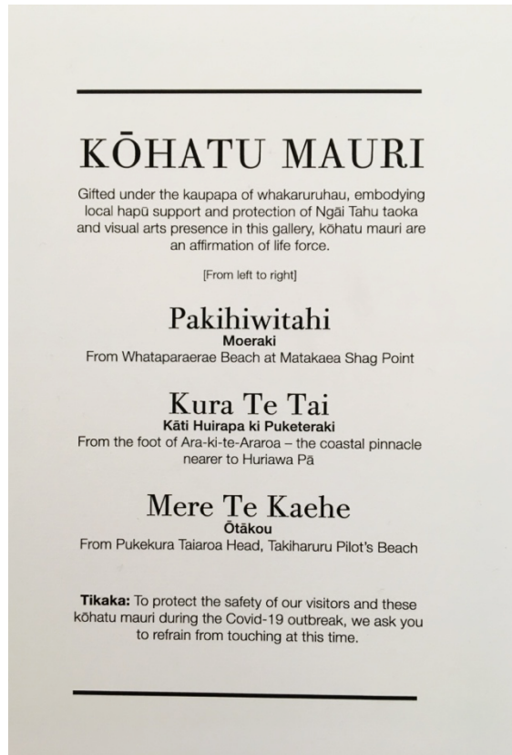
Figure 2b. Object label for the kōhatu mauri stones, Dunedin Public Art Gallery, Aotearoa New Zealand.

can move the stones; we can take them away temporarily on a trip, and we can even remove them permanently if we become unhappy with their situation.