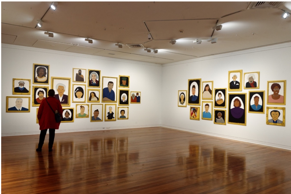
Figure 20. Ayesha Green (Kāi Tāhu, Ngāti Kahungunu) and Kāi Tahu whanau , Tūpuna Portraits , 2021. Acrylic on plywood, dimensions variable. On view in Paemanu: Tauraka Toi , Dunedin Public Art Gallery, Dunedin, Aotearoa New Zealand, December 11, 2021 to April 25, 2022. Courtesy of the artists, Paemanu Charitable Trust, and Dunedin Public Art Gallery