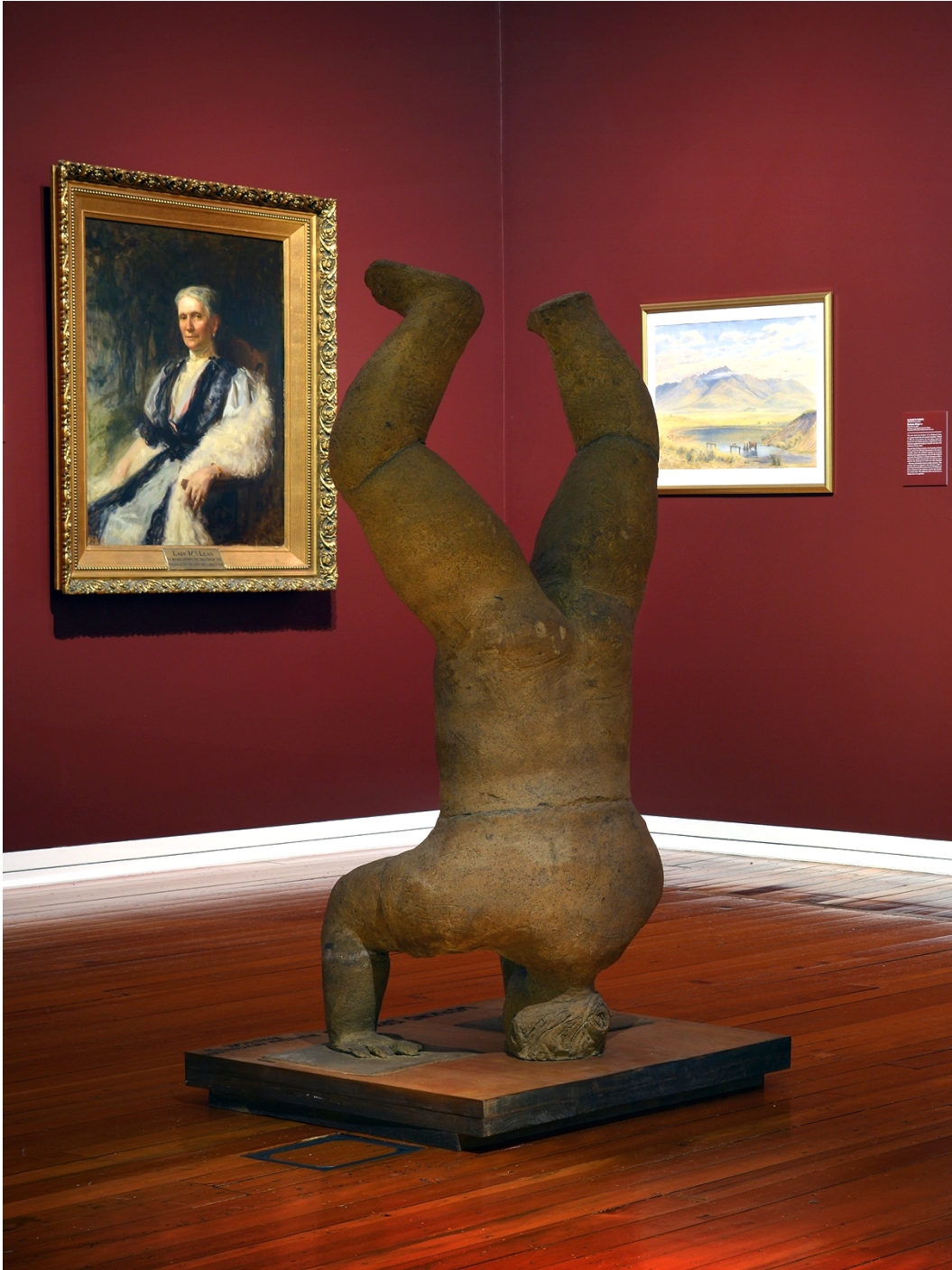
Figure 4a. Foreground: Shona Rapira Davies (Ngātiwai), Prototype for the Poles that Hold up the Sky , 1991. Terracotta, timber, 1600 x 820 x 800 mm. On walls, left to right: Sydney Lough Thompson, Lady McLean , 1907. Oil on canvas, 1005 x 750 mm; and James Crowe Richmond, Mount Excelsior Takitimo (sic) Range. Southland NZ , 1887. Watercolour on paper, 516 x 751 mm. On view in Hurahia ana kā Whetū: Unveiling the Stars , Dunedin Public Art Gallery, Dunedin, Aotearoa New Zealand, June 12–April 30, 2023.