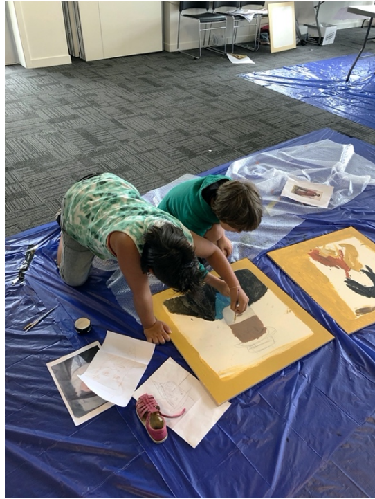
Figure 21. Public program of tūpuna (ancestor) portrait-making, Ōtakou Marae, January 29, 2022, in conjunction with the exhibition Paemanu: Tauraka Toi , Dunedin Public Art Gallery, Dunedin, Aotearoa New Zealand, December 11, 2021, to April 25, 2022.