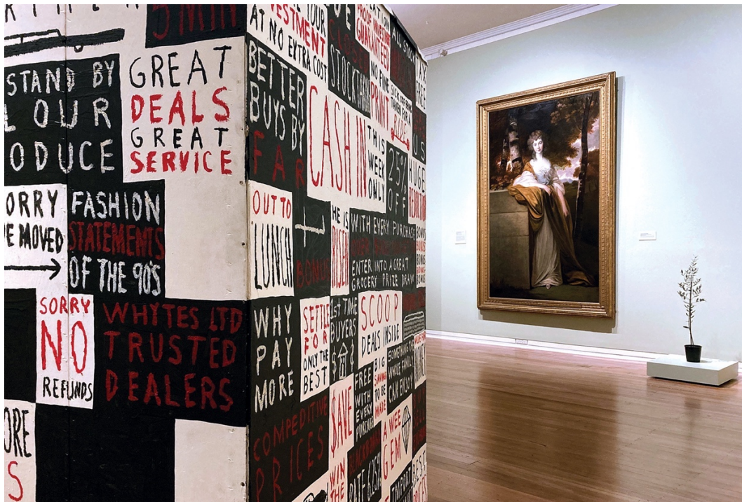
Figure 5. Left to right: Peter Robinson (Kāi Tahu, Kāti Kuri), Untitled , 1994. Wood, acrylic, oil stick, light bulb, tin, wool, 210 x 1630 x 1700 mm; and Thomas Gainsborough and John Hoppner, Charlotte, Countess Talbot , c. 1784. Oil on canvas, 2720 x 1810 mm. Michael Parekōwhai (Ngā Ariki, Ngā Tai Whakaronga), Constitution Hill , 2011. Bronze 1010 x 250 x 250 mm. On view in Hurahia ana kā Whetū: Unveiling the Stars , Dunedin Public Art Gallery, Dunedin, Aotearoa New Zealand, June 12–April 30, 2023. Courtesy of Dunedin Public Art Gallery