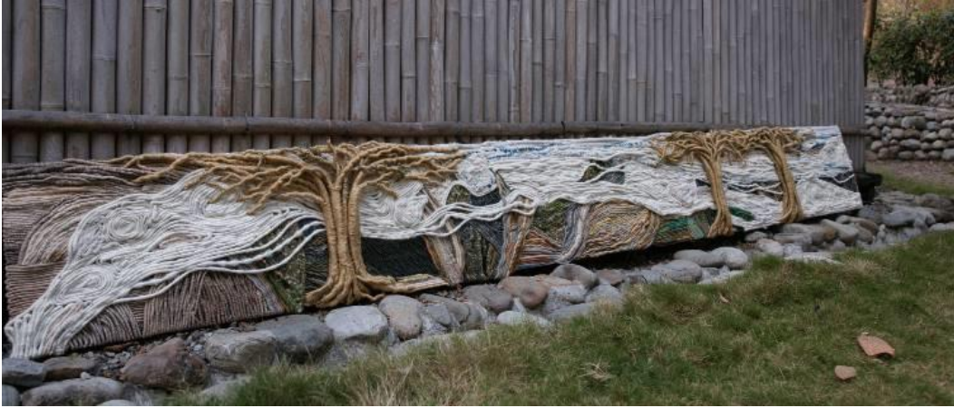
Figure 8. Yuma Taru, Era of Dream Building , 2009. Wool, ramie, sisal hemp, and stone; 600 x 220 cm. A portion of Era of Dream Building (2009) at the Lihang Workshop.