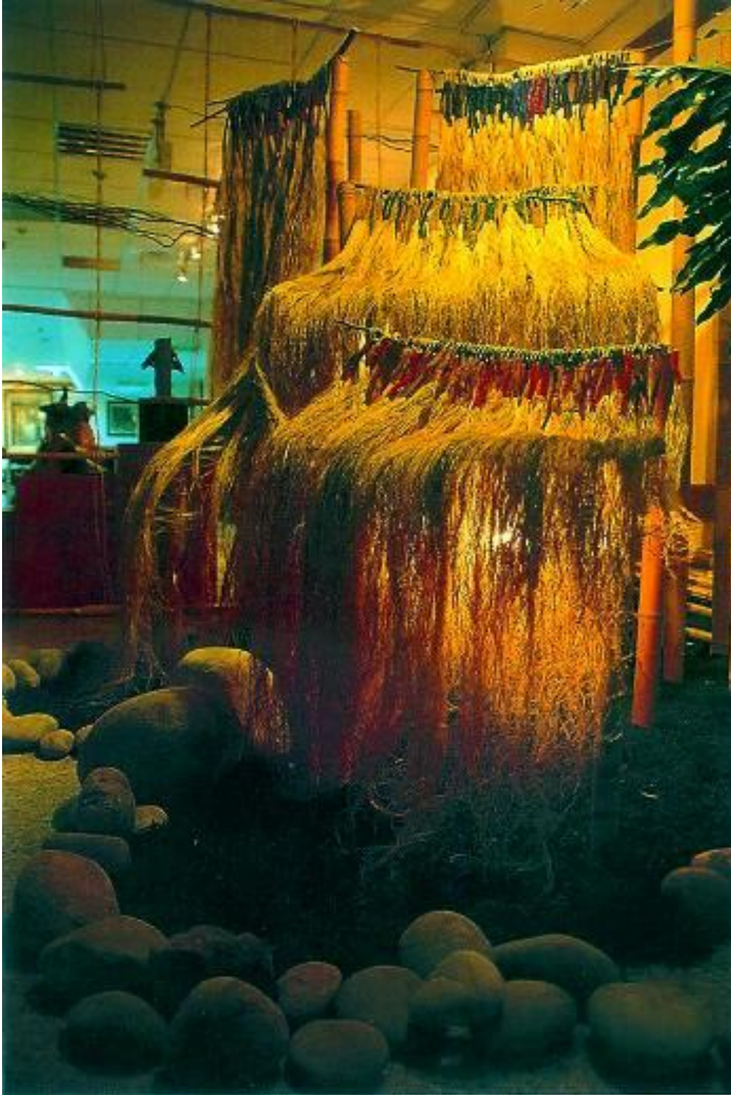
Figure 3. Yuma Taru, Raging Waterfalls , 1999. Ramie, wool, bamboo, and stone; dimensions variable. Installed at Yuan-chun Art Gallery, Taichung, Taiwan, August–September 1999.