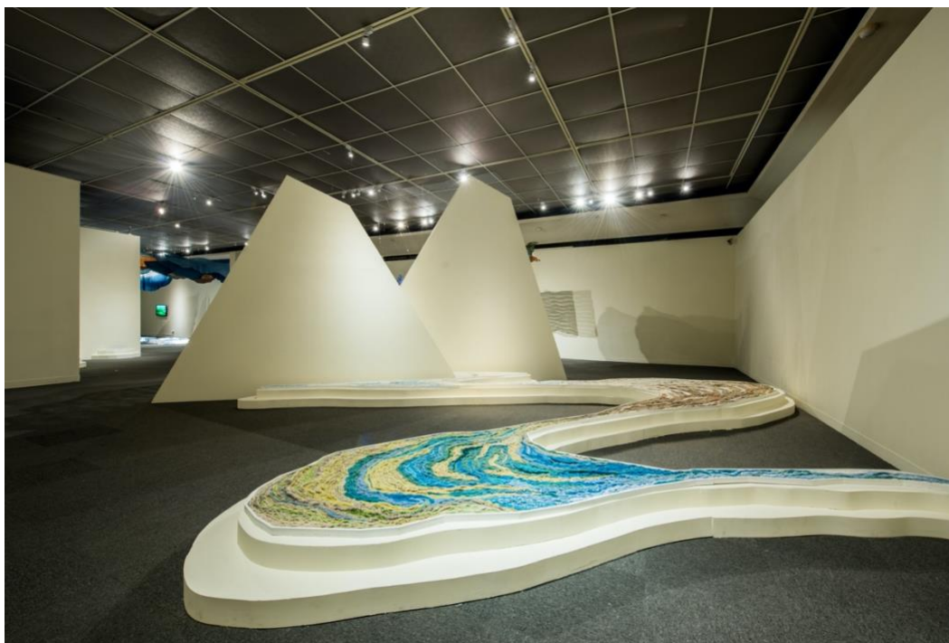
Figure 12. Yuma Taru, Early Death of a River , 2017. Wool, ramie, and hemp; dimensions variable. Exhibited at Kaohsiung Museum of Fine Arts, Taiwan, October 7, 2017–February 20, 2018.