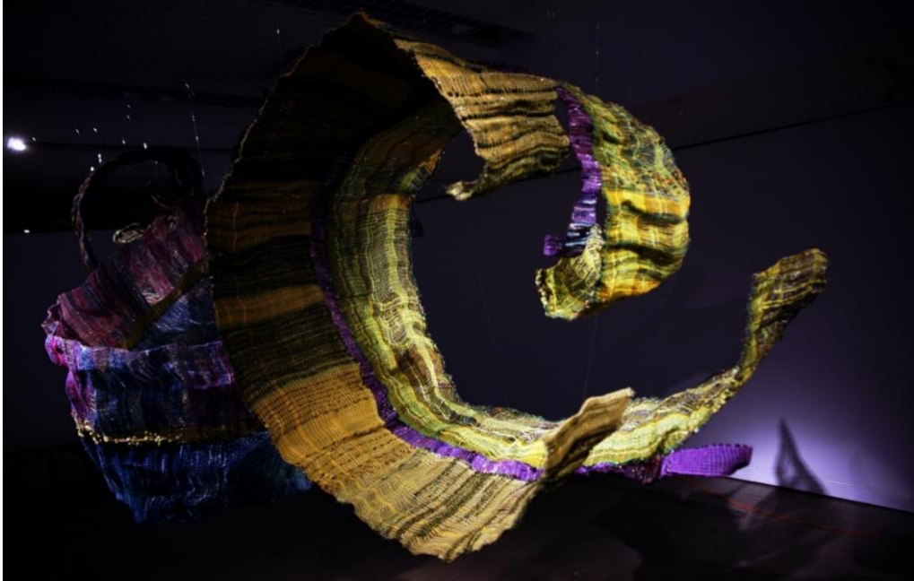
Figure 9. Yuma Taru, Spiral of Life , 2015. Metallic yarn, metallic paper, and stainless steel; dimensions variable. Installed at Museum of Anthropology, University of British Columbia, Canada, November 20, 2015–April 3, 2016.