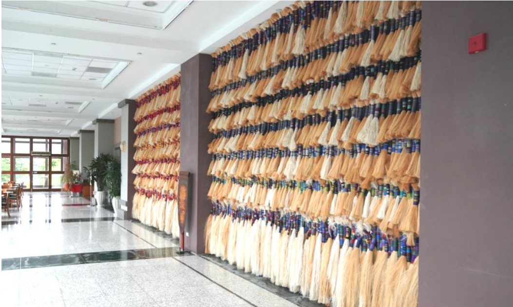
Figure 5. Yuma Taru, Spreading the Wings of Dreams , 2002. Wool and ramie, 380 x 1000 x 50 cm. Permanent installation at the National Museum of Prehistory, Taitung, Taiwan.

a dyed wrapping wool, which reflect traditional Atayal garment colouring. Creating these works was a way for us to vent our feelings in the aftermath of the earthquake while also giving some of us a source of needed income.