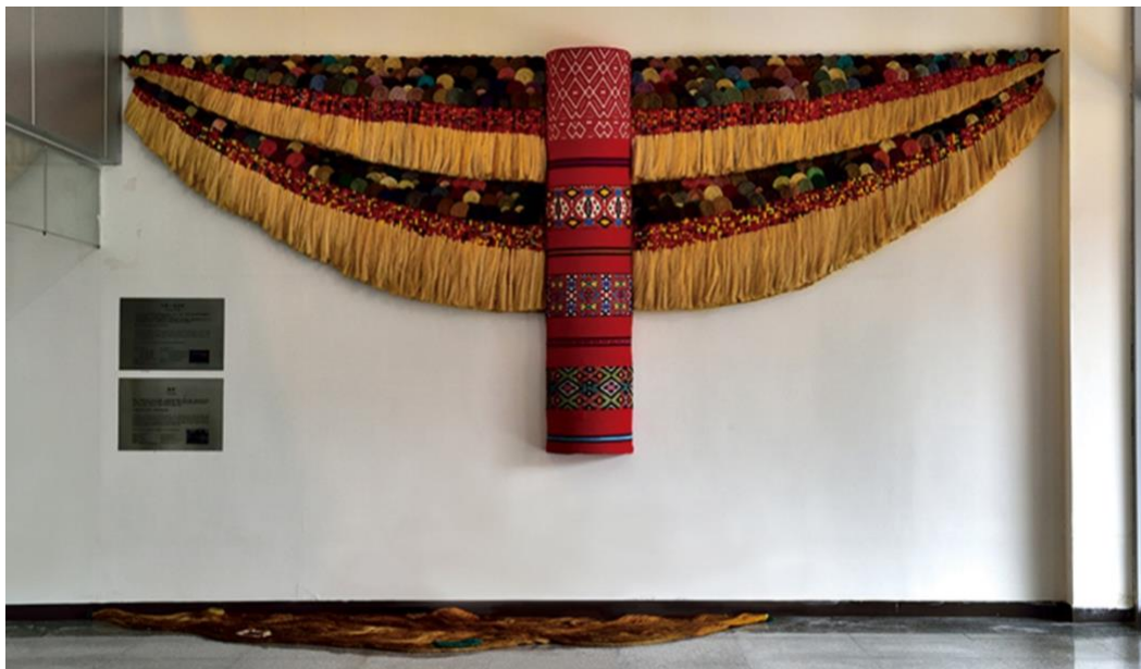
Figure 4. Yuma Taru, Wings: Tminun , 2009. Ramie, wool, and sisal hemp; 350 x 520 cm. Permanent installation at Academia Sinica, Taipei, Taiwan.