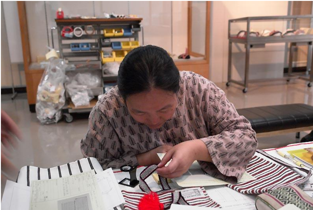
Figure 2. The author undertaking museum collections research at Tokyo Kasei University, Japan, 2007.

Today, most Taiwanese Indigenous weavers are committed to using traditional materials and transmitting traditional thread-making skills. Ramie has thus begun to return to Taiwanese Indigenous communities. My husband and I have worked hard for thirty years to bring it back (Fig. 1), and through this work, we have come to know it and become conscious of its value. Thus, we have not only revived ramie but also initiated a revival of our entire culture.