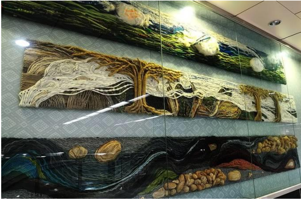
Figure 6. Yuma Taru, Era of Dream Building , 2009. Wool, ramie, sisal hemp, and stone; 600 x 220 cm. Permanent installation at the Kaisyuan Station, Kaohsiung Metro, Taiwan.

methods. Looking back at that piece twenty years later, I can still see the artists' sense of motivation to restore and enhance the environment and our lives.