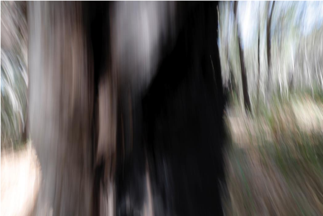
Figure 4. Leah King-Smith, Canaipa 019 , 2020. Still photograph from the video Evocations , 7:32, 2020.