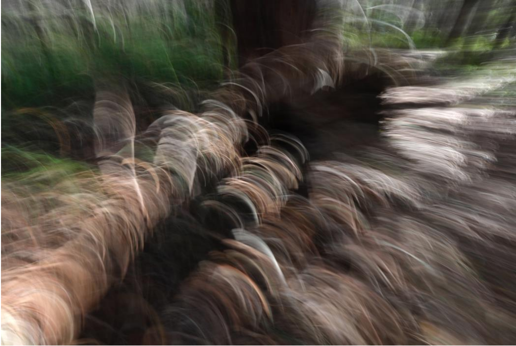
Figure 7. Leah King-Smith, Canaipa 018 , 2020. Still photograph from the video Evocations , 7:32, 2020.