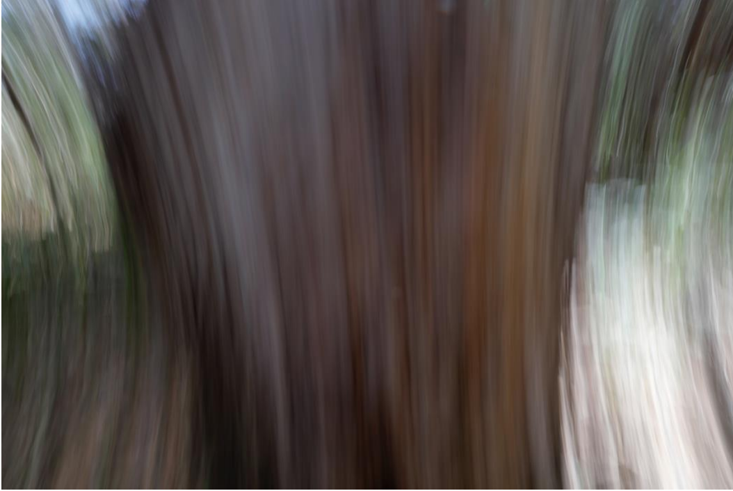
Figure 5. Leah King-Smith, Canaipa 020 , 2020. Still photograph from the video Evocations , 7:32, 2020.