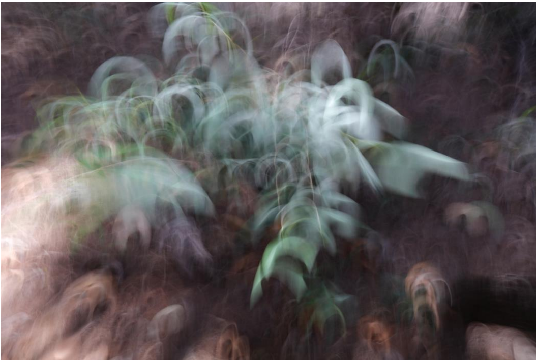
Figure 6. Leah King-Smith, Canaipa 022 , 2020. Still photograph from the video Evocations , 7:32, 2020.