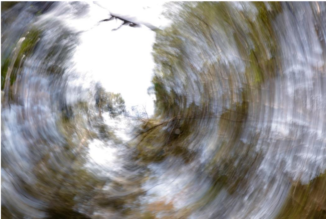
Figure 10. Leah King-Smith, Canaipa 050 , 2020. Still photograph from the video Evocations , 7:32, 2020.