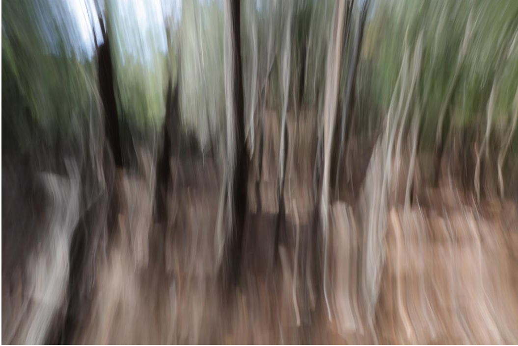
Figure 9. Leah King-Smith, Canaipa 023 , 2020. Still photograph from the video Evocations , 7:32, 2020.