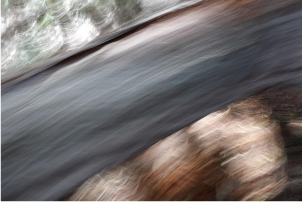
Figure 3. Leah King-Smith, Canaipa 010 , 2020. Still photograph from the video Evocations , 7:32, 2020.