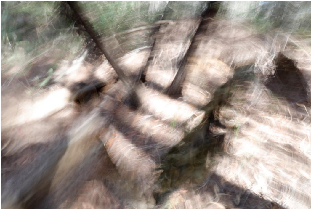
Figure 1. Leah King-Smith, Canaipa 013 , 2020. Still photograph from the video Evocations , 7:32, 2020.

Keywords: First Nations, Country, ancestry, Indigenous poetry, Aboriginal Australian art, sovereignty, photography, digital media