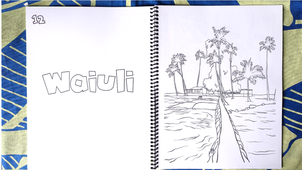
Figure 4. Example of a wahi pana (famed places) illustration in the Nā Pana Kaulana O Keaukaha coloring book.