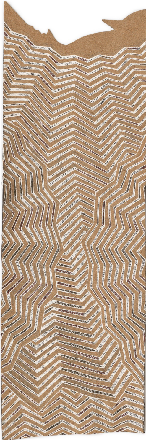
Figure 7. Gunybi Ganambarr, Garrapara , 2018. Natural pigments on eucalyptus bark, 64 11/16 x 21 1/4 in. (163 x 54 cm), Kluge-Ruhe Aboriginal Art Collection of the University of Virginia. The 2017–19 Madayin Commission, 2020.EL.0004.017.