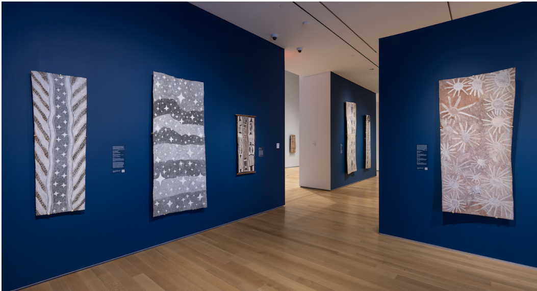
Figure 8. Installation view of Madayin: Eight Decades of Aboriginal Australian Bark Painting from Yirrkala . The Hood Museum of Art, Dartmouth, September 4–December 4, 2022.

Andrews offered that, over time, the full impact of these messages can be felt: that “these expressions are potent, patient, and cumulative.” The hopefulness in this claim is “not to deny the scale of destruction forged by colonization but to actively restore and repair.” 26 Perhaps Indigenous cultural diplomacy provides the model for mutual growth through intercultural encounters. Through careful listening to the truth in messages of kinship and connection offered by Yolŋu curation, vast networks of relationship can begin to be formed.