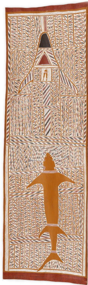
Figure 4. Wilson Manydjarri Ganambarr, Djambarrpuyŋu Mäna | Shark of the Djambarrpuyŋu Clan, 1996. Natural pigments on eucalyptus bark, 75 7/8 x 22 3/4 in. (192.72 x 57.79 cm), Kluge-Ruhe Aboriginal Art Collection of the University of Virginia. Gift of John W. Kluge, 1997, 1996.0035.017.

Through artistic expressions of a deep relationship to the natural world and ancient stories, Maḏayin presents a culture that has changed over time and celebrates individuality that is strengthened by a bedrock of connection. Gurrutu , the system of kinship, is made up of the paintings as well as the people who made them, the trees that the bark came from, the land, the sea, and all creatures. Gurrutu is both a way of relating and a source of strength, generated by identifying and connecting with one's original place within a vast cosmological web. Seeing all these works together connects us to our deepest identities, showing that we are connected to nature—and through it, to each other.