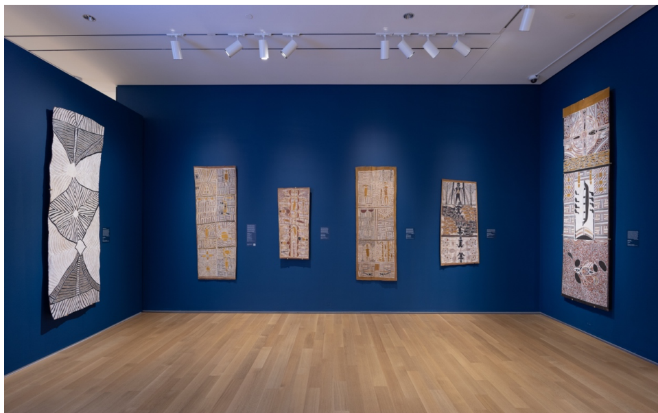
Figure 2. Installation view of Madayin: Eight Decades of Aboriginal Australian Bark Painting from Yirrkala . The Hood Museum of Art, Dartmouth, September 4–December 4, 2022.