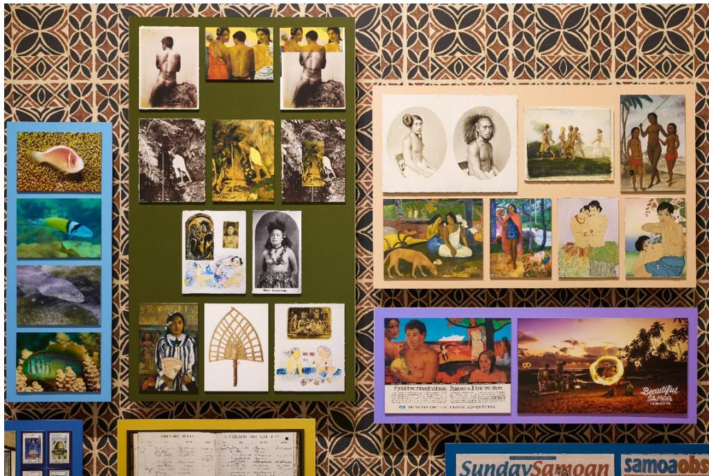
Figure 3. Detail of Yuki Kihara's "Vārchive," Paradise Camp , Aotearoa New Zealand Pavilion, 59th International Art Exhibition of La Biennale di Venezia, April 23–November 27, 2022. Commissioned by the Arts Council of New Zealand Toi Aotearoa.