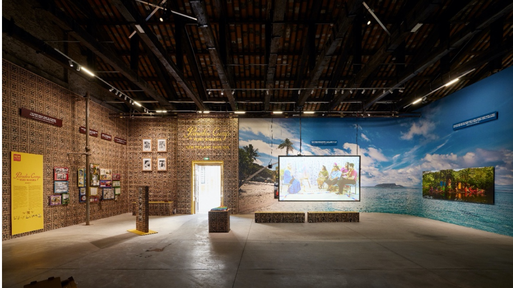
Figure 2. Installation view of Paradise Camp , Aotearoa New Zealand Pavilion, 59th International Art Exhibition of La Biennale di Venezia, April 23–November 27, 2022. Commissioned by the Arts Council of New Zealand Toi Aotearoa.