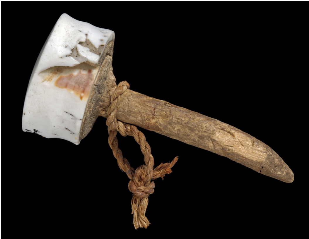
Figure 2. Artist unknown, Pūtaiana type 1a, before 1774. Shell, wood, 33 x 74 x 29 mm. inv.no. 1886.1.707

The different types of ear ornaments are described as having been worn by men, women, or both. With haakai and pūtaiana, in particular, sources are not in agreement on their gender-specific use. Also, relatively few ear ornaments have information about when and where they were collected in the Marquesas Islands and by whom. Therefore, while examining ear ornaments for my doctoral research, I paid particular attention to those museum pieces with early collection dates to