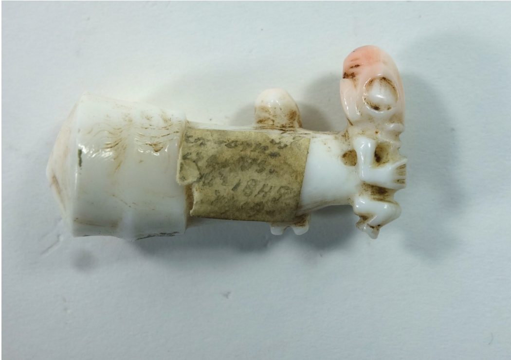
Figure 8. Artist unknown, Pūtaiana (type 3), before 1845. Shell, 22 x 38 x 15 mm. Museum of Archaeology and Anthropology, Cambridge University, inv.no. 1923.114 B.