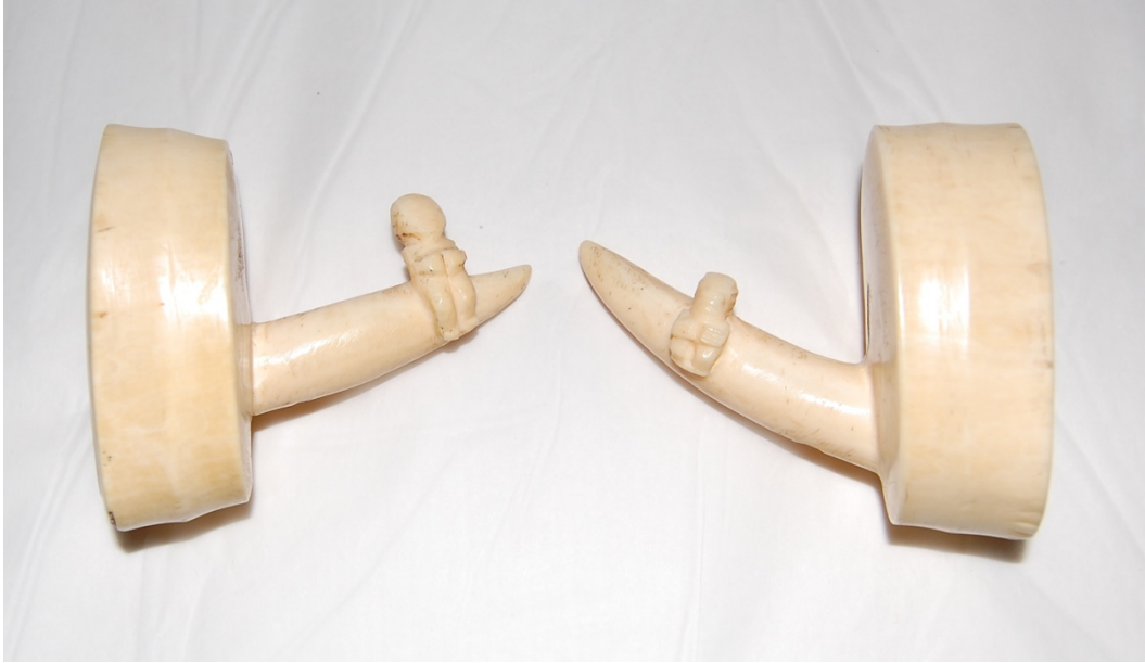
Figure 11. Artist unknown, Two haakai, before 1871. Whale tooth, 76 x 83 x 47 mm and 75 x 82.5 x 48.5 mm. British Museum, inv.no. Oc.7279.a-b.