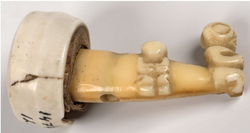
Figure 5. Artist unknown, Pūtaiana type 1b, before 1825. Shell, wood and boar tusk, 30 x 59 x 26 mm. Collection Museum Volkenkunde inv.no. RV-1474-12.

to pūtaiana worn by men. 47 A Nuku Hivan man drawn by Johan Christiaan van Haersolte also seems to wear a pūtaiana. 48 Willem Carel Singendonck describes an ear ornament made from black wood worn by women (which may refer to uuhei) and Jacob van Wageningen mentions that foreign objects were used as ear ornaments, such as buttons by women and nails and cigars by men. 49 Commander Christiaan Eeg observes that some men wore shell ear ornaments, but that most women and men hardly wore any adornment. 50 The Dutchmen collected three pairs of pūtaiana type 1b, including ones with spurs decorated with small tiki figures, which so far are the oldest known collected examples of this type that can still be traced today. One of these pairs was collected by Adrianus Cosijn (Fig. 5), who also made a drawing of one of the pūtaiana and of a kouhau, an ear ornament type that does not seem to have been collected by the Dutch. However, Van Haersolte did collect a pair of quite small haakai. 51