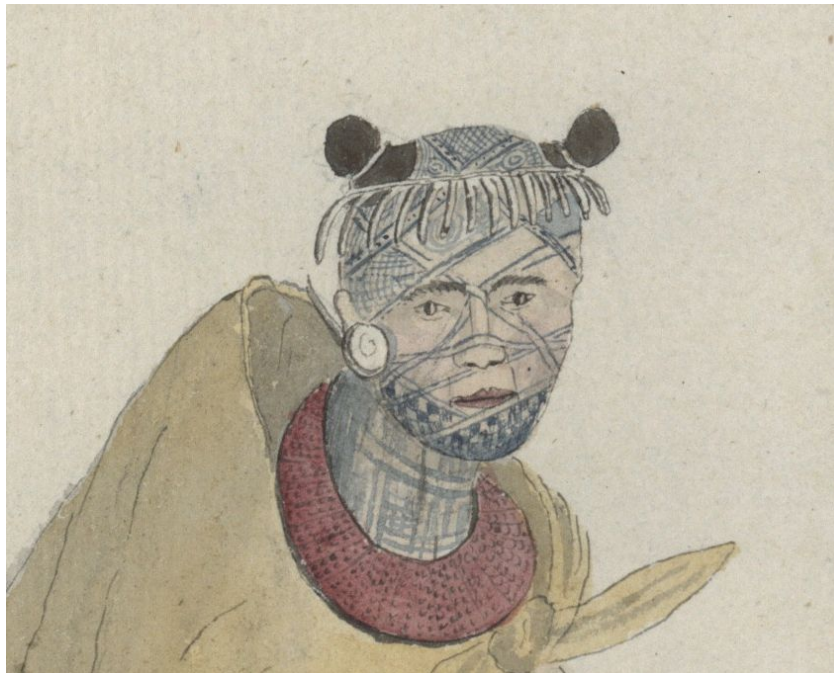
Figure 3. Hermann Ludwig von Löwenstern, A Nuku Hivan man (detail), 1804. Watercolor drawing, dimensions unknown. Courtesy of the National Archives of Estonia, Arch. No. EAA.1414.3.3:95

Drawings and images in this expedition’s travelogues show several Nuku Hivans wearing ear ornaments, mostly pūtaiana type 1 (Fig. 3). 26 It is noteworthy that none of the women depicted wear ear ornaments, although some wear a flower or a feather through an earlobe. The travelogues of Von Langsdorff and Lisiansky also show illustrations of just ear ornaments. 27 Several members of the Krusenstern expedition collected ear ornaments and, of these, twenty-one can be located. They include fifteen pūtaiana type 1a, with spurs made from various materials such as bird’s beaks, boar tusks, and whale ivory; four kouhau; and two small ear ornaments made entirely from whale ivory. 28 Surprisingly, none of the expedition members collected or referred to large oval-shaped ear ornaments made from whale teeth. However, one of the expedition’s informers, the stranded Englishman Edward Robarts, mentions haakai ear ornaments one time in his extensive journal recounting his stay on the islands from 1798 to 1806: when describing women’s dance costumes during funerary rites. 29