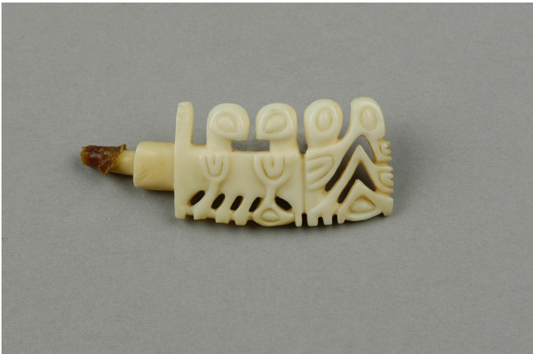
Figure 9. Artist unknown, Pūtaiana (type 2b) with flat spur, before 1874. Whale tooth and resin, 18.5 x 46.5 x 7 mm. Penn Museum, inv.no. 18023K.