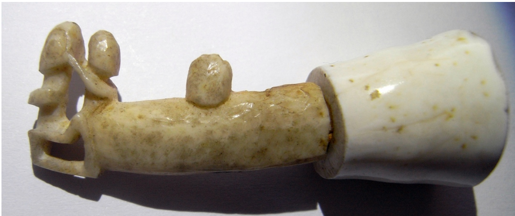
Figure 7. Artist unknown, Pūtaiana (type 2a), before 1841. Shell and boar tusk, 17 x 50 x 16 mm. Musée d'Ethnographie de Neuchâtel, Switzerland, inv.no, V.26.