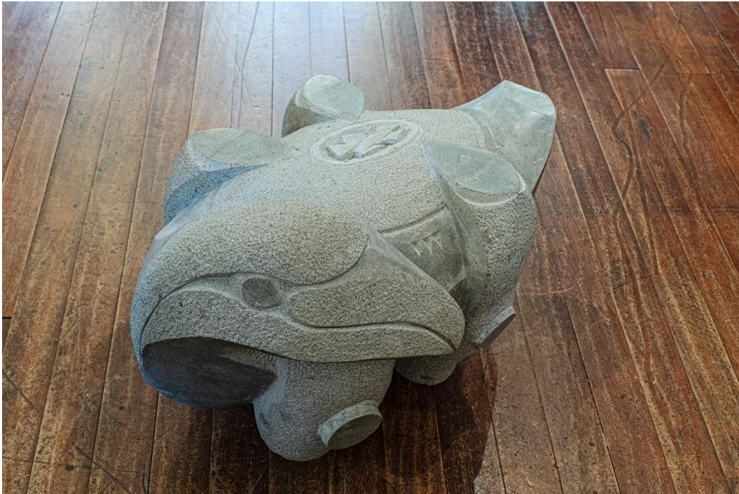
Figures 4 and 5. Sololemalama Filipe Tohi, Manuvaka , 2008. Taranaki andesite, 66 x 45 x 50 cm. Installation view in 'Amui 'i Mu'a/Ancient Futures, Pah Homestead, 2021. Collection of Arts House Trust, Auckland.