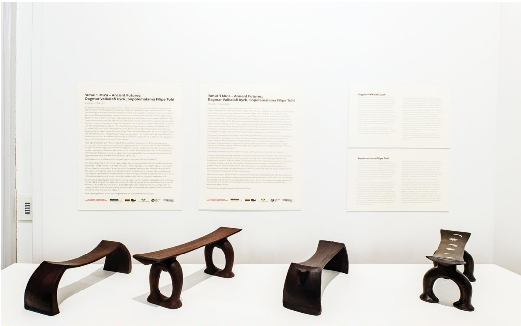
Figure 8. Sololemalama Filipe Tohi, Four Kali , 2021. Wood, sennit, and bone; (left to right) 18 x 11 x 42 cm, 14 x 10 x 34 cm, 13 x 11 x 36 cm, and 17 x 13 x 42 cm. Installation view in 'Amui 'i Mu'a/Ancient Futures , Pah Homestead, 2021. Collection of the artist.