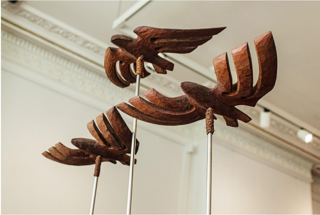
Figure 7. Sololemalama Filipe Tohi, Manutala (detail), 1992. Wood, steel, and sennit, 224 x 60 x 105 cm. Installation view in 'Amui 'i Mu'a/Ancient Futures , Pah Homestead, 2021. Collection of the artist.