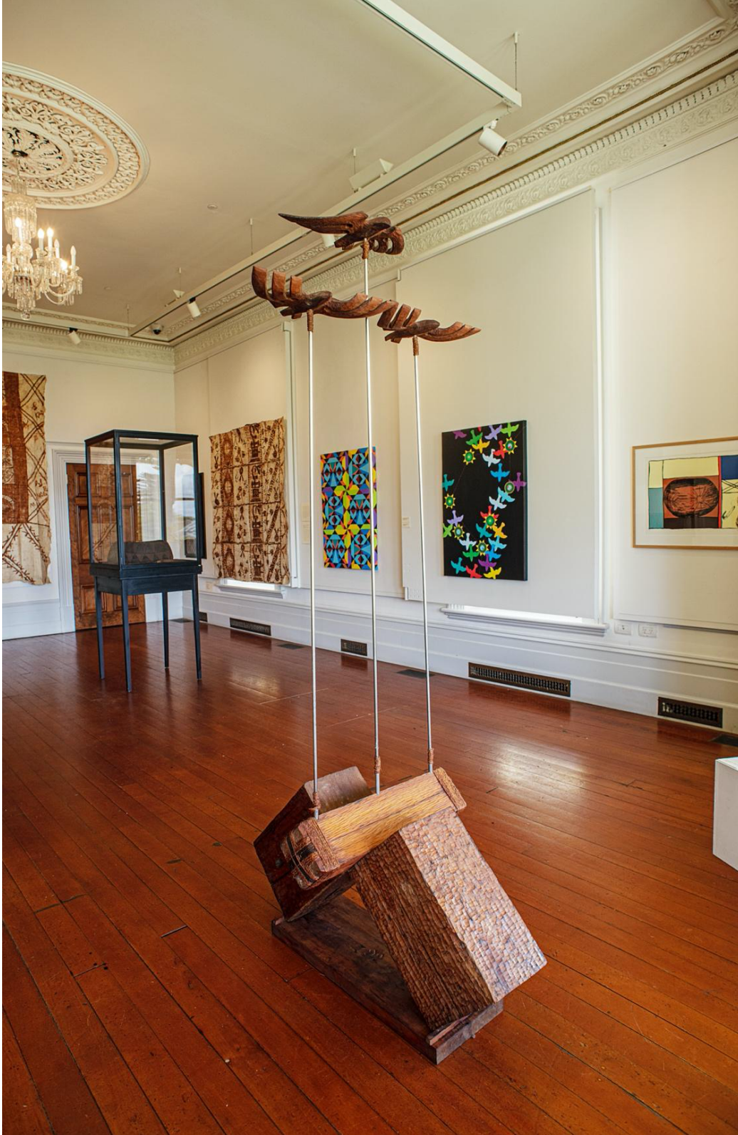
Figure 6. Sololemalama Filipe Tohi, Manutala , 1992. Wood, steel, and sennit, 224 x 60 x 105 cm. Installation view in 'Amui 'i Mu'a/Ancient Futures, Pah Homestead, 2021. Collection of the artist.