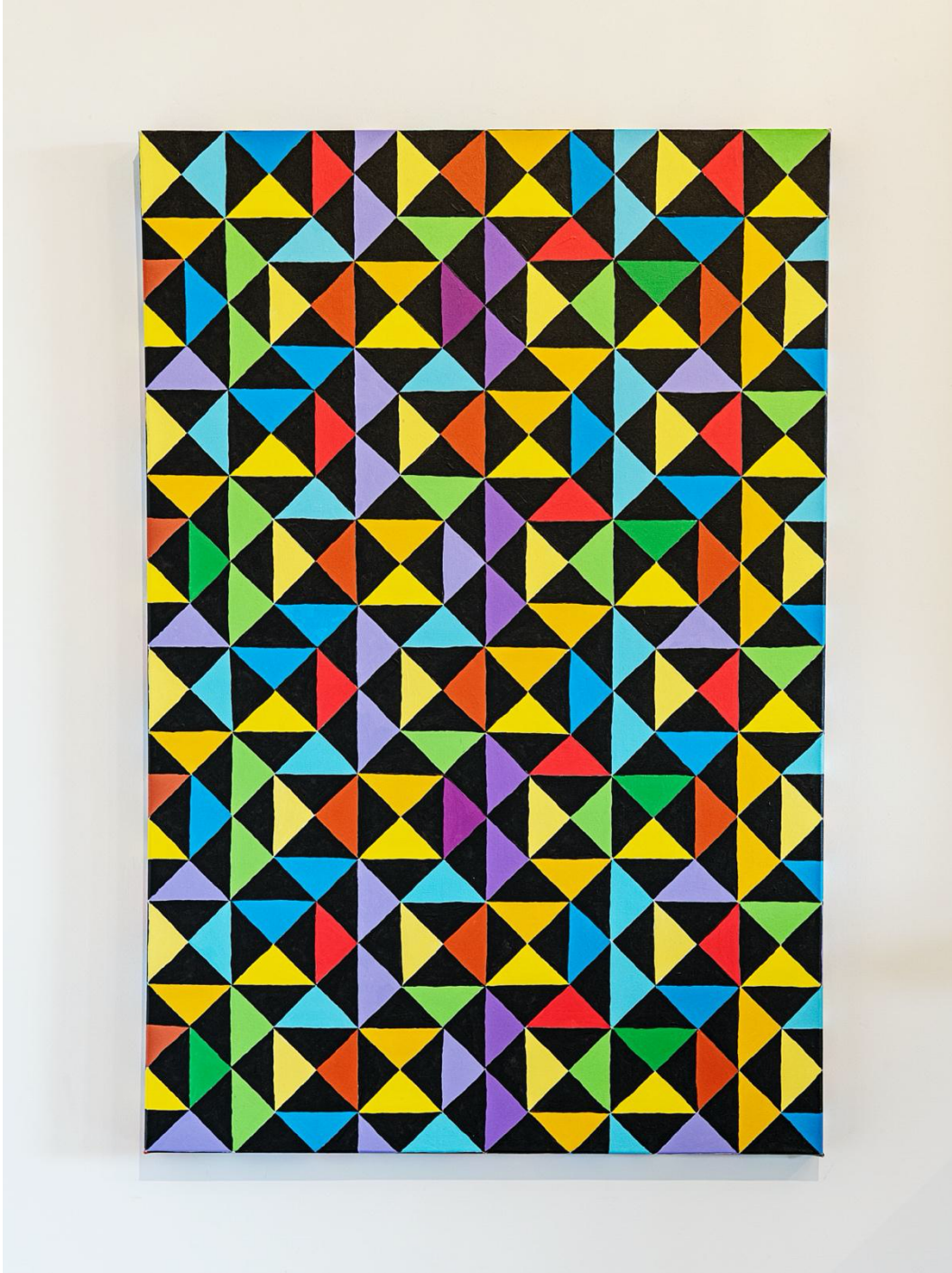
Figure 2. Sololemalama Filipe Tohi, Puleika , 2021. Acrylic on canvas, 120 x 79.5 cm. Private collection.