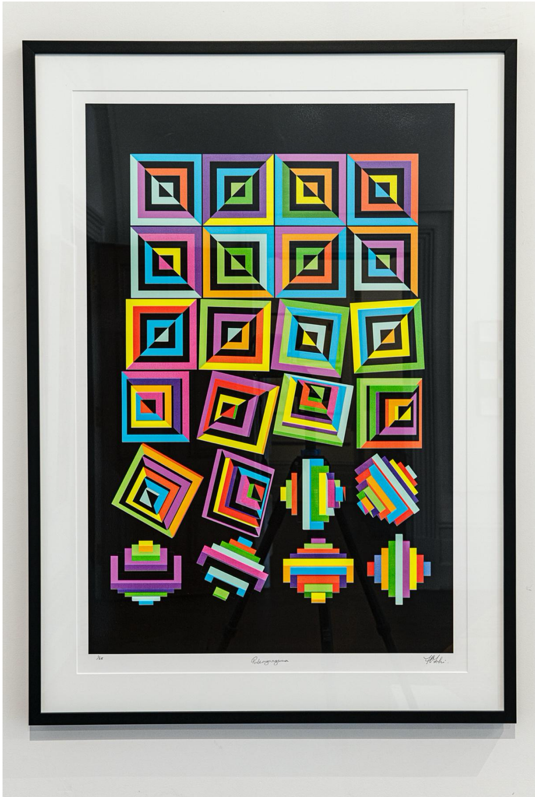
Figure 3. Sopolemalama Filipe Tohi, Pule Ngangana , 2020. Screen print, 110 x 80 cm. Private collection.