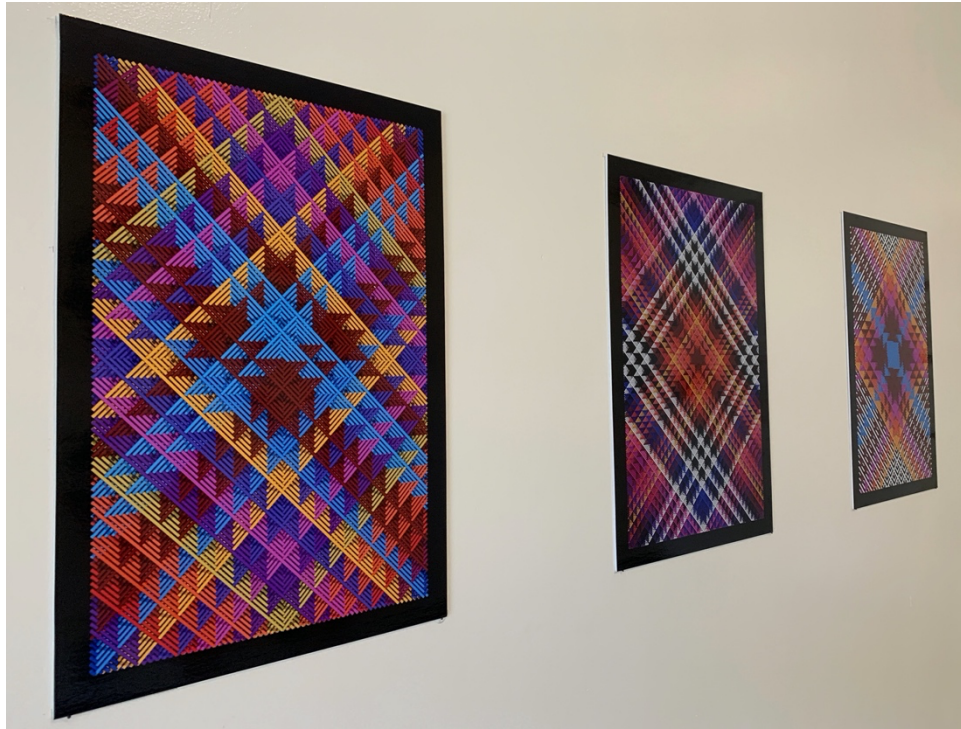
Figure 3. Sopolimalama Filipe Tohi, works in progress. Me'a 'ofa Gallery at the Tanoa Dateline Hotel, October 2019.