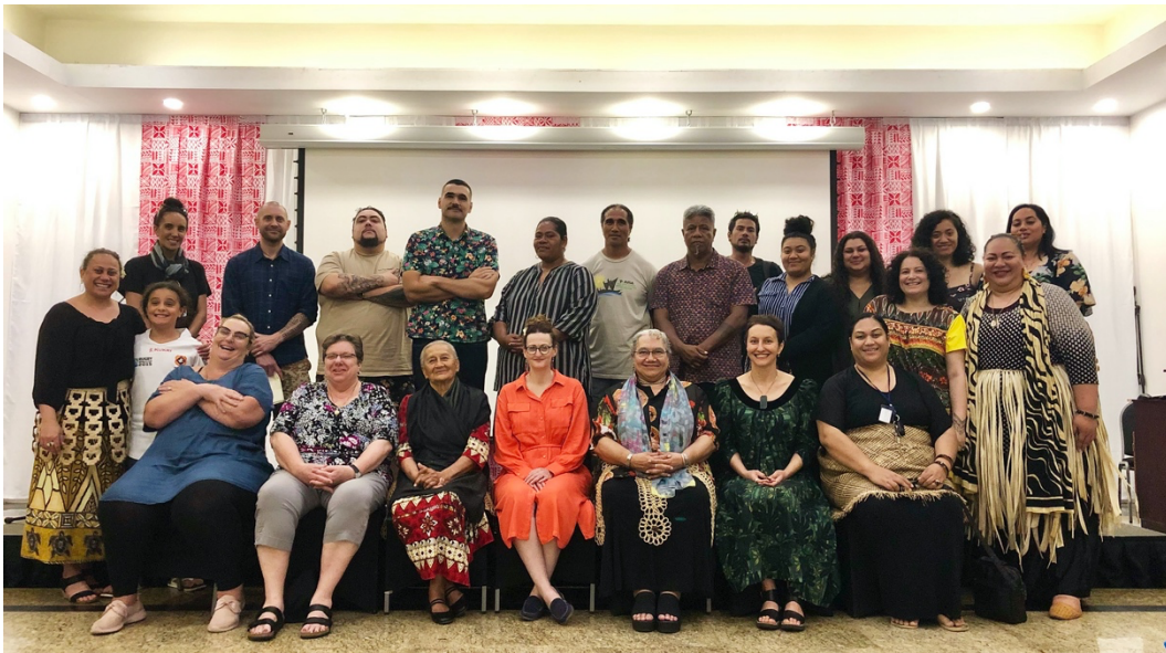
Figure 1. Traditional knowledge-holders, artists, and academics at the 'Amui 'i Mu'a/Ancient Futures conference, Nuku'alofa, Tonga, October 8, 2019.

Keywords: 'Amui 'i Mu'a/Ancient Futures, Tonga, Tongan diaspora, art, material culture, exhibitions