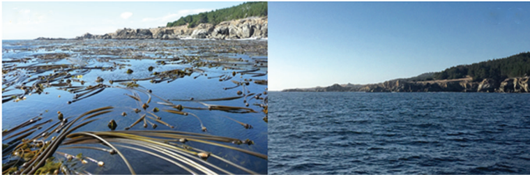
FIGURE 2. Comparison of healthy (2012; left) and degraded (2016; right) kelp canopy at Ocean Cove within Greater Farallones National Marine Sanctuary.