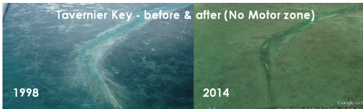
Figure 4. Aerial views near Tavernier Creek within Florida Keys National Marine Sanctuary taken in 1996 and 2014 show significant shallow-water habitat recovery due to the 1997 designation of a wildlife management area.

for successful climate adaptation. A prime example is Papahānaumokuākea Marine National Monument, the largest protected area in the US. This expansive MPA encompasses the islands and waters of the northwestern Hawaiian Islands (Figure 5). Covering 582,578 mi 2 and stretching for a distance of 1,350 mi, it encompasses an area larger than all the nation’s national parks combined. Papahānaumokuākea is comanaged by four trustees: NOAA, US Fish and Wildlife Service (USFWS), the state of Hawaii, and the Office of Hawaiian Affairs. This partnership has allowed the managers of Papahānaumokuākea to pull from a breadth of expertise and resources in order to successfully navigate the daunting task of managing one of the largest, most remote MPAs on Earth under a changing climate. For example, a 2019 research cruise in Papahānaumokuākea documented widespread coral damage at French Frigate Shoals, an atoll in the monument, from Hurricane Walaka, a Category 3 storm that passed through the area in October 2018. That year was the most intense Pacific hurricane season on record, part of a pattern of more intense storms due to warmer oceans. The ability for Papahānaumokuākea managers to leverage a range of expertise and resources allows for the flexibility needed to adapt to this and other climate stressors now and in the future.