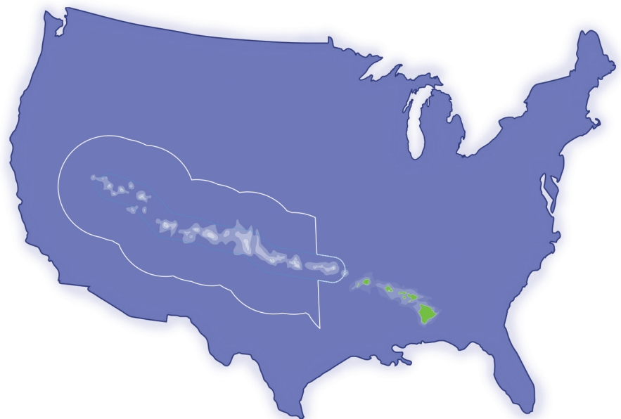
FIGURE 5. Overlay of Papahānaumokuākea Marine National Monument (outlined in white) on top of the continental United States. Graphic by Papahānaumokuākea Marine National Monument.

As climate impacts have become more widely understood over the past decade, government agencies and nongovernmental organizations have been working to develop and deliver training materials focused on climate adaptation strategies for resource managers. Here too, the understanding of the science and tools available to marine managers, and focused training efforts, have lagged behind terrestrial counterparts. However, in 2018 the USFWS National Conservation Training Center (NCTC) began a partnership with NOAA to adapt a core course on climate adaptation—“Planning for a Changing Climate”—into a version with a coast-