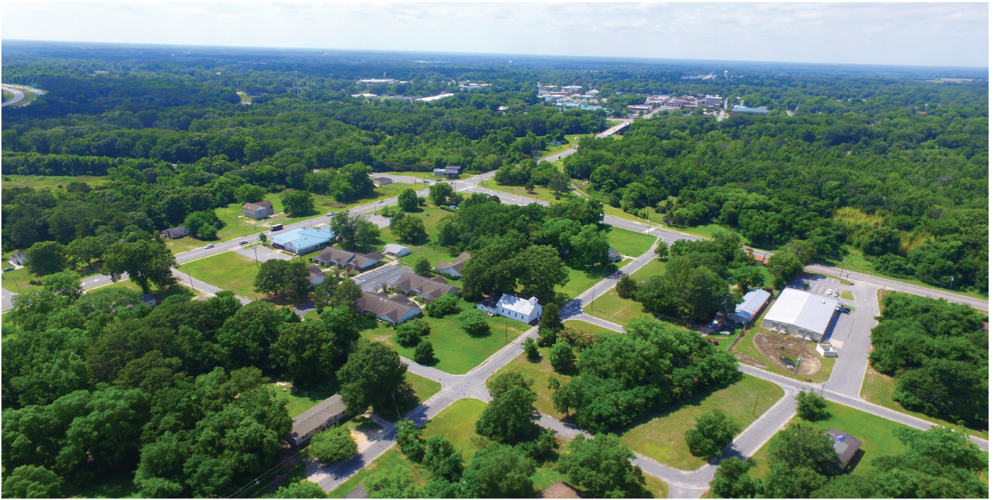
FIGURE 3. Princeville, summer 2018. Church Street is in the middle of the image, running bottom left to upper right. Main Street is the road running parallel to and above Church. The town of Tarboro is visible at top, across the bridge spanning the Tar River.

Princeville’s sites of memory include Freedom Hill, where the earliest residents gathered to escape bondage and then to build their own town; Shiloh Landing, a bend in the Tar River where people were delivered into the brutal eastern North Carolina slave economy; Church Street, where children walked to school and ran from porch to porch; and the Tar River baptismal site, the spit of land below the bridge into Tarboro that was the destination of white-robed processions of local churchgoers from 1890 to 1950.