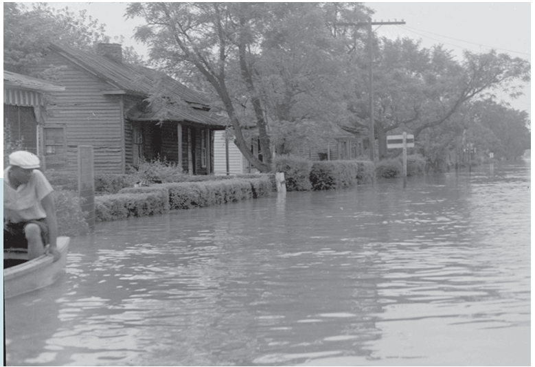
FIGURE 2. Flooding in Princeville on Main Street, 1958.