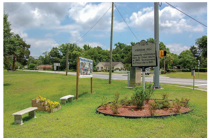
FIGURE 4. Local residents incrementally installed signage, seating, and flowers to mark Freedom Hill in the wake of Hurricane Matthew.

Princeville's experience after Hurricane Matthew has largely followed the timeline described in the Salvation Army report. Three years after the flood, the volunteer fire station had reopened, and some residents had rebuilt and returned. But Town Hall, Princeville Elementary School, Princeville Museum and Welcome Center, and Mount Zion Primitive Baptist Church were closed and awaiting renovation. A handmade sign on Freedom Hill reads: "Princeville Is Coming Back" (Figure 4).