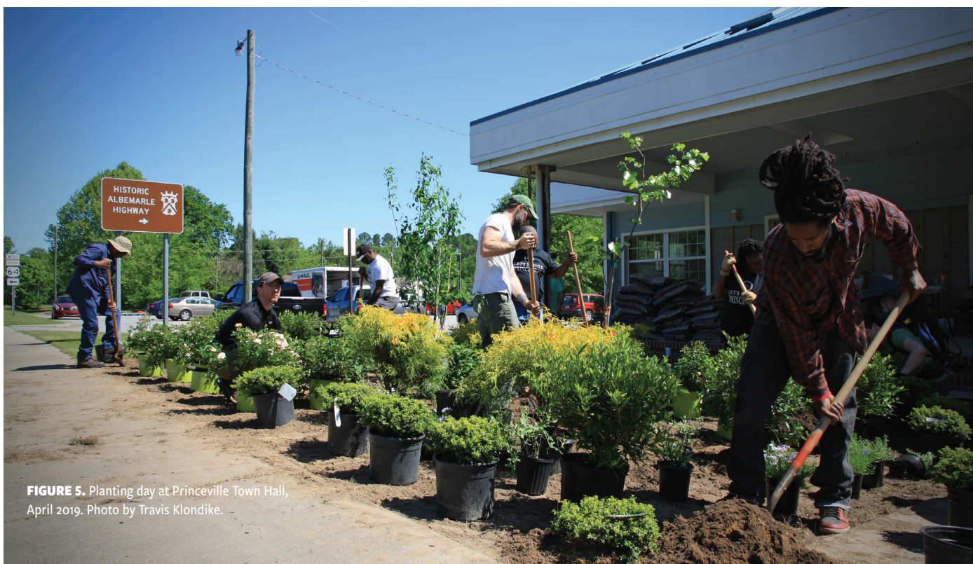
FIGURE 5. Planting day at Princeville Town Hall, April 2019.

In April 2019 volunteers from Princeville and NC State planted a garden of white- and blue-blooming trees, shrubs, and perennials in front of the still-shuttered Town Hall (Figure 5). Cars driving by honked in appreciation, and the volunteer fire department committed to water the plants regularly with the fire engine hose. In August, NC State's summer design-build studio