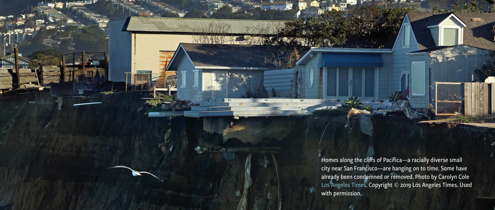
Homes along the cliffs of Pacifica—a racially diverse small city near San Francisco—are hanging on to time. Some have already been condemned or removed.

rise by 2100 (Griggs et. al. 2017). While addressing vital infrastructure is a critical focus of most of the planning work, lands in public trust along the coast are at the greatest and earliest risk. Our fear is that much of our extraordinary coastlands within the state park system, managers of 280 miles of the spectacular 1,100-mile California coast, could largely be lost. These are a part of the fragile open spaces, natural wonders, and coastal meccas that have been preserved for over a century in federal, state, county and regional parks. They include areas where hundreds of millions of tax dollars have been spent, and on which California’s $664 billion coastal economy depends. According to the National Ocean Economics Program, “California’s 19 coastal counties generated $662 billion in wages and $1.7 trillion in GDP in 2012, which both account for 80 percent of their respective state totals” (ERG 2015: 1). It is our conviction that the potential loss of these beaches, from an ever-expanding and heating ocean combined with extreme tidal surges, demands a robust public response which, to date, has not emerged.