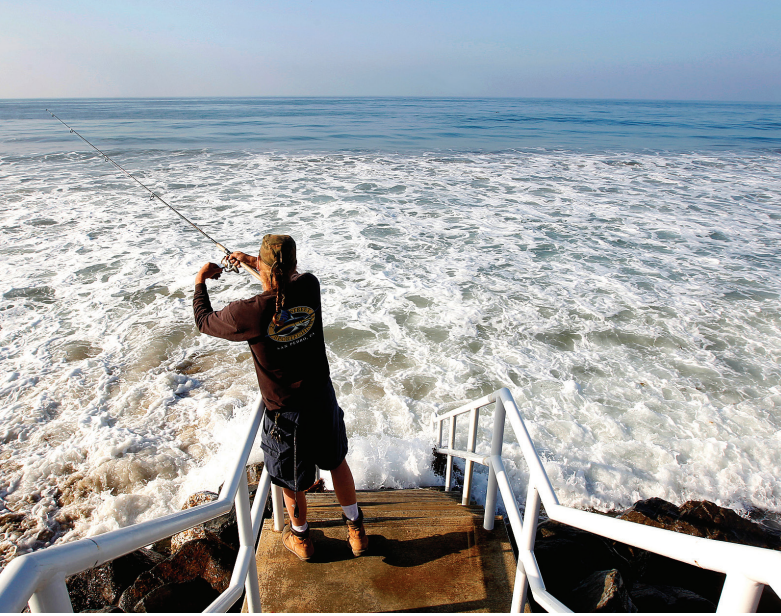
A rock wall protects homes along Broad Beach, which is more narrow than broad these days. Stairs to the beach often drop straight down into water during high tide. Photo by Christina House / Los Angeles Times. Copyright © 2019 Los Angeles Times. Used with permission.

the federal government as the current administration “inside the beltway” continues their attack on climate science. Mention of “climate change” has been eradicated from federal science reports, government websites, and press releases (e.g., Waldman 2019). Furthermore, all climate change research by federal agencies governing parks and public lands has essentially been placed on a temporary moratorium by the administration, including unjustifiable gag orders being inflicted upon