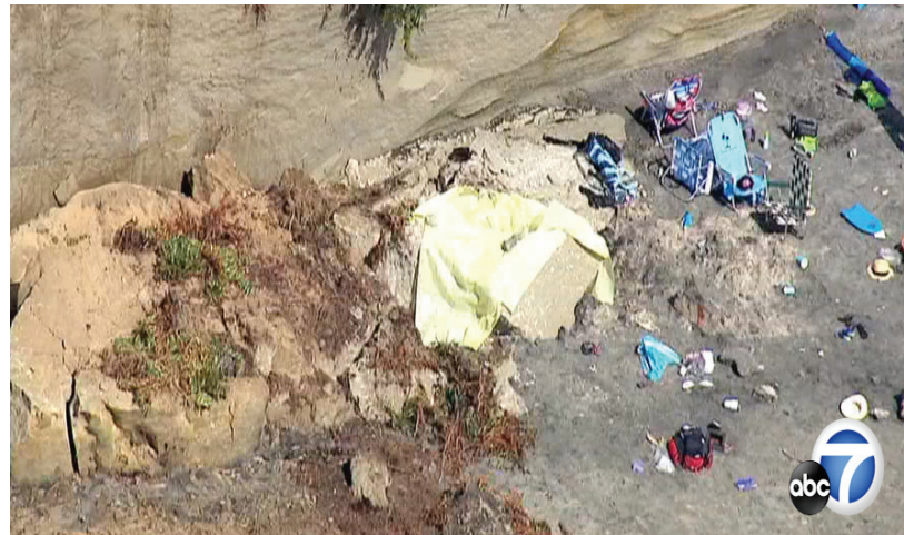
Deadly cliff collapse: Three killed after bluff falls onto beachgoers near San Diego.

On August 2, 2019, a cliff collapsed at Leucadia State Beach, near Encinitas in southern California. Three women were killed while enjoying a beautiful summer day. The evening before, those walking in the area noticed that the rising tide had essentially eliminated the sandy beach, and that the ocean was pounding the fragile, sandstone cliffs along the shore. In spite of what appeared to be a dangerous situation, beachgoers filled the area the next day, disregarding cautionary visitor use signs and other warnings. They did what people do throughout California—and the world—every day, seeking out the beauty, recreational opportunities, and the pure joy of a leisurely day at the beach. However, we are extremely concerned and disheartened that tragedies like what occurred in Encinitas will become more common, and that irreplaceable opportunities are disappearing as sea levels rise and the responding coastal armoring and seawalls gradually threaten, and ultimately erase, public parks along our coasts nationwide.