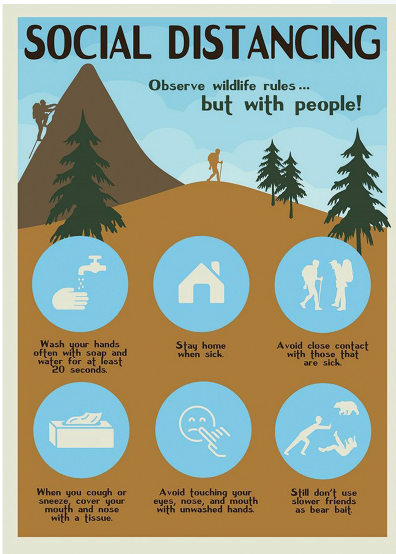
Covid-19 safety poster, website of Saint-Gaudens National Historical Park.

elements of a mitigation strategy for widespread environmental disruption. These plans all hinge on a common assumption that we can marshal the social cohesion and political will to act. But there are daunting prerequisites for such a mobilization. As Jon Jarvis made clear in the inaugural issue of Parks Stewardship Forum , we need “a more peaceful, equitable, and cooperative planet” if we are to have “a viable future.”