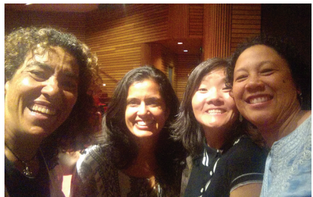
Participants at the PGM ONE Summit, Berkeley, CA, 2019.

There are many more angles that could be included to help connect more dots. For instance, while exposure, experience, and experiential learning in