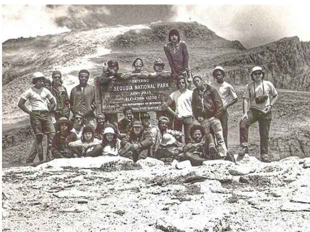
Outward Bound group at New Army Pass, Sequoia National Park / Inyo National Forest, circa 1970s

Furthermore, well-intentioned professionals should exercise caution when making the statement “it’s the right thing to do.” We will all embrace that line when this work is connected to the bottom line. Any agency, Green Group (non-profit or federal agency), or individual who engages in JEDI work because they believe it is the “right thing to do” is doomed to fail. Any professional commitment to JEDI must be grounded in an organization’s mission and vision and unquestionably tied to their bottom line. Without putting up the necessary resources to succeed and prove one’s dedication to the change and progress being made, agencies are destined for a tailspin. Otherwise, whenever the “real work” has to be done, resources (time, people, money) get pulled away and diversity digresses. The human dimension across cultures gets the short end of the environmental stick when it comes down to the proverbial “budget crisis” or “we can’t afford it.” The coincidence of how the “it” routinely per-