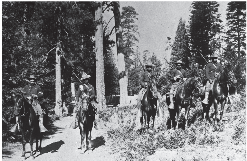
Buffalo Soldiers in the 24th Infantry carried out mounted patrol duties in Yosemite National Park, 1899.

On the federal government level, we acknowledge the history of segregation on public lands and conflicts that sometimes arose among, and between, users and land managers as a result of