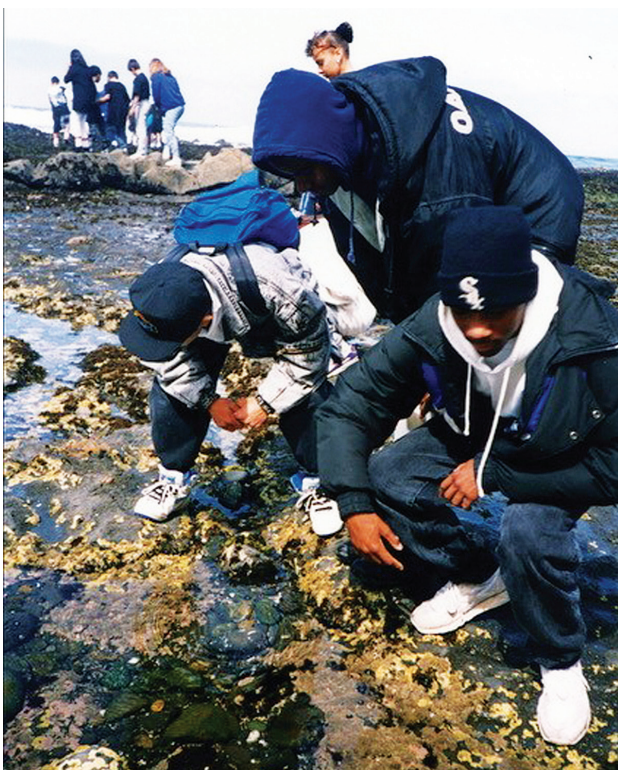
Young Brothers from East Oakland enjoy tide pooling at Point Reyes National Seashore, circa 1990.