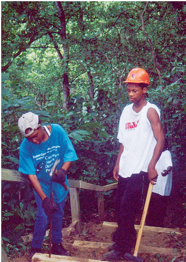
Students in SCA’s Conservation Career Development Program learning to build steps on a trail .

The National Hispanic Environmental Council was founded in 1997 as a policy, program, and advocacy organization that works to ensure Latinos have a voice and a seat at the national environmental