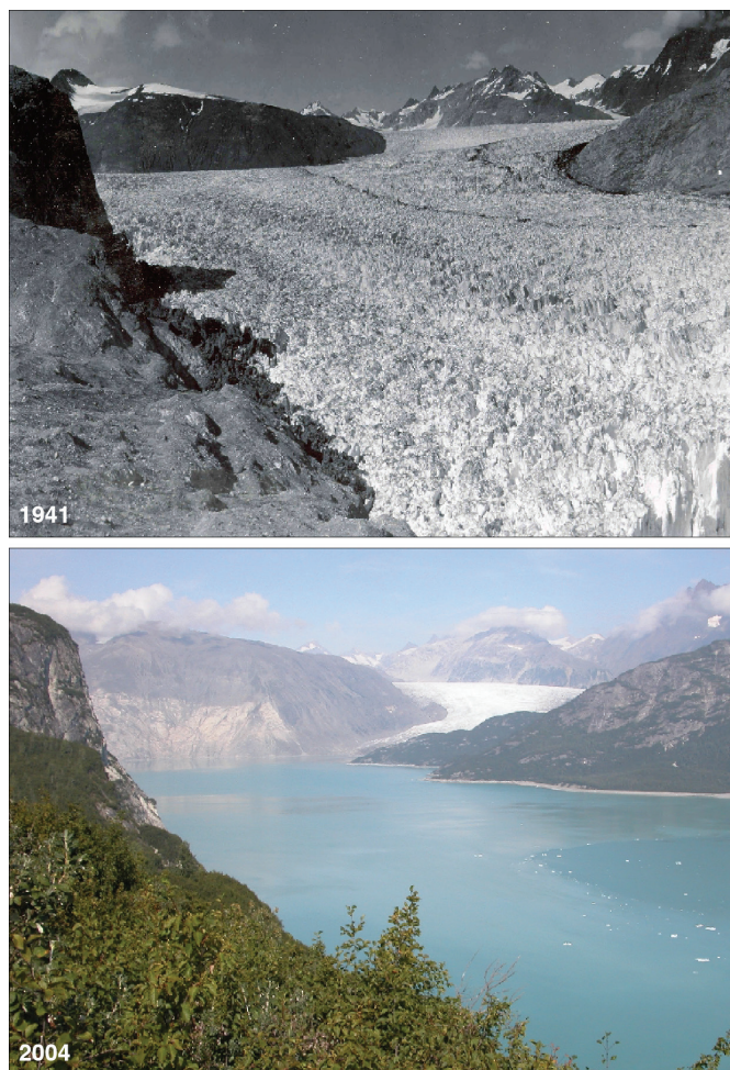
FIGURE 2. Muir Glacier, Glacier Bay NP on August 13, 1941 (photo William O. Field, courtesy of the National Park Service, National Snow and Ice Data Center, and US Geological Survey) and on August 31, 2004 (photo Bruce F. Molina, courtesy US Geological Survey). Photos aligned by P. Gonzalez. From 1948 to 2000, climate change melted 640 m in depth from Muir Glacier at its lowest extent (Larsen et al. 2007; Marzeion et al. 2014).

Across the southwestern US, the increased heat and aridity of human-caused climate change account for half the magnitude of a regional drought from 2000 to the present that has been the most severe drought since the 1500s, reducing soil moisture to its lowest levels since that time (Williams et al. 2020). In California, the most severe drought in a century of weather station measurements occurred from 2012 to 2016, caused by the hottest annual average temperature in the period 1896–2014 and near-record low rainfall and snowfall (Diffenbaugh et al. 2015). The high temperatures of climate change accounted for one-tenth to one-fifth of the magnitude of the California drought (Williams et al. 2015). In the Colorado River Basin, the high temperatures of climate change have combined with low rainfall and snowfall to cause a drought from 2000 to the present that is the most severe since the start of weather station measurements in 1906 (Udall and Overpeck 2017; Xiao et al. 2018).