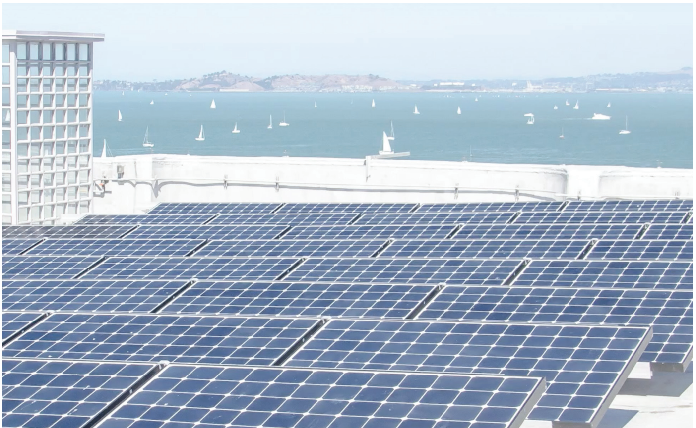
FIGURE 6. Solar energy array on Alcatraz Island in Golden Gate NRA that helped the park reduce carbon emissions 25% from 2010 to 2015 (NPS 2016).

Reducing CO 2 emissions can avert the most extreme temperature increases in national parks in the future. The IPCC emissions reduction scenario (RCP2.6), in which the world would meet the Paris Agreement goal, would lower projected heating in national parks by two-thirds by 2100, compared with the highest emissions scenario (RCP8.5) (Gonzalez et al. 2018). The reduced heating could produce substantial benefits on the ground. While the highest emissions scenario puts 16% of plant and animal species globally at risk of extinction, the risk drops to 5% under the emissions reduction scenario (Urban 2015). Similarly, global sea level could rise 84 cm (33 in.) under the highest