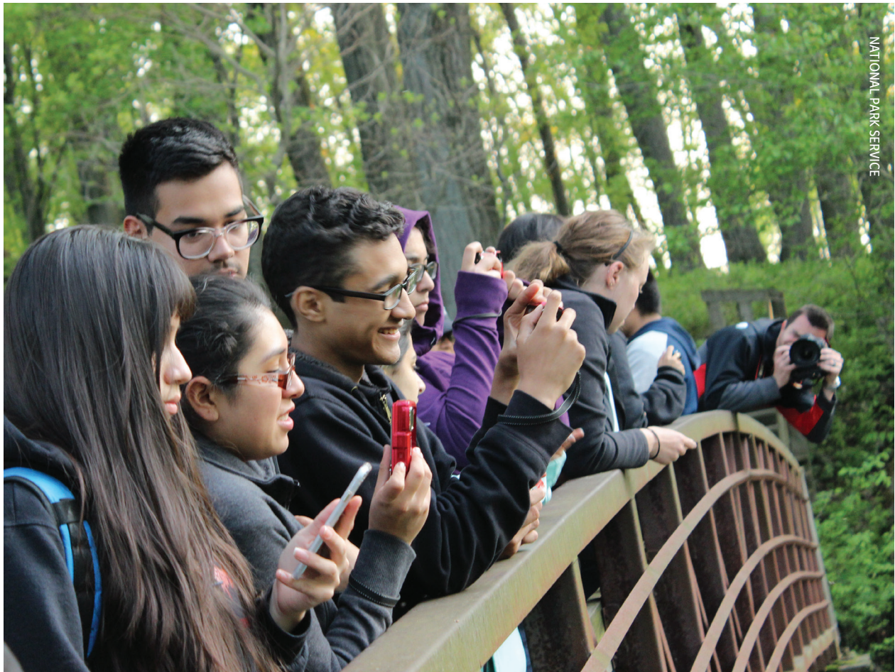
High school students from Phoenix Military Academy capture images of climate impacts during a photo hike in Indiana Dunes National Lakeshore (now, National Park) during the 2016 Climate Change Academy program.

Phoenix Military Academy (Chicago, Illinois). The Phoenix Military Academy is a public military high school just west of downtown Chicago. Of the 560 students, 96% come from low-income homes; 8% have some type of disability and 3% are English language learners. Ninety-nine percent of the students do not identify as white or Caucasian (Illinois State Board of Education 2017). We selected 22 students to participate in the pilot project at Indiana Dunes.