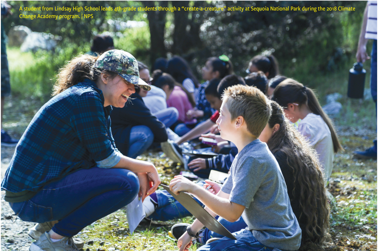
A student from Lindsay High School leads 4th-grade students through a “create-a-creature” activity at Sequoia National Park during the 2018 Climate Change Academy program.

accessible for the fourth grade participants, so a shorter version focused on the one-day pilot program was administered to all fourth grade participants.