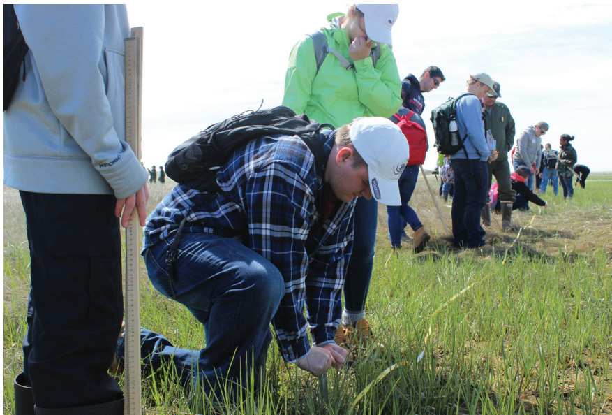
Students from Minuteman High School learn to take salt marsh cores at Cape Cod National Seashore during the 2016 Climate Change Academy program.

This field note illustrates the impact of one project, the Climate Change Academies, which launched in