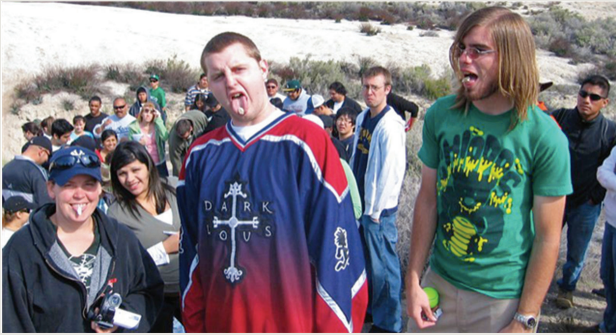
Community college geology field trip to the San Andreas Fault, California, circa 2006. Three students showcase the “sticking power” of what they learned about porous Earth materials.