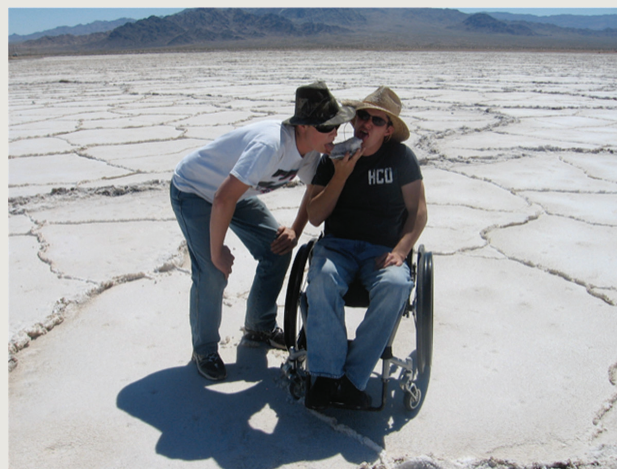
Community college geology field trip to the Mojave Desert, California, circa 2008. Two students “getting a taste for” geology as they lick their freshly collected sample of salt crust from a dry lake bed.

Grand Canyon Expedition (GCX) was launched in 2012 as a series of three smart-device apps to teach introductory geoscience concepts through augmented reality field trips. After their launch, we assessed these apps for their impact on student engagement (Bursztyn, Shelton et al. 2017) and on student learning (Bursztyn, Walker et al. 2017). The testing phase alone initially resulted in introducing GCX as a learning tool to nearly 1,000 students (and their respective instructors) at four institutions in different states. Following the publication