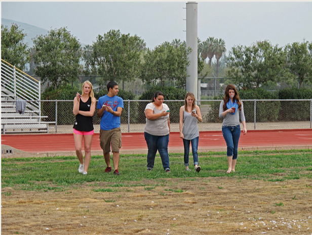
Community college students walking the soccer field with cell phones in hand. All students are playing GCX.