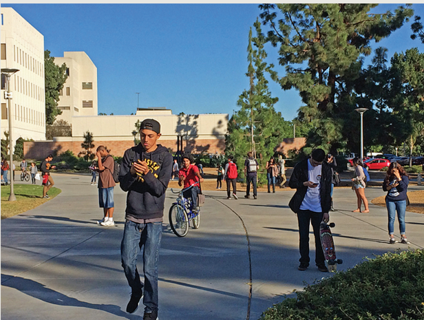
University students standing, walking, and biking the quad with cell phones in hand. Some students are playing GCX (can you identify which? I can't).