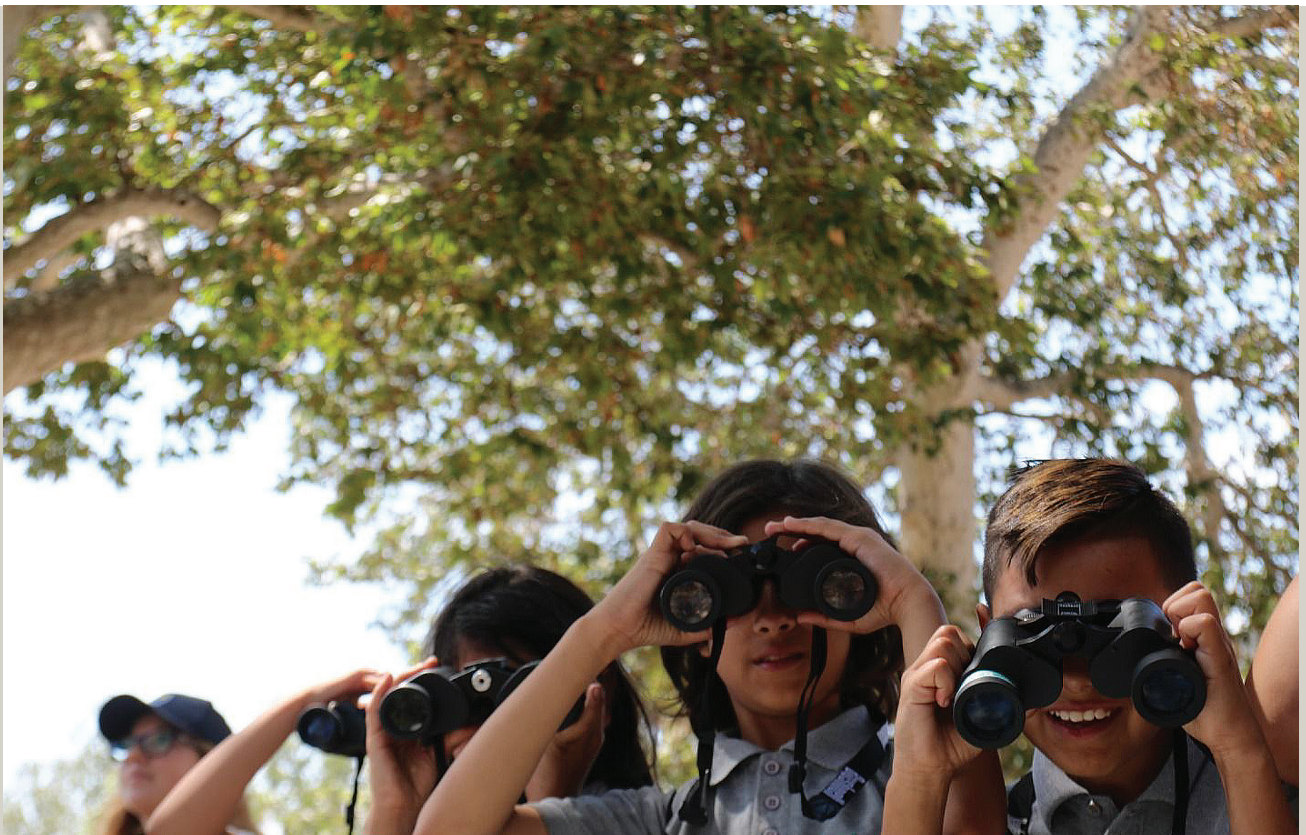
Open Outdoors for Kids participants utilizing binoculars for scientific observation, Santa Monica Mountains National Recreation Area.