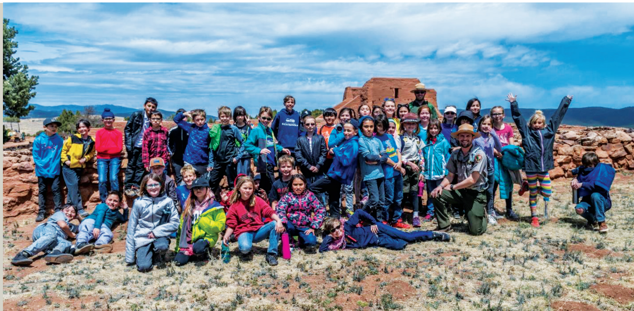
School kids celebrating a field trip to Pecos National Historical Park.

and learned about the history of the site as they participated in educational activities with rangers and volunteers. More than 100 students were able to participate in this program.