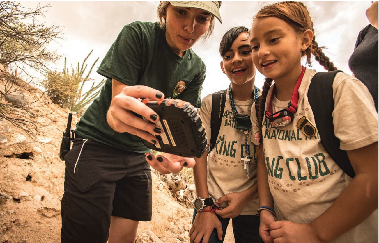
Field trip participants to Saguaro National Park.