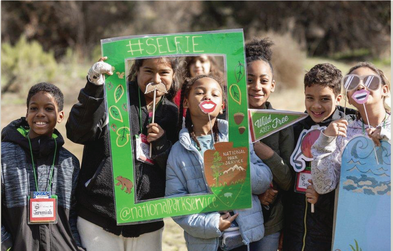
Open Outdoors for Kids participants enjoying their field trip to Santa Monica Mountains National Recreation Area.