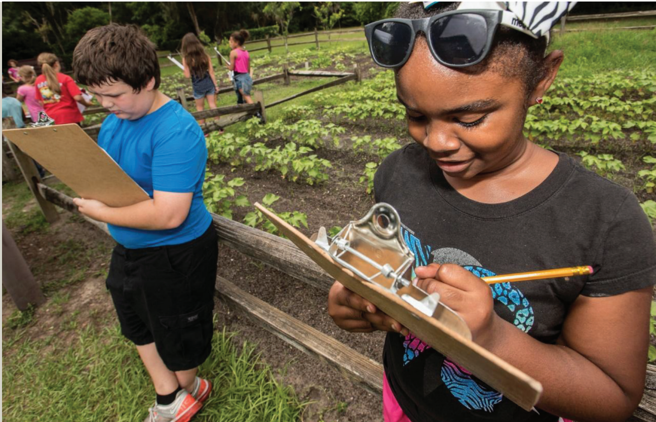
Students note their observations in the field at Kingsley Plantation, Timucuan Ecological and Historic Preserve (USNPS), near Jacksonville, Florida.

percent said they definitely would come back and another 19% said they probably would come back (Applied Research Northwest 2019b). Though the program’s evaluation reports query only intention to return, research studies on increasing inclusion on public lands suggest factors that contribute to these responses. These include the fact that (a) students can envision themselves in parks, (b) activities are carefully planned to be accessible and provide students with skills and knowledge necessary to accomplish them, and (c) park staff are welcoming and inclusive (Markle et al. 2019). A teacher participant who participated in an Indiana Dunes National Lakeshore [now National Park] field trip supported these points saying, “The park did great on building relationships with kids and helping kids build an understanding, and even a love for, nature” (Applied Research Northwest 2019b: 26).