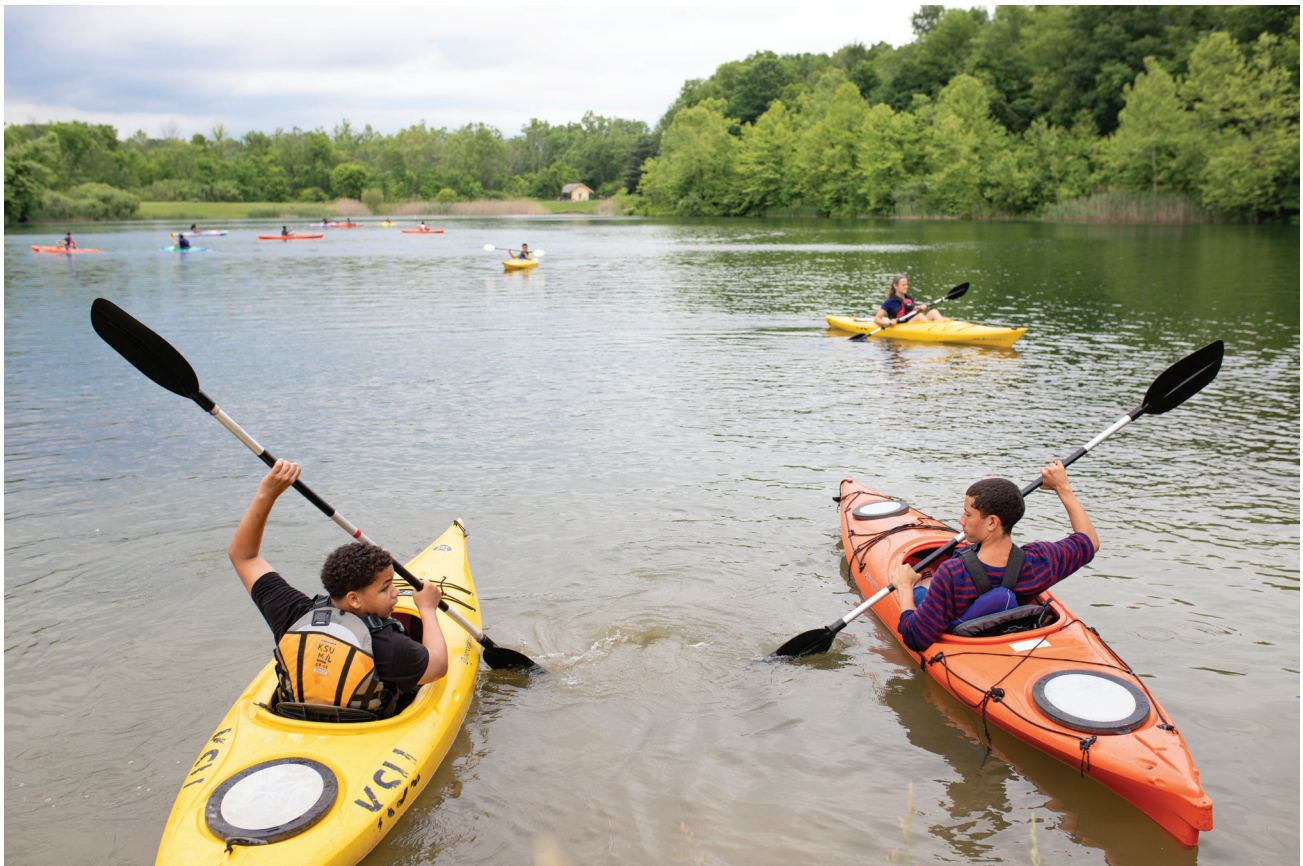
Students kayaking on the Cuyahoga River.

From the beginning, NPS and nonprofit staff agreed that engaging the community was critical to