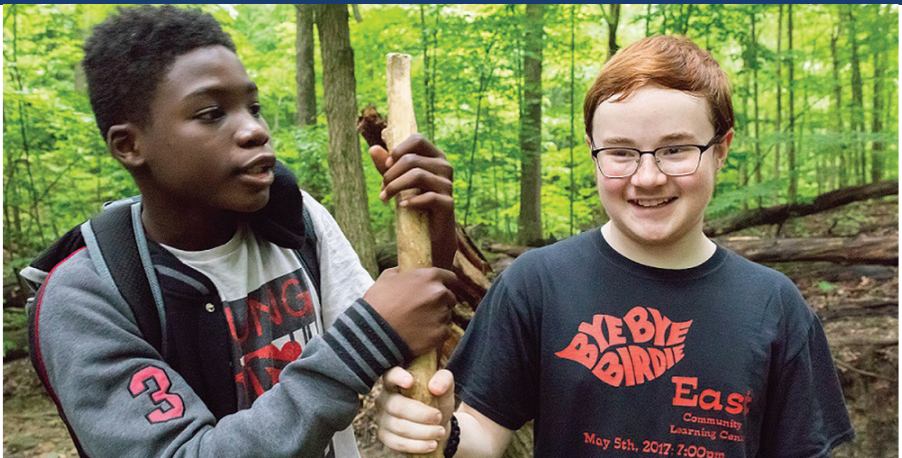
Boys hiking during program at the national park. | Zaina SalemPhoto ↓