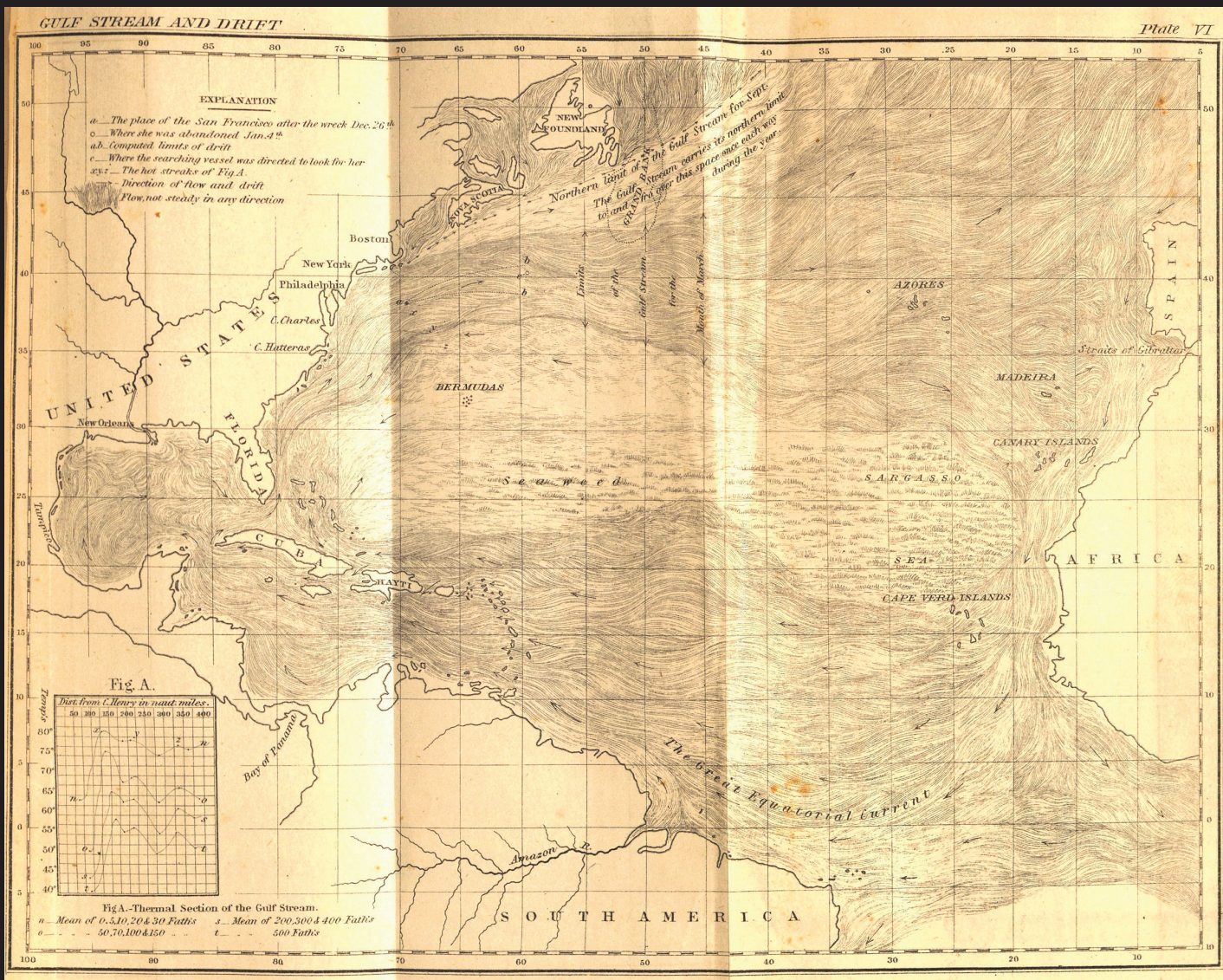
Gulf Stream chart from Maury's The Physical Geography of the Sea .