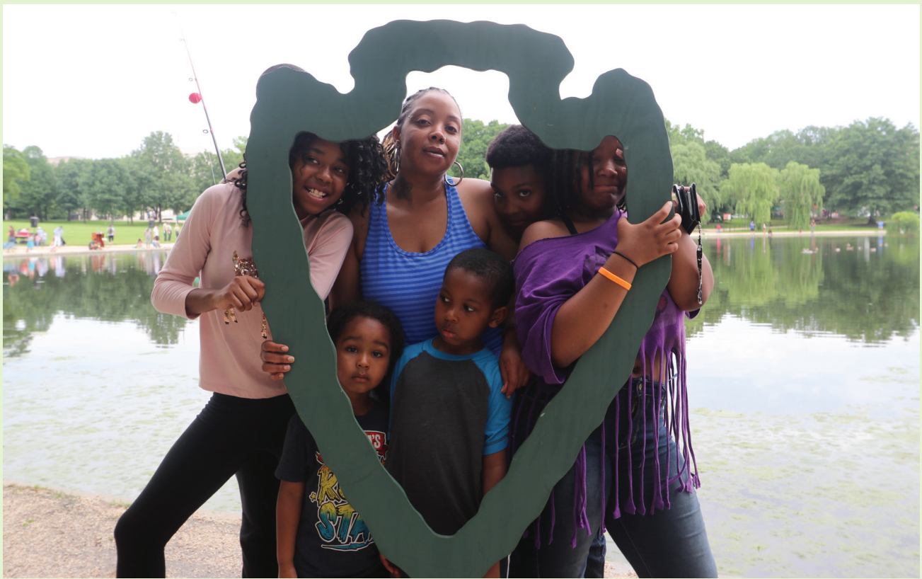
Family at Urban Kids Fishing Derby on National Mall

pandemic we have seen that when there is less traffic, the air is cleaner, the night skies are clearer, and you can see the stars more vividly. Waterways lose their turbidity and become crystal clear. You can see the fish. All that is becoming more visible in the natural world is beginning to stir in many of us a new consciousness that there are a few things we need to change in order to build back a stronger, healthier, and more sustainable world. And perhaps this pandemic has demonstrated that, through sustained cooperation and commitment to advancing and protecting the role of parks as a health resource, we can provide these precious resources for generations to come.