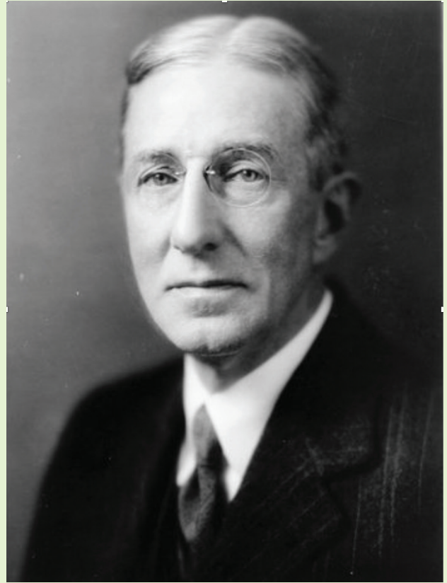
The partnership between the National Park Service and the US Public Health Service was formalized in 1921 during the tenure of NPS Director Stephen T. Mather (left) and Vice Admiral Hugh S. Cumming, the surgeon general (right).

The formal agreement was put in place between NPS Director Stephen Mather and Vice Admiral Hugh S. Cumming, the fifth US surgeon general. The intent was to provide sanitary engineers, physicians, and nurses of PHS to: