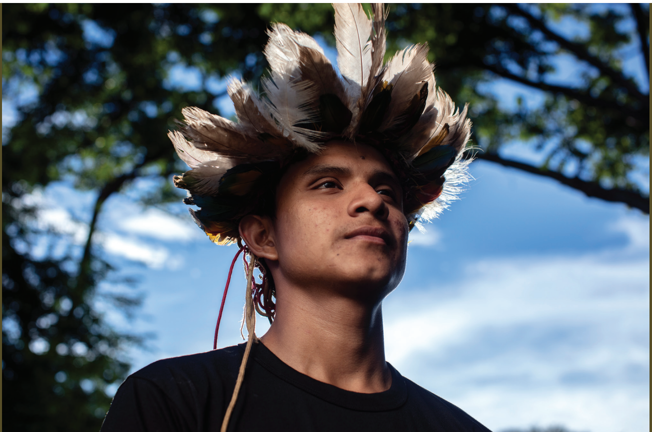
Brazilian ranger

Adequate numbers of competent, well-resourced, and well-led rangers are the foundation for effective management of most protected and conserved areas. The International Ranger Federation (IRF) defines “ranger” as a person involved in the practical protection and preservation of all aspects of wild areas, historic