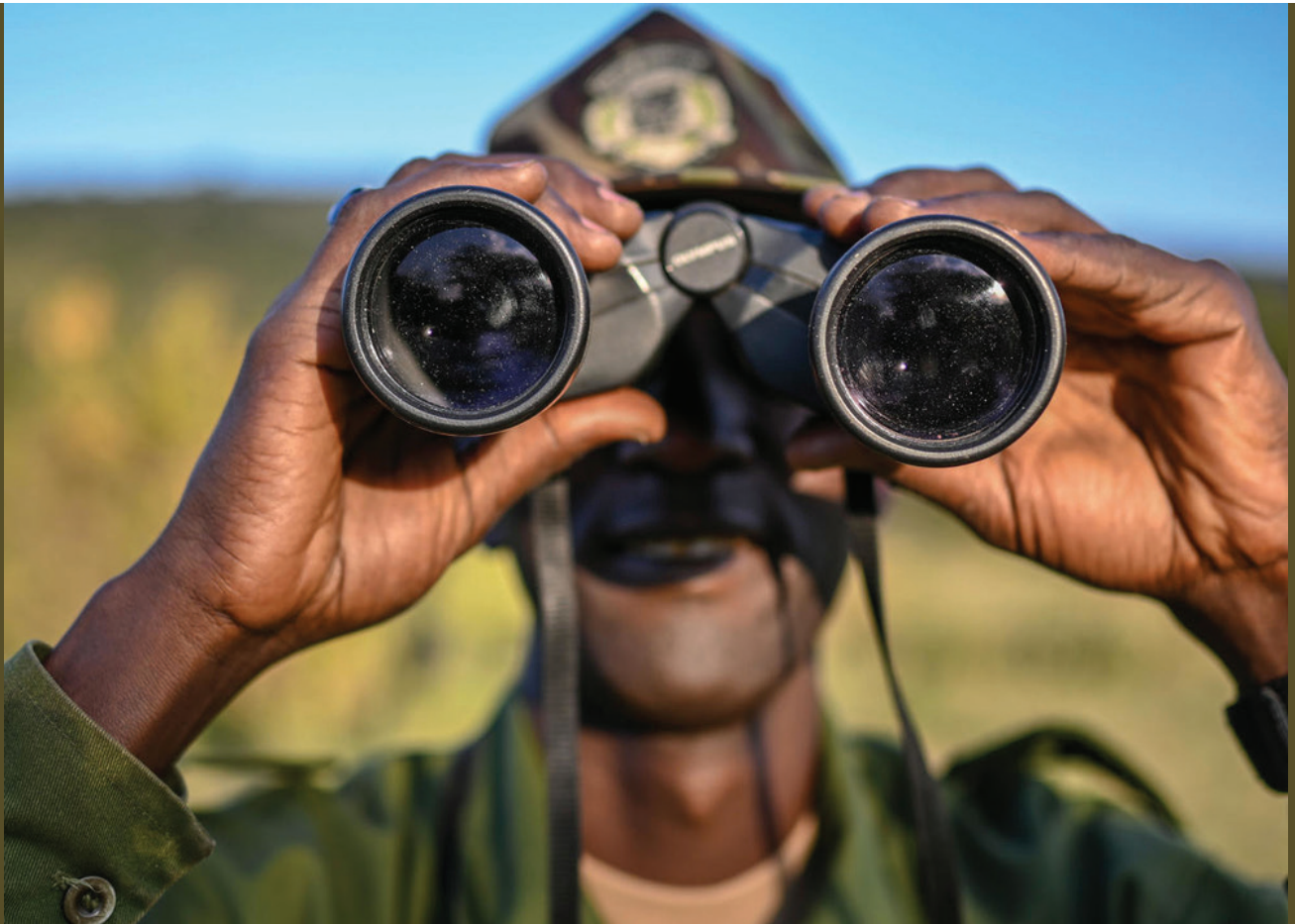
Kenyan ranger

Indigenous people and local communities and rangers are built, safeguarding all parties, and increasing collaboration, dialogue, and transparency.