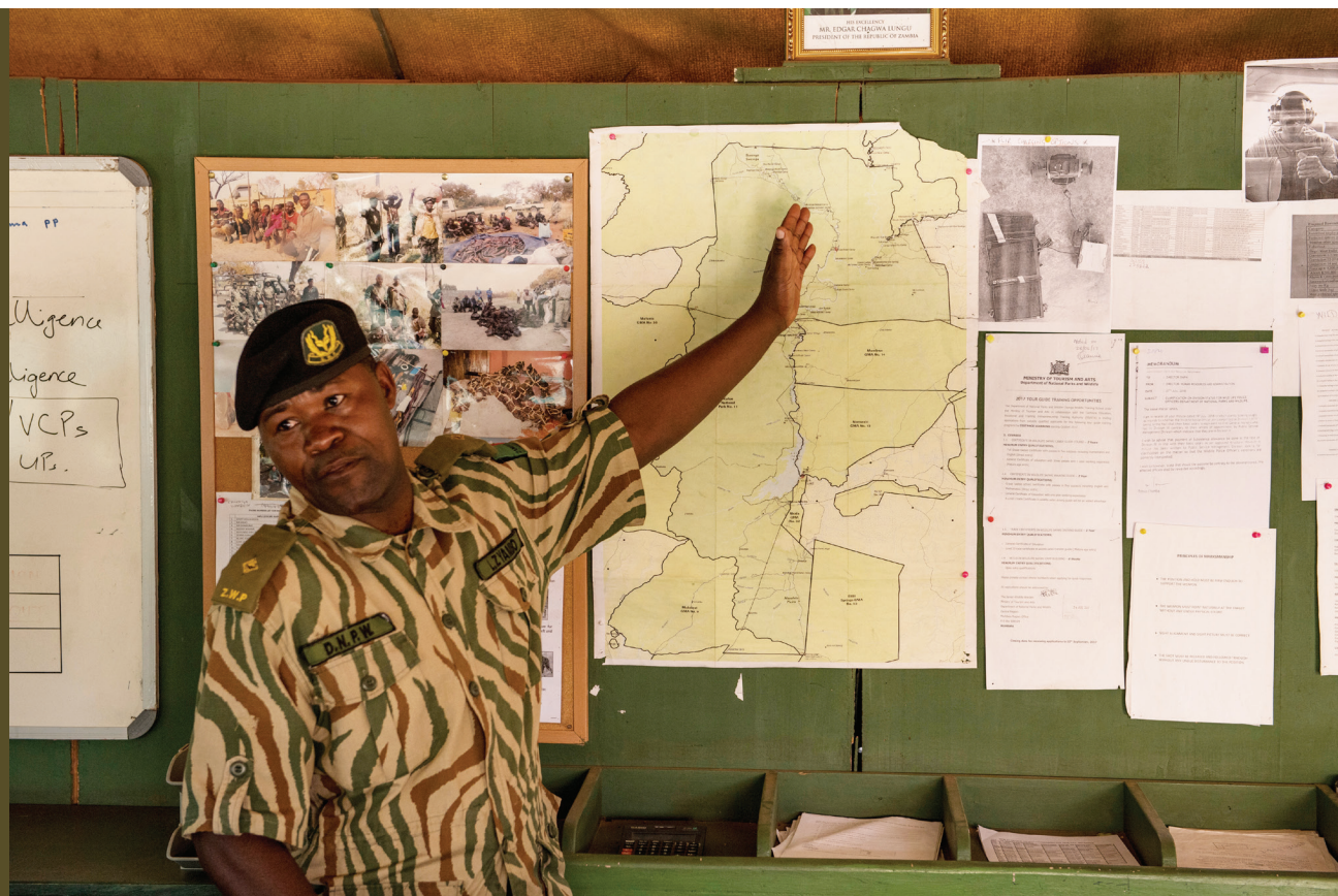
Zambian ranger

Internationally, the global extent of protected areas and other place-based conservation management solutions are set to increase both on land and at sea to 30% (UNSD 2015; CBD 2020). This is necessary to meet the growing threats to and demands on biodiversity at all levels. Consequently, there is demand for more well-trained rangers. In addition, it is important to engage effectively with Indigenous peoples and local communities (IPLCs) as full partners and local stewards of resources. This combination delivers the best outcomes for biodiversity conservation, protection of natural services, and preservation of the deep cultural knowledge embedded in these systems. This holds true for protected areas in all forms, including community conservation areas, private reserves, and Indigenous protected areas (Corrigan et al. 2018; Garnett et al. 2018; Courtois 2020).