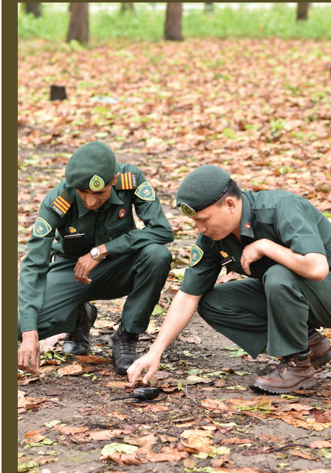
Bhutanese rangers | ROHIT SINGH / WWF

The supply chain for training programs, together with the demand side of the equation, is one of the most important items to be addressed early. There is a need to develop a list of training suppliers of all kinds for all levels of ranger work. In the time available to our team, we were not able to discern how much information is already known, although there has been a recent review of short courses (Chapple 2019) and a database of other training programs is being compiled by the same author.