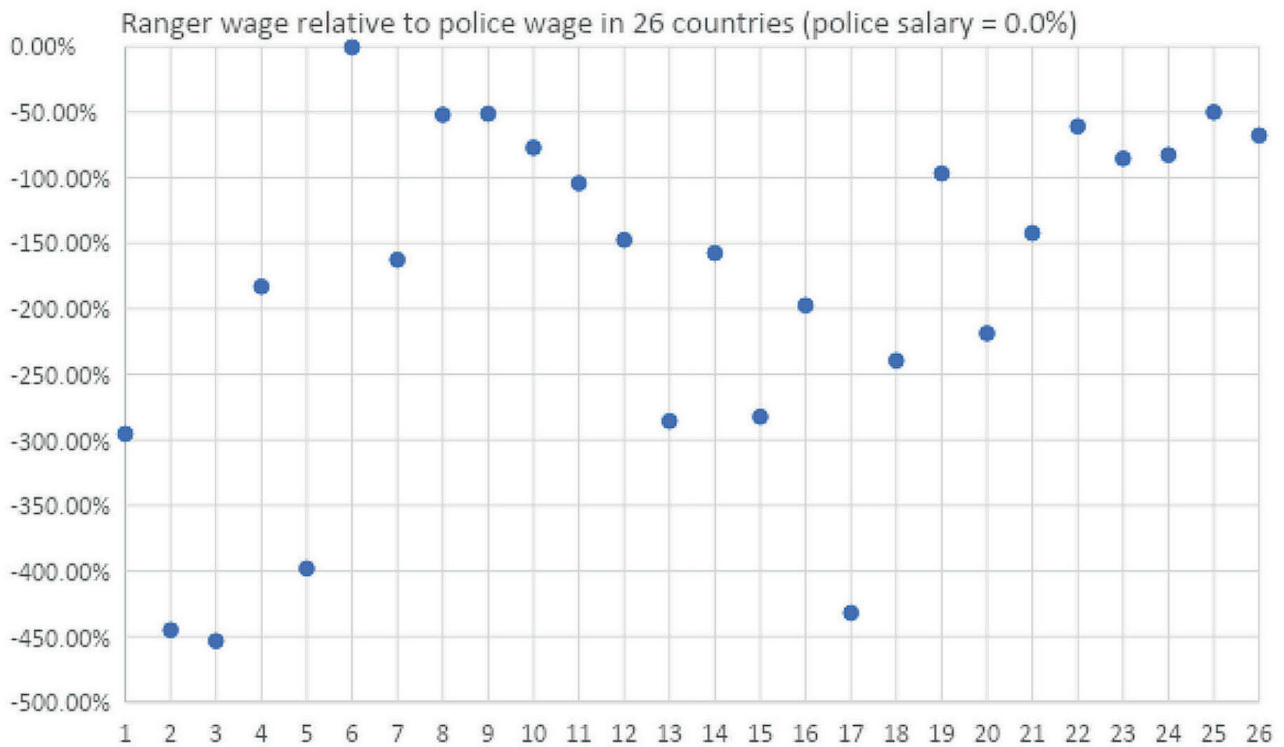
Figure 1. Ranger vs. police wage differential in 26 countries (Belecky et al. 2019). The other two countries that were part of the survey, Russia and China, were excluded from the analysis because the survey was not delivered at a national scale in them.

Considering that both police and rangers are public-sector employees tasked with enforcing and upholding the laws of the countries in which they work, the pay disparity should be seen as potentially damaging—both to the status of the sector (and its ability to recruit talent), and to perceptions of value and importance rangers associate with their own work and organizational goals. This comparison with police officers is further relevant in that there is no occupation more likely to drain rangers from the field, or to be compared with if rangers are going to lobby for wage increases.