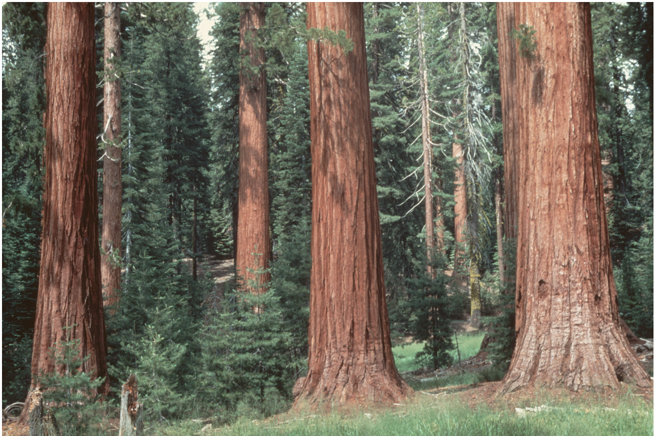
Mariposa Grove, Yosemite National Park

In mixed conifer forests in particular, it was generally impossible to reverse the effects of fire suppression