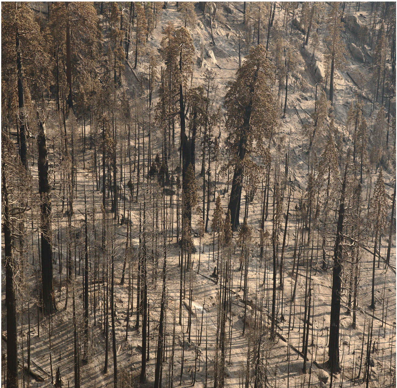
Giant sequoia groves burned during 2020 Castle Fire, Sequoia National Park

hundreds of thousands of acres of mixed conifer forests in national parks have burned by unnaturally intense wildfires, despite suppression efforts. Understanding the ecological impacts of these events, and incorporating this knowledge into revised fire program goals and objectives, will require the guiding hand of park resource managers and scientists.