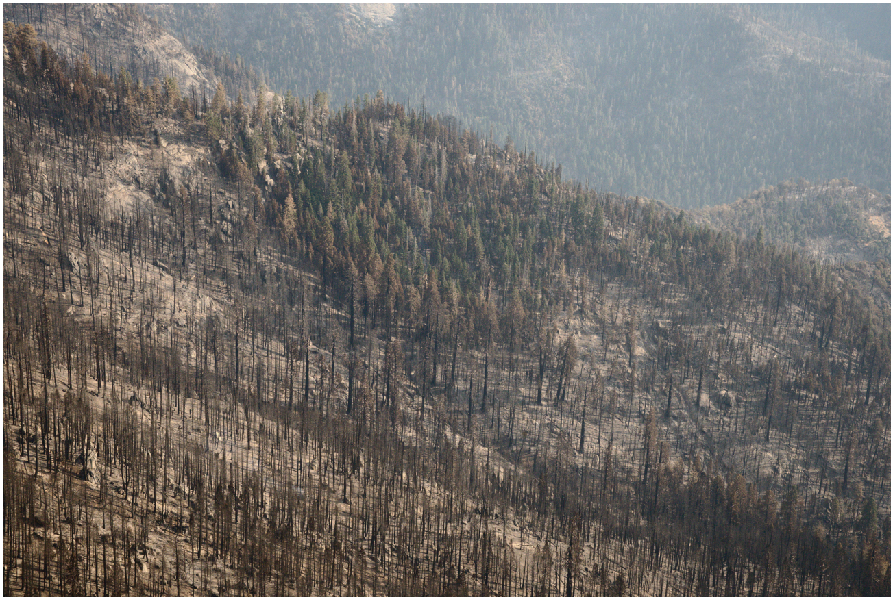
Giant sequoia groves burned during 2020 Castle Fire, Sequoia National Park

$1 billion for the federal fire management agencies. This increase greatly benefitted the wildland hazard fuels program and, for the first time, directed federal agencies to define the extent of wildfire threats to the Wildland Urban Interface (WUI, defined as up to 1.5 miles beyond the edge of developments) and develop programs to mitigate those threats. By 2006, the NPS hazard fuels budget rose to approximately $33 million. In contrast, the 1998 fuels budget was $7 million.