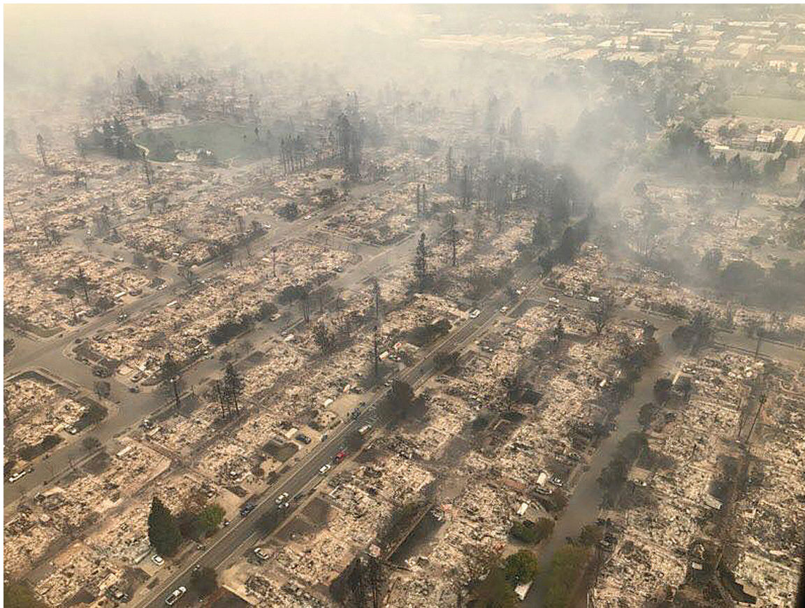
Coffey Park neighborhood, Santa Rosa, California, burned during 2017 Tubbs Fire.

The goal to mitigate risk aversion through shared participation can be achieved by developing interdisciplinary NPS teams, in addition to incident command team resource advisors, to manage these types of fires. In the 1970s and 1980s park natural resource managers were able to successfully manage prescribed fires and natural fires managed for