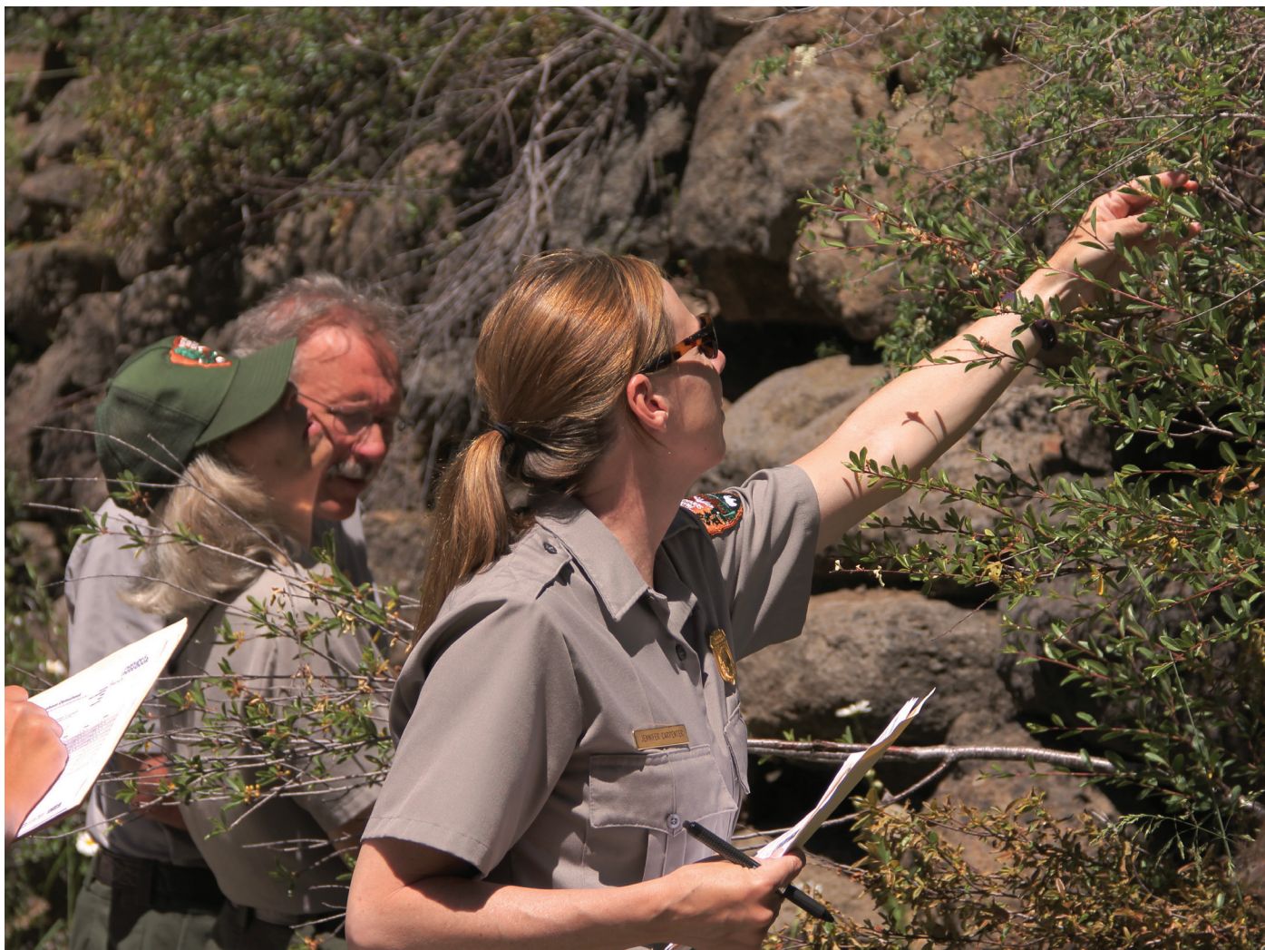
FIGURE 1. Park staff and volunteers learning how to monitor plant phenology at Lassen Volcanic National Park.

Our goals are to illustrate how national parks and their partners collaborate with USA-NPN to foster science and education in parks, and to invite and inspire