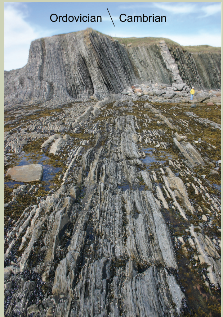
Figure 5. An important global stratigraphic site marking the Cambrian/ Ordovician boundary, Gros Morne National Park, Newfoundland, Canada.

The history of the earth since its origin 4,600,000,000 years ago is one of huge complexity and has only been deciphered through meticulous work by thousands of geologists over the last few centuries. It has been reconstructed by analysis and interpretation of evidence displayed in rock and sediment outcrops and boreholes in all countries of the world. And it is research that continues, with several new fossil species being discovered every year. In fact, the fossil record has demonstrated the evolution of life on Earth from the simplest unicellular organisms to the earliest evidence of humans. It follows from this that it is important to do all we can to conserve the