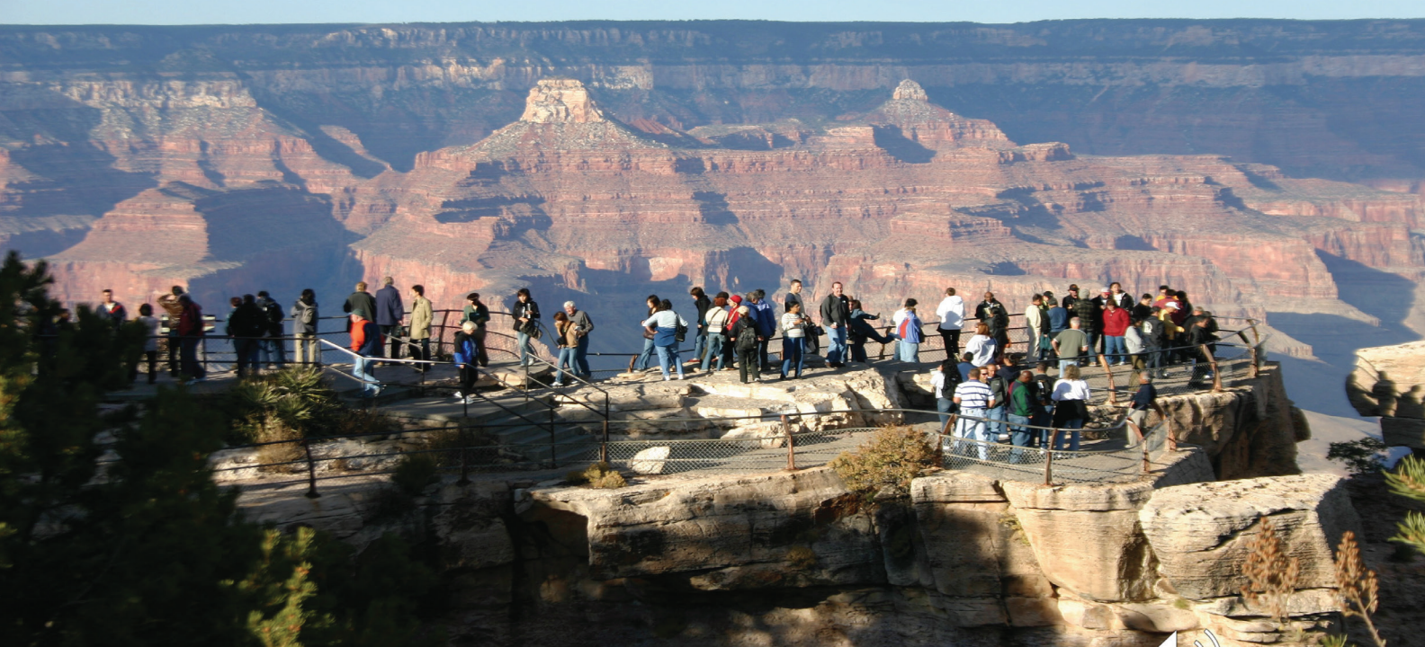
Figure 4. Part of the Grand Canyon’s attractiveness is its internal stratigraphic and topographic geodiversity.

canyon had been eroded into a single rock type it would still be an impressive feature, but a major attraction of the site is its internal stratigraphic and morphological diversity. The horizontal strata are of varying resistances resulting in a stepped vertical profile, while there is also an attractive, longitudinal, morphological diversity (Figure 4).