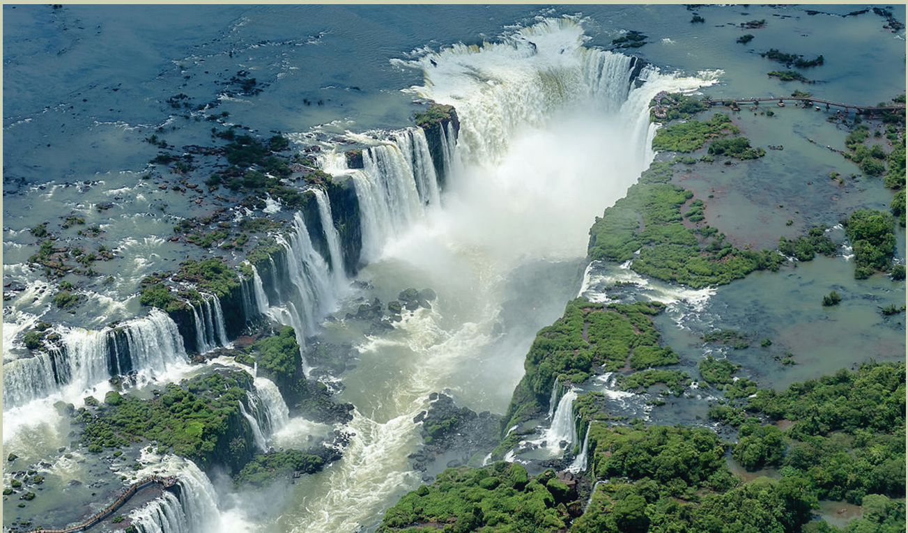
Figure 3. Part of the Iguazú Falls, a protected area on the Brazil/Argentine border.

In second place was the Grand Canyon, one of the world's most visited tourism locations. If the